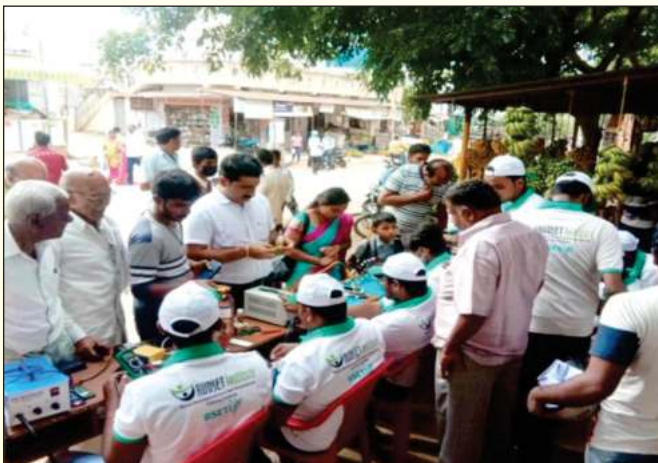
Trainees of Cell Phone Repairs & Service providing free service to public during the free service camp organised