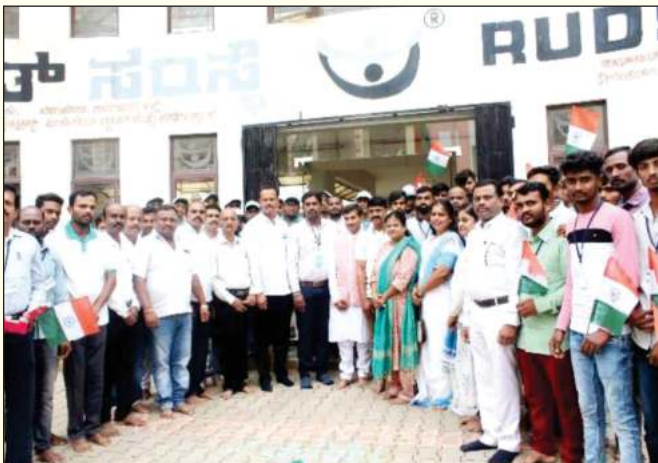
Members of ASARE and other trainees during Independence Day celebrations at the Institute premises