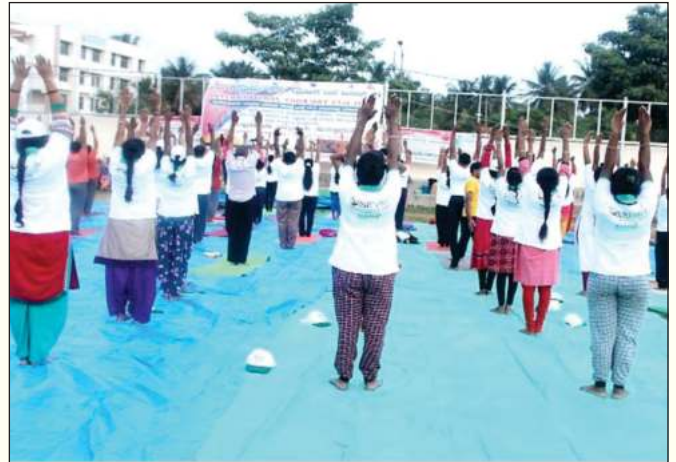
Trainees of our Institute are undergoing Yoga session as part of 'Intranational Yoga Day' held at Nelamangala