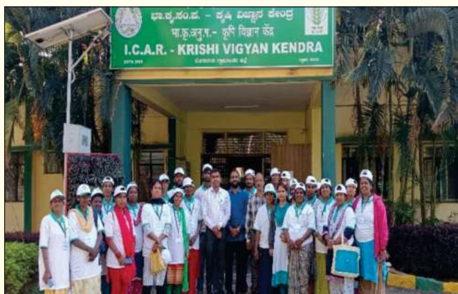
Trainees of Dairy Farming & Vermi Compost Making Training Programme under UNNATI during their field visit