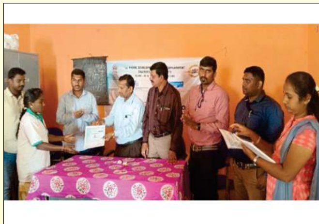
Trainees of Mushroom Cultivation are distributed participating Certificates