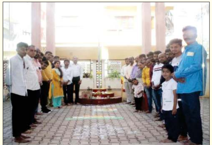
The Director, Staff Members and other trainees of on-going batches are seen during Republic Day celebration