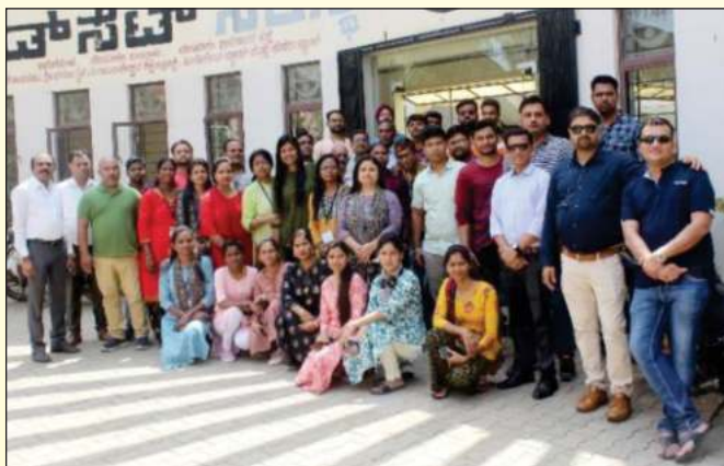
The RSETI Directors who are participating in the Trainers' Training Programme (TTP) conducted by NAR, Bengaluru on their visit to our Institute