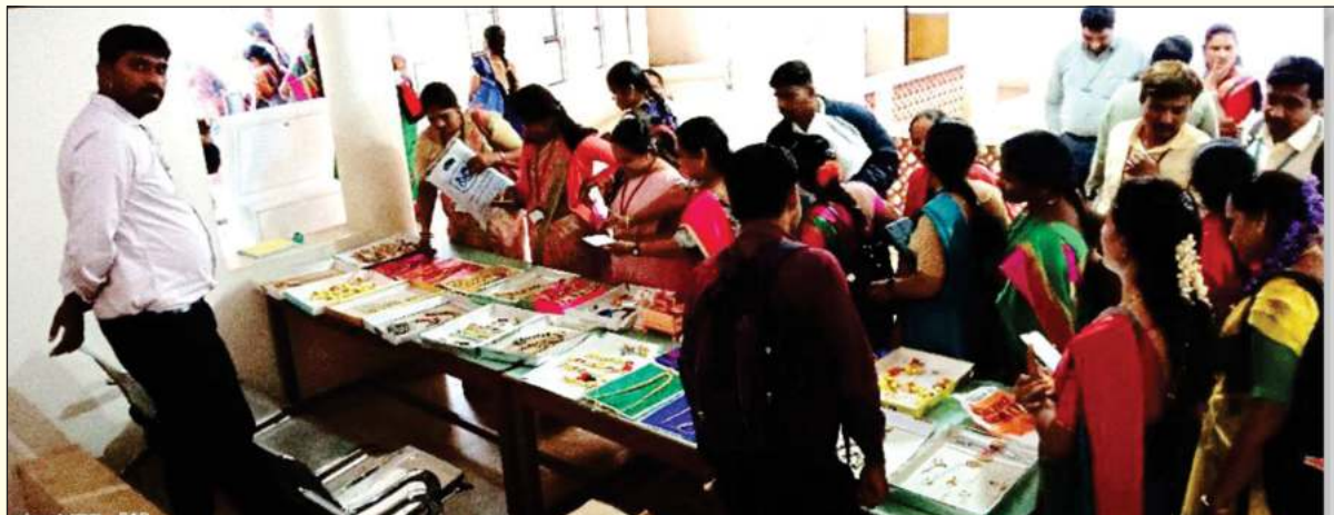
An Exhibition of the terracotta jewellerys prepared by the trainees of Costume Jewellery Udyami trainees at our Institute premises conducted