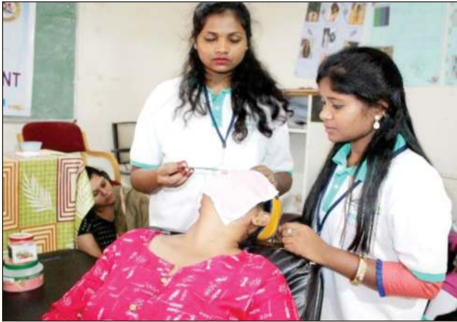
Trainees of Beauty Parlour Management are undergoing practicals