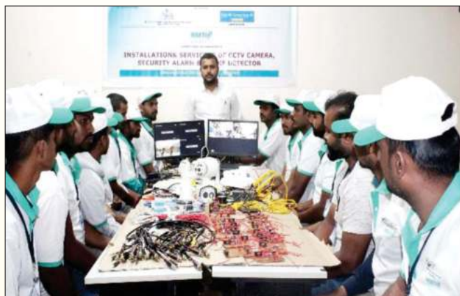
Trainees of CCTV, Camera, Smoke detector undergoing practical session during their training