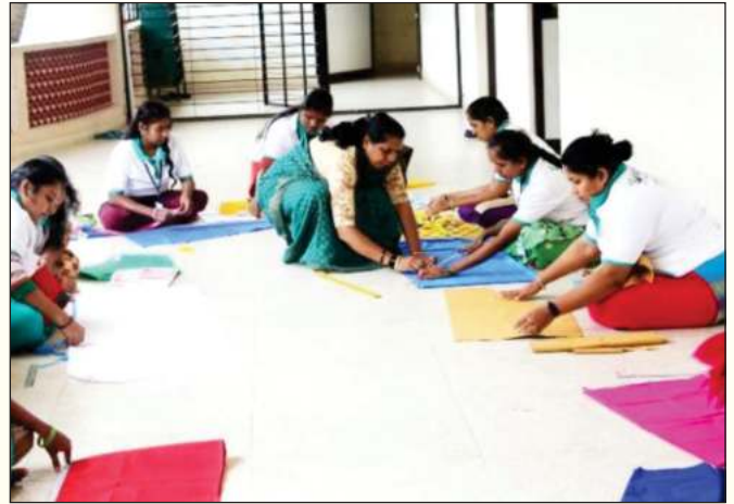
Trainees of Women's Tailor undergoing practicals