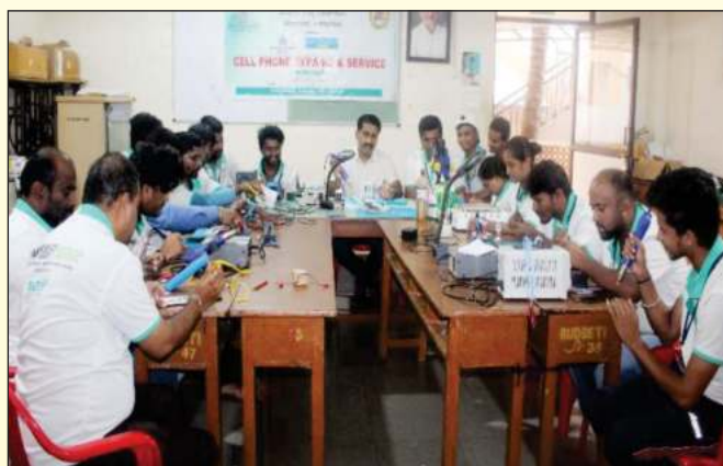
Trainees of Cell Phone Repairs & Servicing undergoing practicals during their training