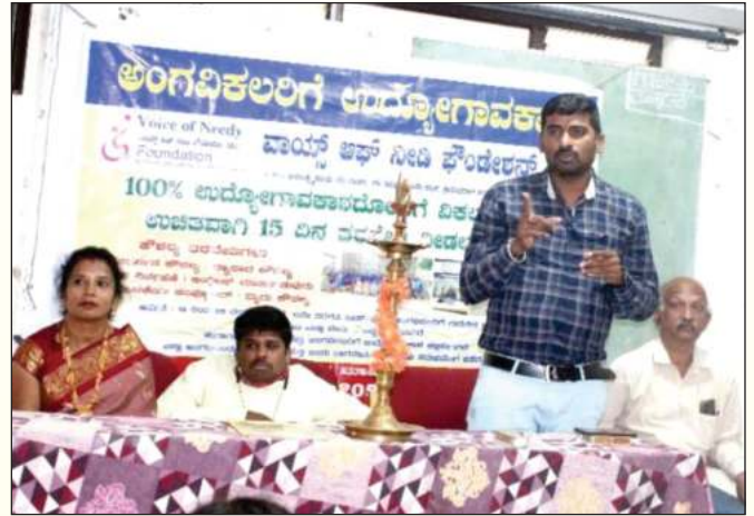
The Director inaugurating the 10-days EDP on Paper Cover, Envelope and File Making Training programme at our Institute