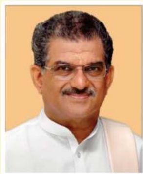
Dr D Veerendra Heggade President RUDSETIs, Dharmasthala