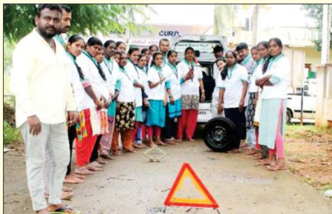
Trainees of LMV Owner Driver undergoing practicals during their training