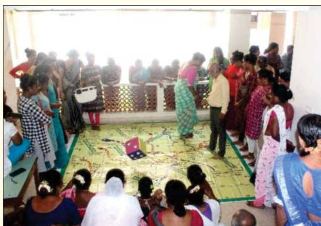
Transgender trainees undergoing Snake & Ladder game to understand savings habit to learn about Banking