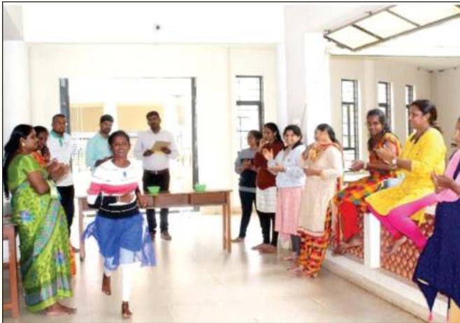
Trainees of Bank Mitra are undergoing simulation game to know about the strength of Team Building