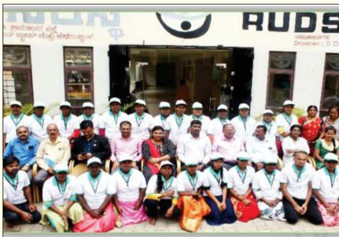
Trainees of LMV Owner Driver with CEO, ZP, Bengaluru Rural Dist and other DLRAC members during their visit to our Institute