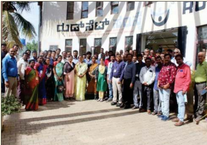
FLCRPs and RSETI Directors from different part of South India visited our Institute to know about our activities