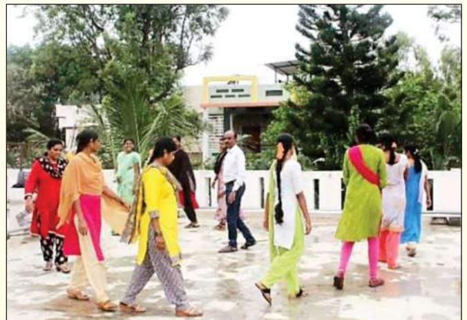
Trainees of BC Sakhi undergoing Ice Breaking Session