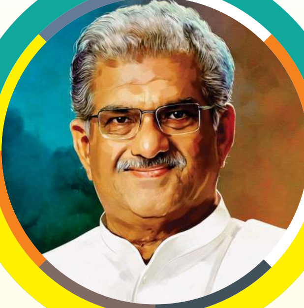
Dr.D Veerendra Heggade