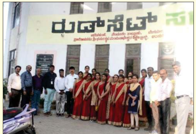
The women candidates from My Institute TTP college visited our Institute and had first-hand information about our activities