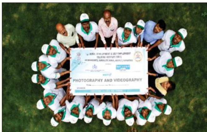
Trainees of Photography & Videography seen with other staff members during their practical session with Drone camera