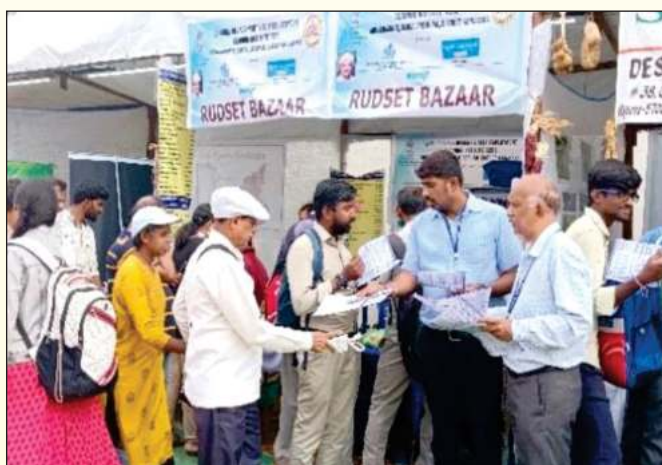
The Director and Faculty are informing general public about RUDSETI and its activities in the RUDSET Bazaar put in the GVKK Campus, Bengaluru