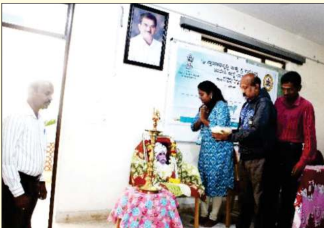
Canara Bank Founder's Day was observed at our Institute