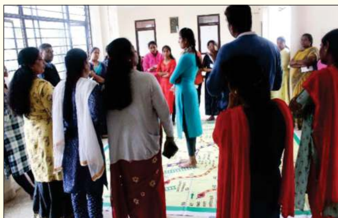
Trainees of Bank Mitra undergoing Ladder-Snake game to understand Banking