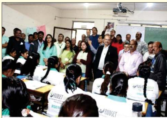
RUDSETI/RSETI Directors who are undergoing TTP visiting our Institute in their field visit