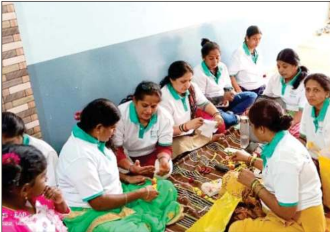
Trainees of Costume Jewellery Udyami undergoing practicals during their training