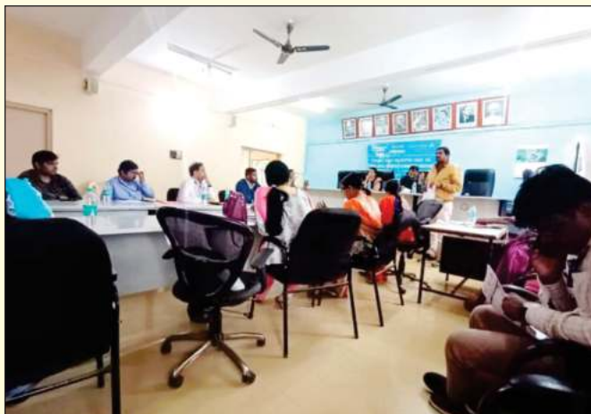
An EAP is in progress at Lingarajapura, Bengaluru Urban Dist