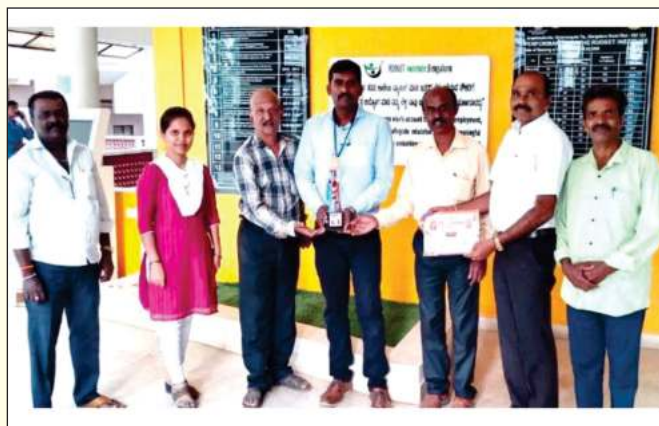
The Director and Staff Members are proudly holding the third prize received consecutively for putting a stall at Sri Siddaganga Math campus for the financial year 2022-23 and participating in the Agriculture & Industrial Exhibition organised on the occasion