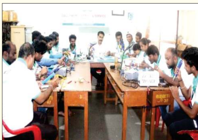
Trainees of Cell Phone Repairs & Service undergoing practical training