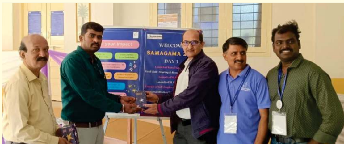
Our Director is being warmly felicitated on his visit to the 'Southern Regional Conclave of NGOs' which was conducted at Bengaluru. He had addressed the gathering