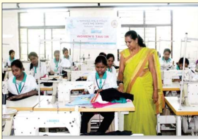
Trainees of Women's Tailor undergoing Practicals during their training