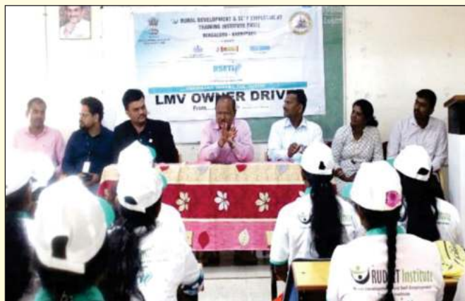
The Chairman and Members of DLRAC seen during their visit to our Institute interacting with the trainees of LMV Owner Driver programme sponsored by NRLM, ZP, Bengaluru Rural Dist