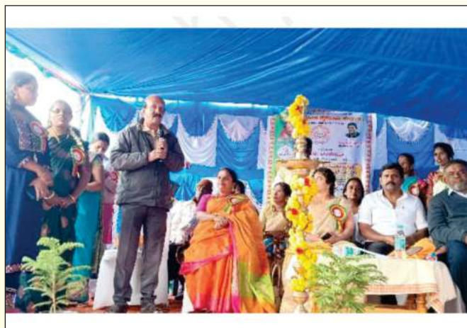
Our Director addressing a group of Bankers and Govt Officials in one of the BLBC Meetings conducted during their FY 2022-23