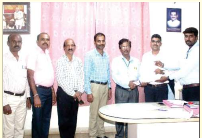
Grading of our Institute for the financial year 2021-22 is being done and procured AA grade