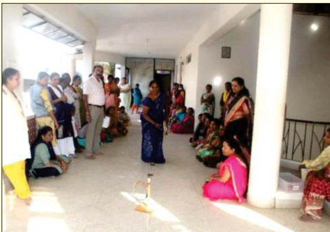
Trainees understanding about Goal and Goal Clarity through the Simulation Game - Ring Toss Game