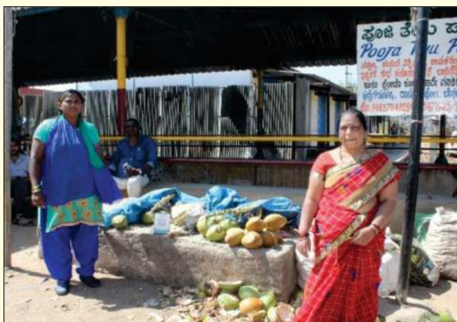
Women trainees of EDP for Udyogini batch seen selling coconut during a Marketing Exercise