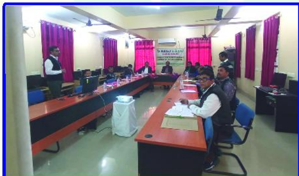
60th DLRAC Meeting