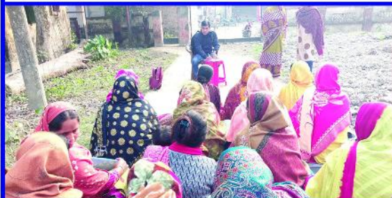
Follow-up by Office Assistant