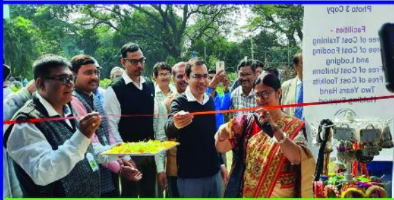
Resham Krishi Mela