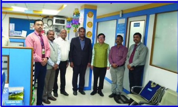
ED's Interaction with Canara Bank Executives