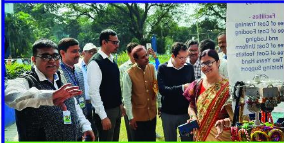
Resham Krishi Mela