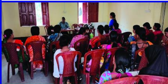
EAP by Faculty