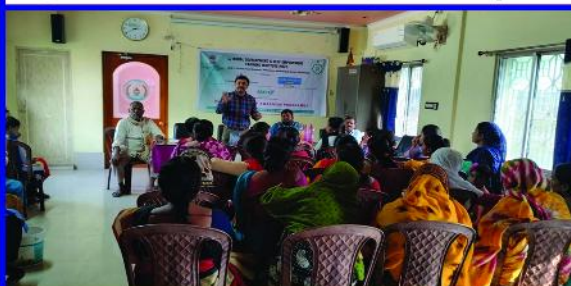
EAP by Faculty