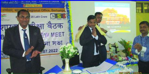
DGM & AGM of Canara Bank