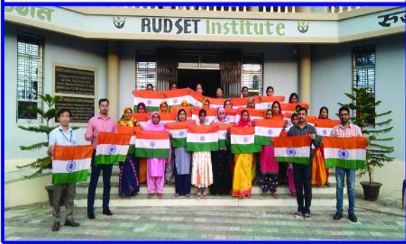
Azadi ka Amrit Mahotsav