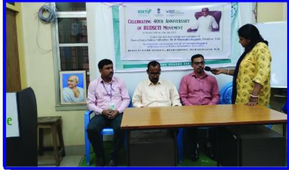
40th Anniversary of RUDSETI