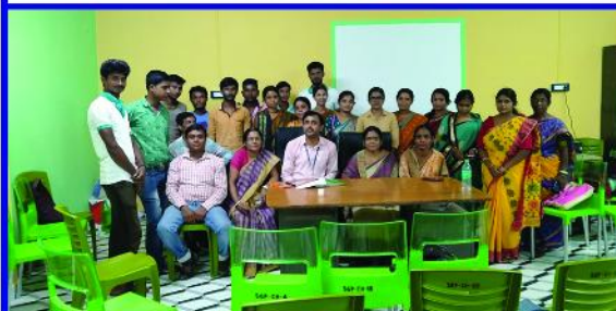
Follow-up by Faculty