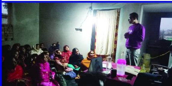
EAP by Director