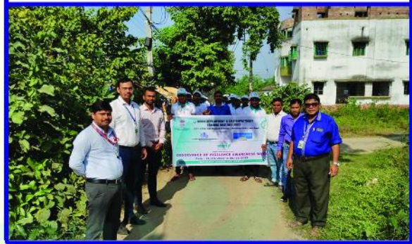
Vigilance Awareness Week-Rally