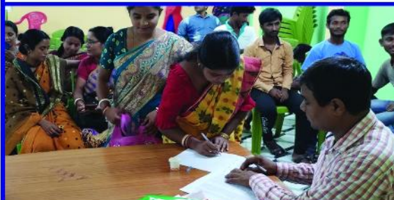
Follow-up by Office Assistant