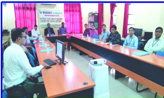
61st DLRAC Meeting