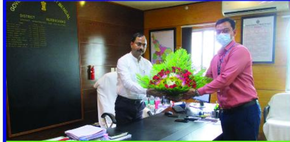
District Magistrate & Collector, Murshidabad