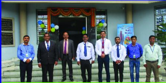
Executives of Canara Bank-C.O. & R.O.