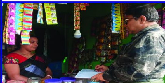
Follow-up by Faculty