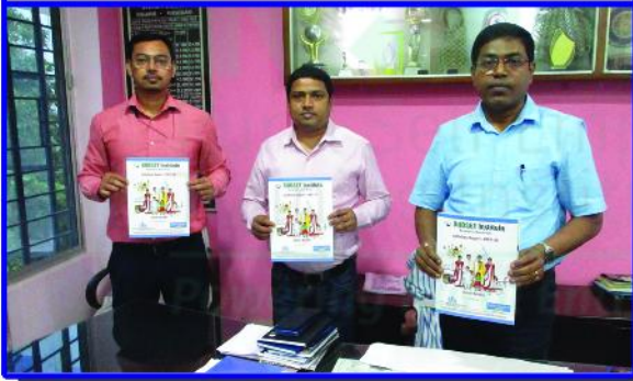
Release of Activities Report FY-2021-22