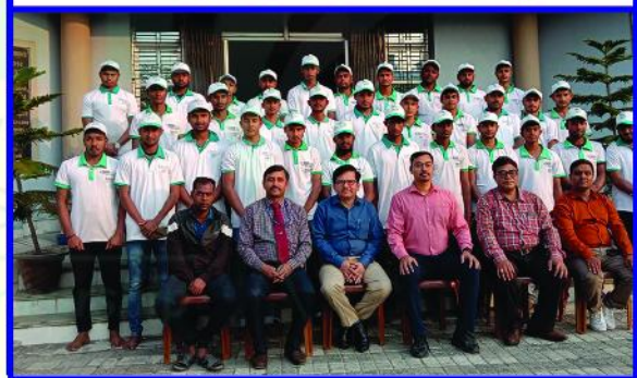
Refrigeration & Air-Conditioning