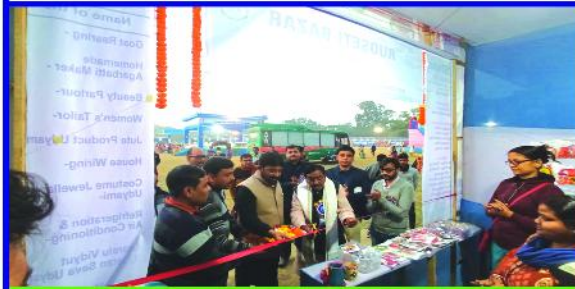
Zonal Level Khadi Mela