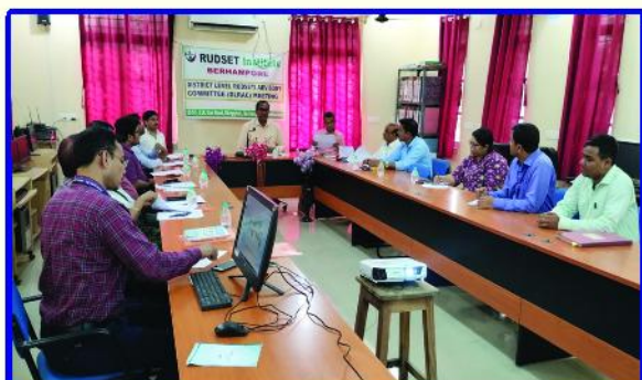
58th DLRAC Meeting