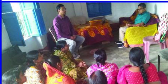
Follow-up by Director