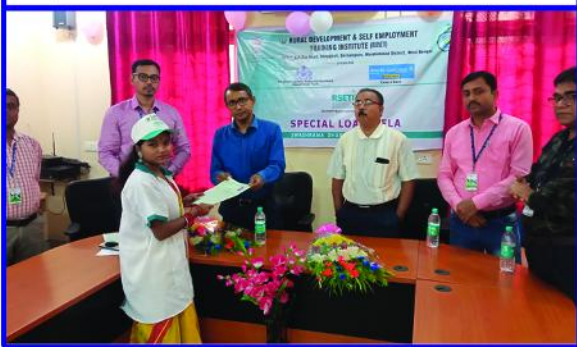
Special Loan Mela Sanction Letter Distribution