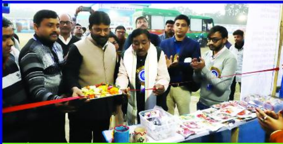
Zonal Level Khadi Mela