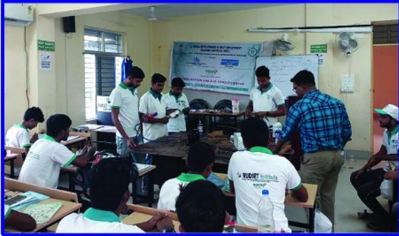
Refrigeration & Air-Conditioning