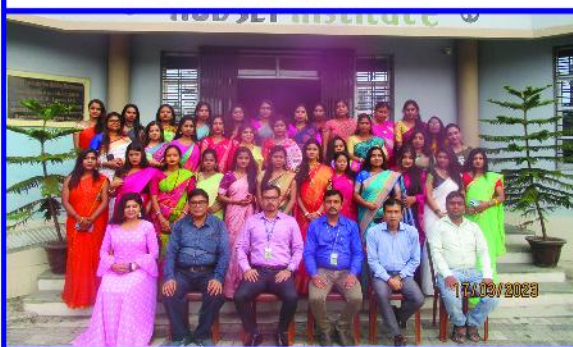
Advanced Beauty Parlour