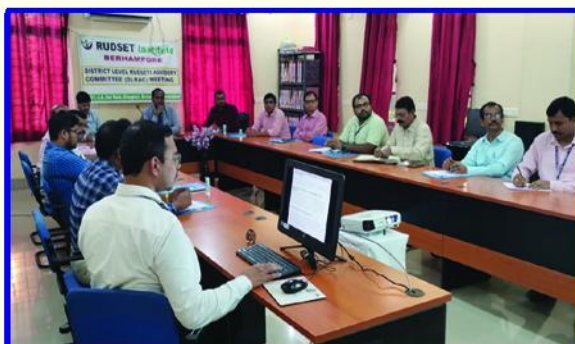
59th DLRAC Meeting