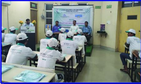
Vigilance Awareness Week