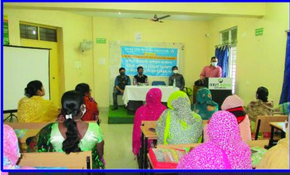
CED Programme of Canara Bank