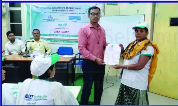
CASA Camp by Canara Bank