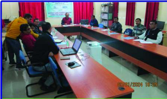
64th DLRAC Meeting