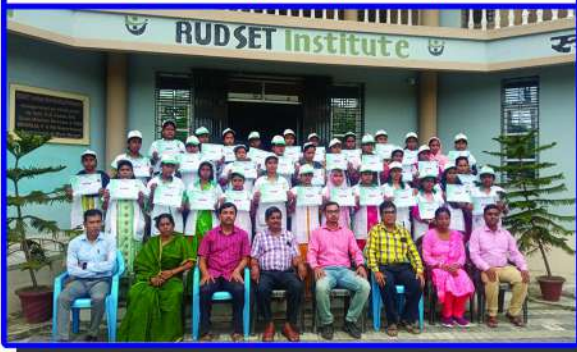
Batch-476 (Women Tailoring)