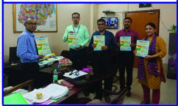
Sri Nirmalya Gharami,ADM,(Development ) Released Activities Report 2022-23