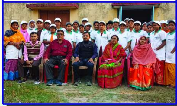
Batch-493 (General EDP)