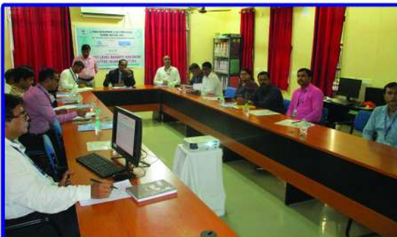
62nd DLRAC Meeting