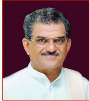
Padmabhushan Dr. D. Veerendra Heggade