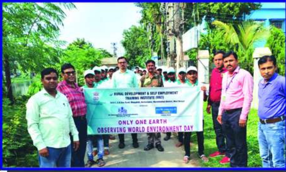
World Earth day