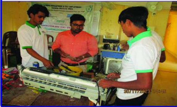
Refrigeration & Air Conditioning