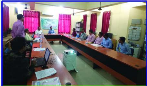
65th DLRAC Meeting