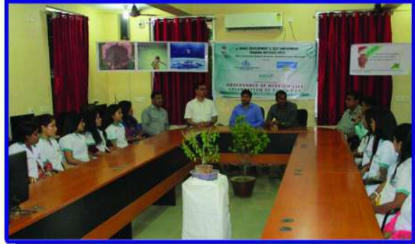
Earth Day Celebration