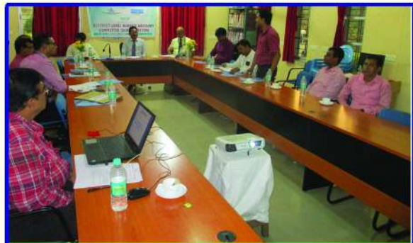
63rd DLRAC Meeting