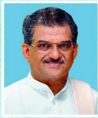
Dr D Veerendra Heggade President RUDSETIs, Dharmasthala