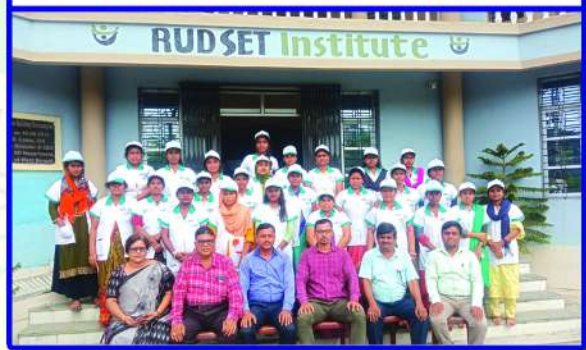
Batch-471 (Jute Products Udyami)