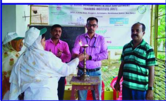
Batch-480 (Goat Rearing)