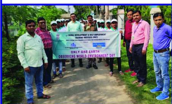
World Earth Day