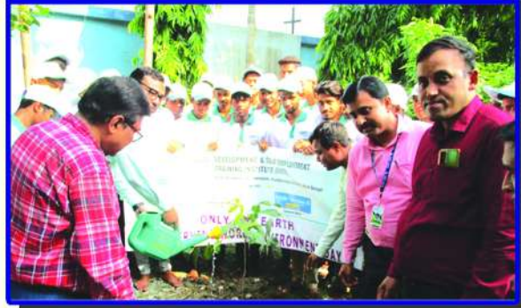
Rally For World Earth day