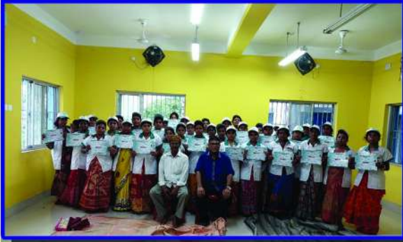
Batch-473 (_General EDP)