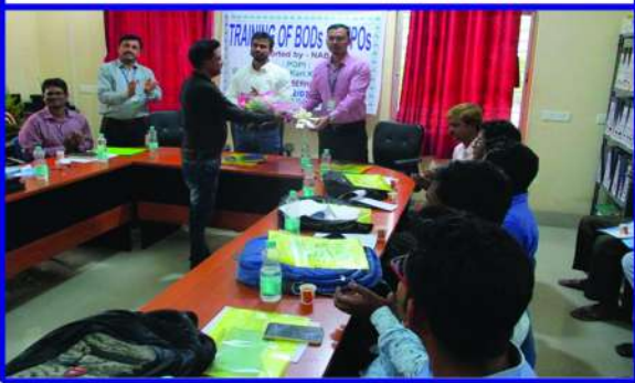
Programme for FPOs