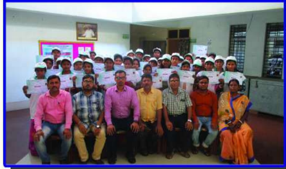
Batch-474 (Goat Rearing)