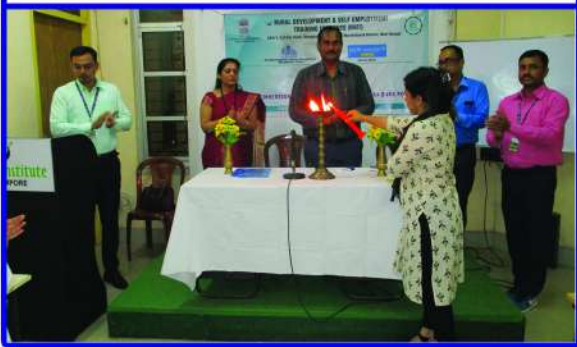
Inauguration POs & AEOs