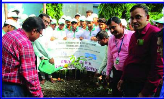
Rally For World Earth Day