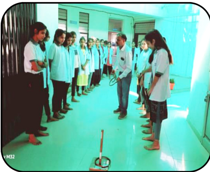
Ring Toss Exercise