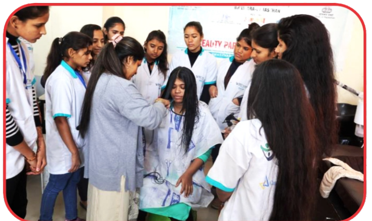
Practical Session of Beauty Parlour