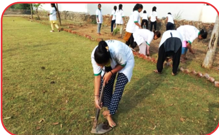
Participate in Shramdana Activity