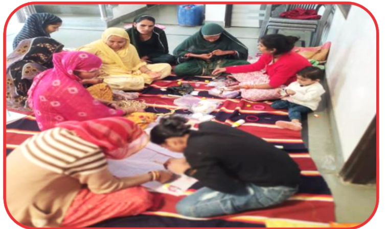
Practical Session of Jewellery Making