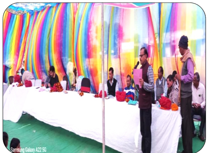
Mobilization of candidates through awareness programme