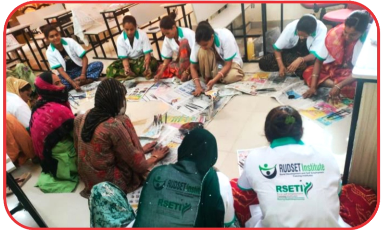
Practical Session of Agarbatti Making