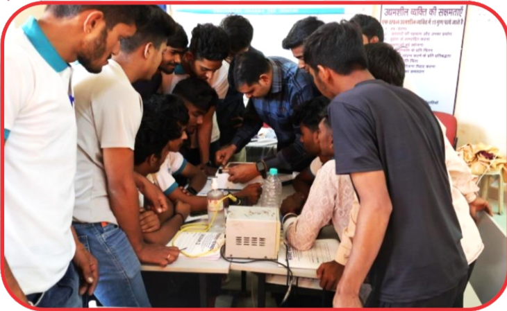
Practical Session of Cellphone Repair