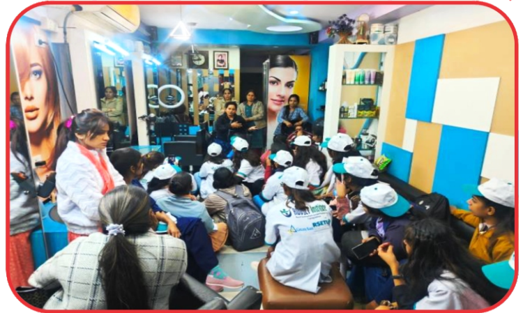
Market Survey Of Beauty Parlor Batch