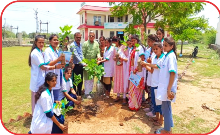
Environment Day Celebration