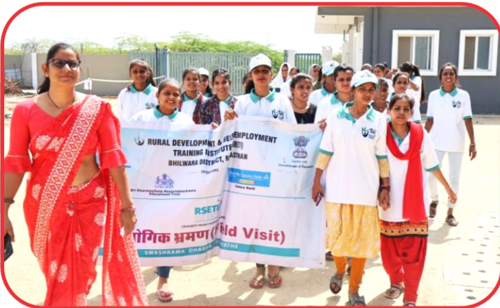
Industrie Visit Of Women's Tailor Batch