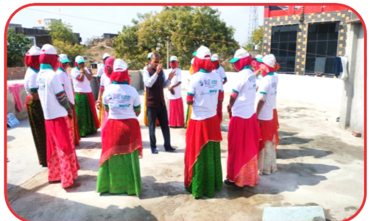
Micro Lab/Icebreaking Exercise