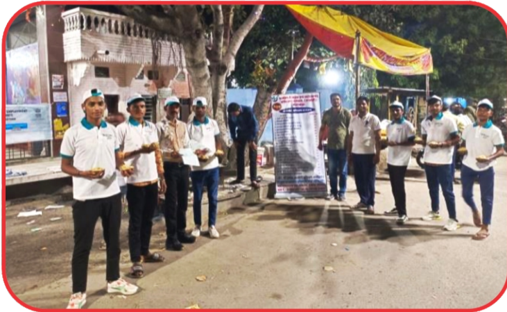
Social Activity By Rudseti Trainee In Navratra