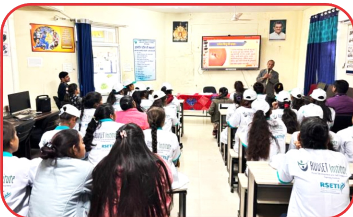
External Session On Meditation