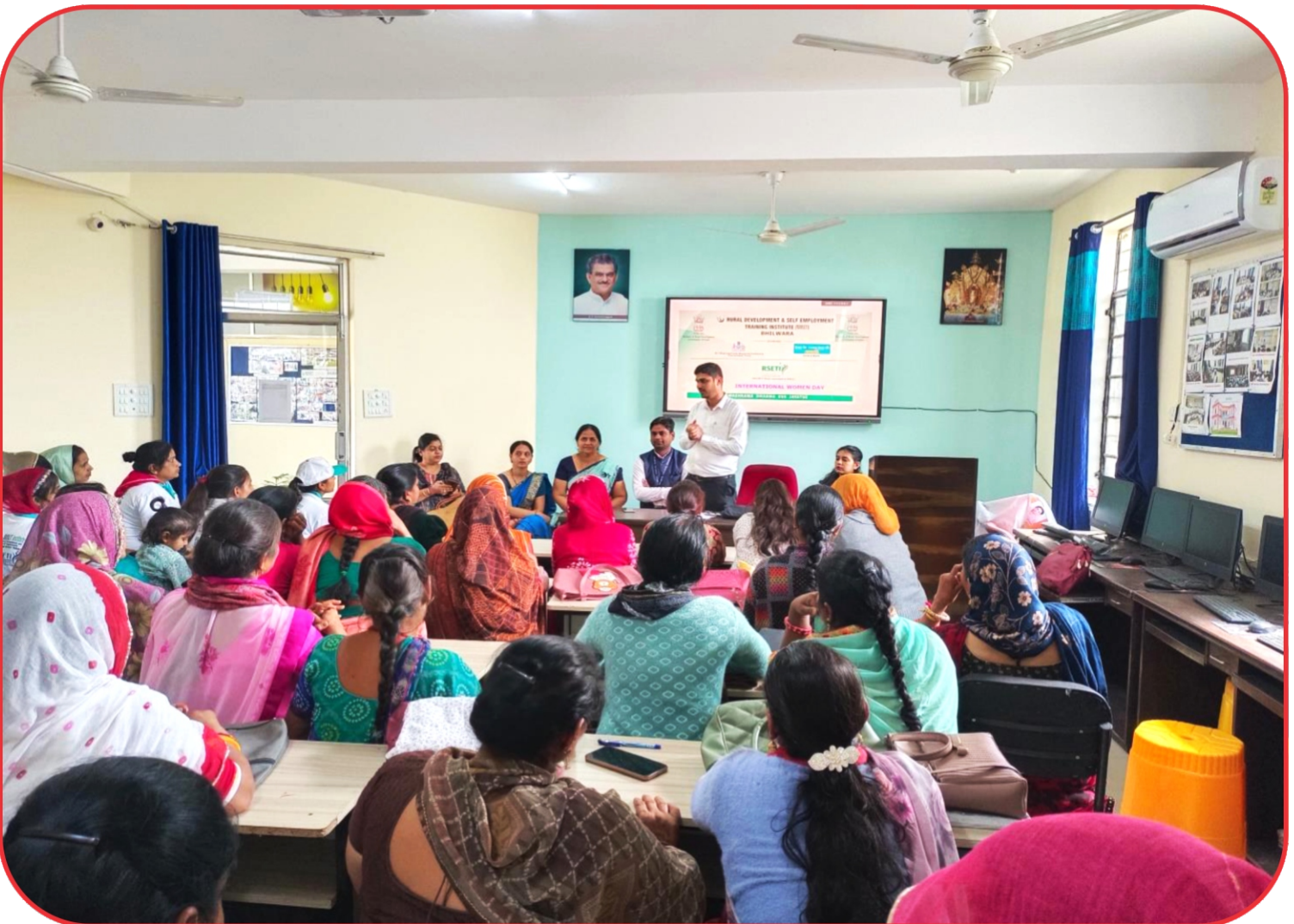
Celebration of International Women Day