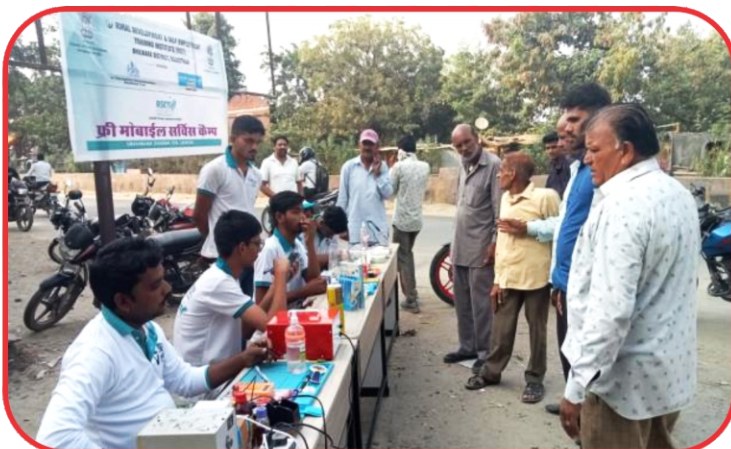
Free Mobile Servicing Camp