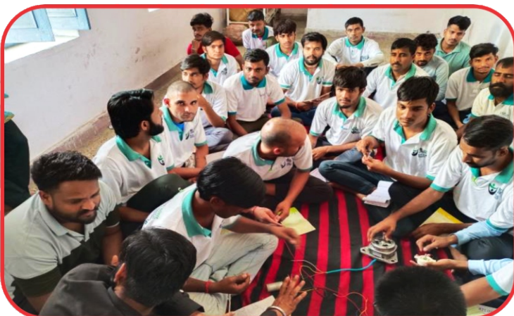
Practical Session of RO Servicing