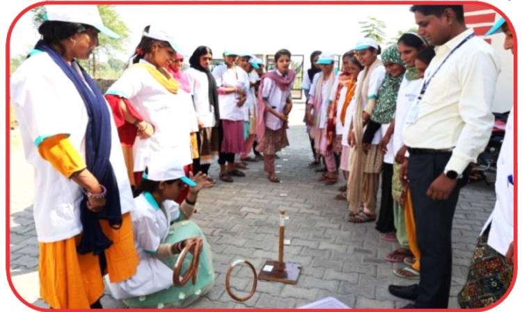
Ring Toss Game