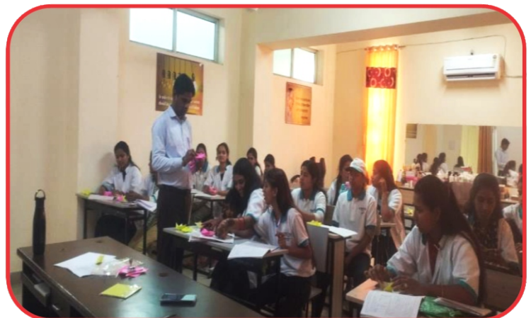
Administration of Boat Making Game