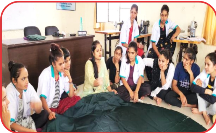
Practical Session of Tailoring