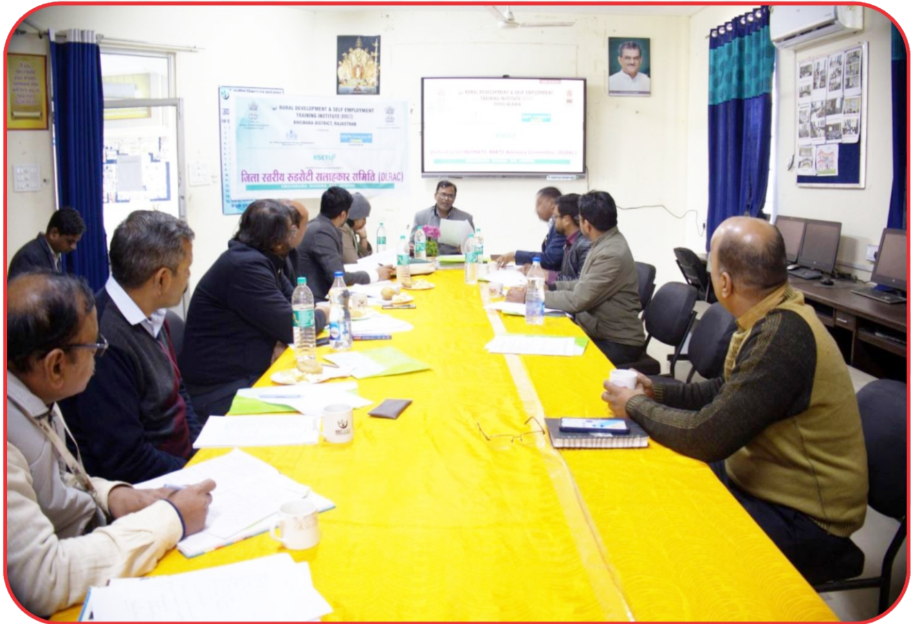
DLRAC Meeting with Members