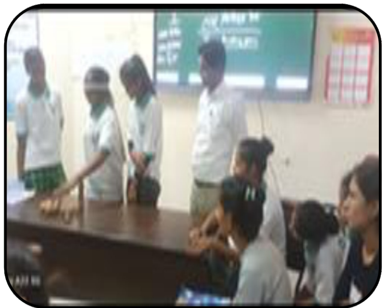
Tower Building Game