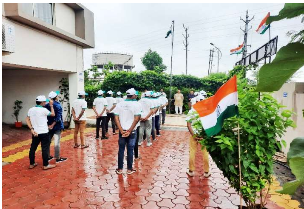
Celebration of Republic Day with the trainees of ongoing batch.