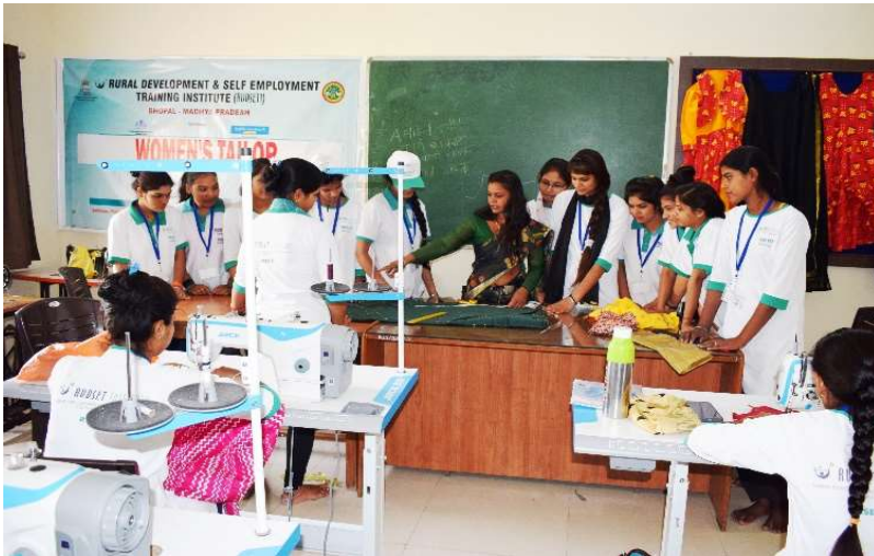
Trainees during the practical session of Women's Tailor Training Programme