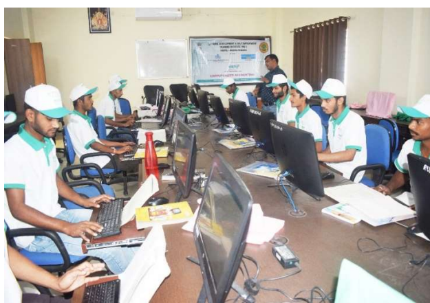
Trainees during the practical session of Computerized Accounting Training Programme.