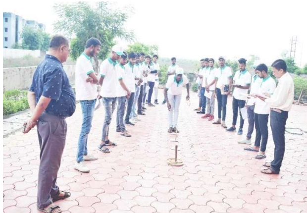
Trainees Participating in Ring Toss Game Exercise.