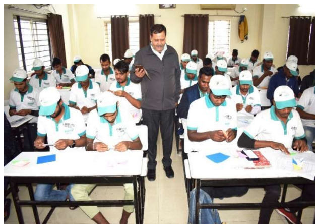
Trainees participating in Tower Building Exercise.