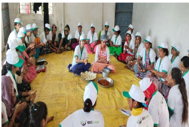
Trainees participating Fast Food Stall Udyami Training Programme.