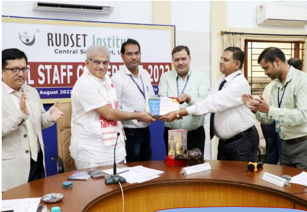
Received Award by President RUDSET for Stood First Position in Fund Mobilization for the year 2021-2022