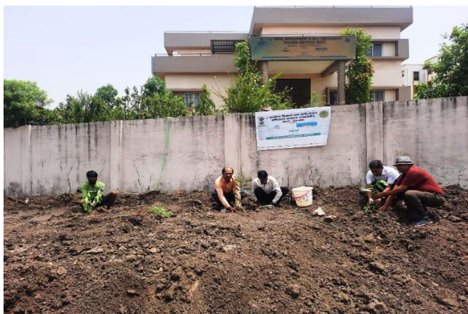
Plantation by our staff on the occasion of World Environment Day.