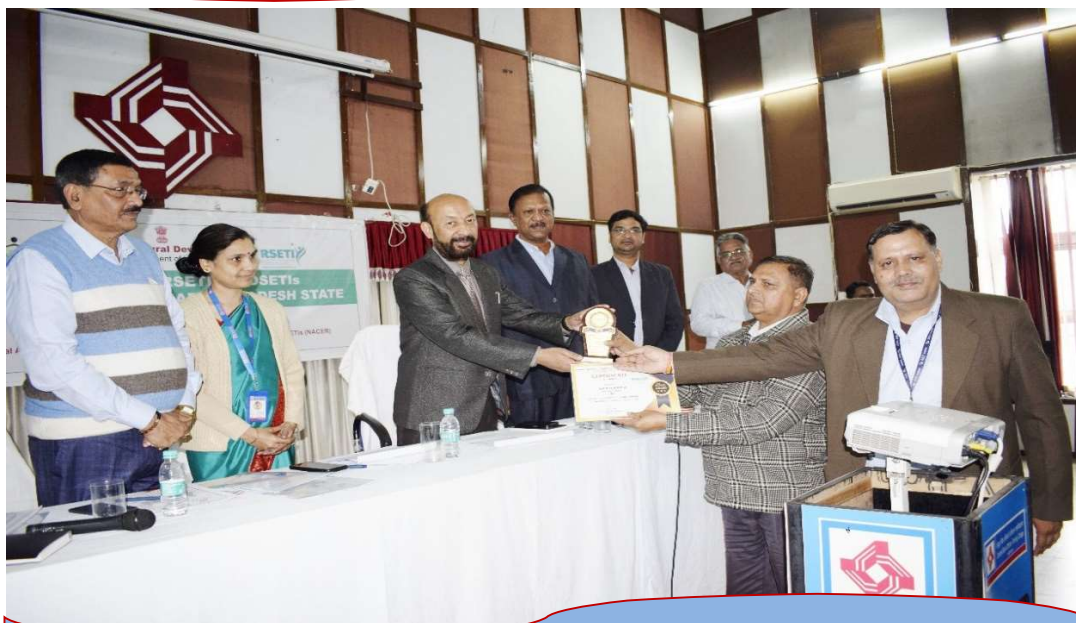
Received Award Form NACER Under Best in AAP and Credit Linking for the year 2021-2022 in All Rseti in Madhya Pradesh State