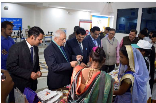
RUDSETI Bazar by our past trainees at Canara Bank C.O. on the occasion of Canara Bank Founder day.