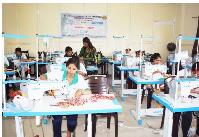
Trainees Participating in the Practical Session of Women's Tailor Training.