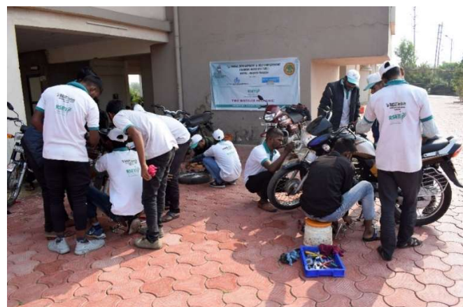
Trainees during the practical session of Two Wheeler Mechanic Training Programme