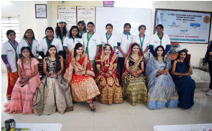
Beauty Parlour trainees during the bridal makeup Session.

145 follow up meets were conducted and 1360 trainees were contacted during the year.