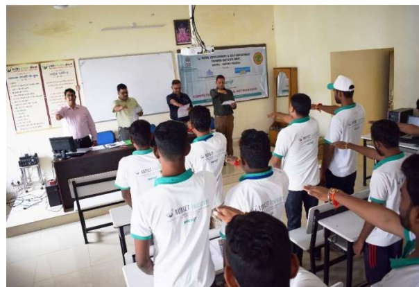
Trainees taking integrity pledge during the training programme.