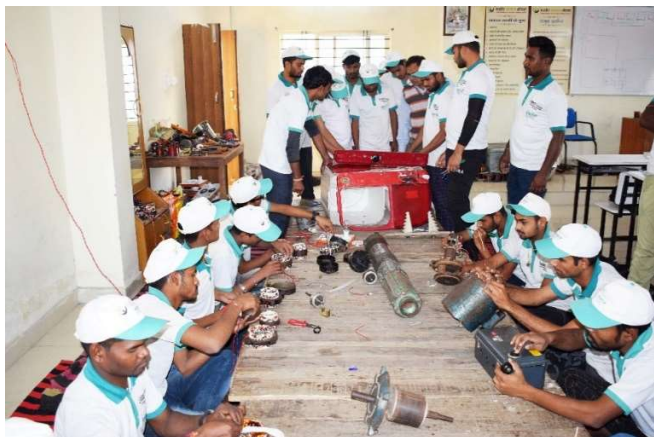
Trainees during the practical session of Electric Motor Rewinding training programme.