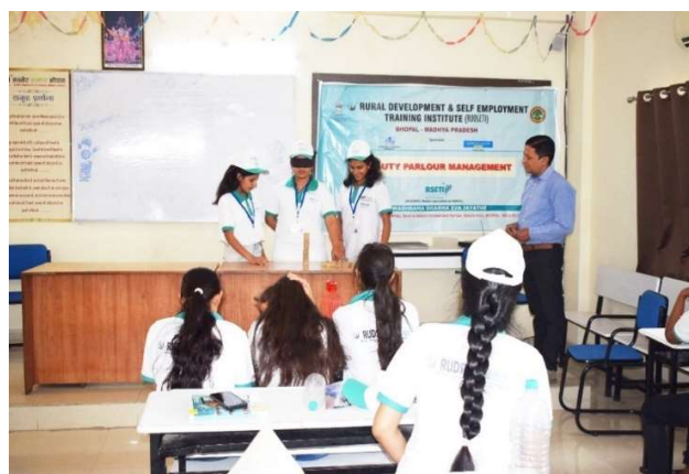
Trainees Participating in Business Game- Boat Making Exercise.