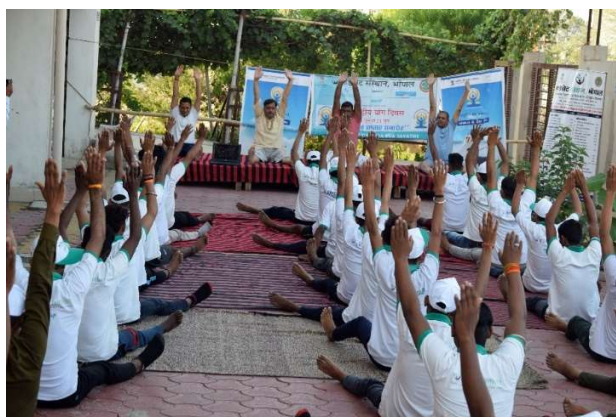
Staff & Trainees participating in yoga session. On International Yoga Day