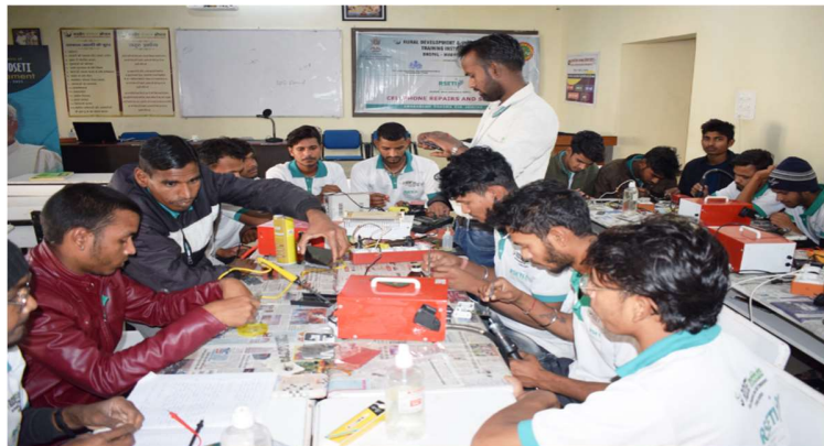
Trainees during the practical session of Cell Phone Repair & Servicing training programme.