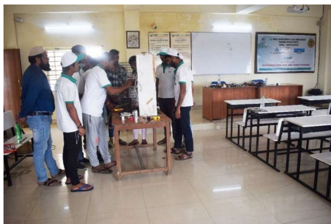
Trainees during the practical session of Refrigeration and Air Conditioning training programme.