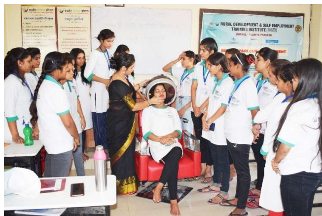
Trainees during the practical session Beauty Parlour Management training Programme.