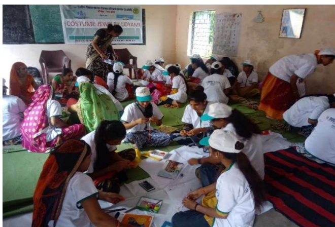
Trainees during the practical session of Costume Jewellery Making Training Programme