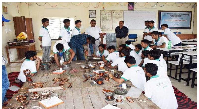
Trainees during the practical session of Electric Motor Rewinding Training Programme