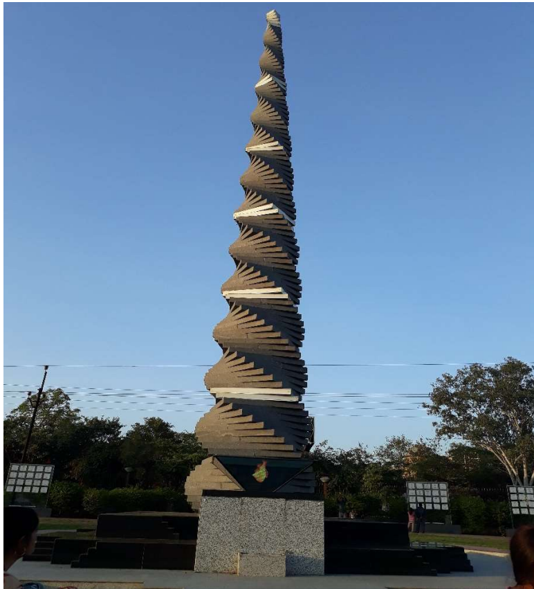
SHOURYA SMARAK, BHOPAL