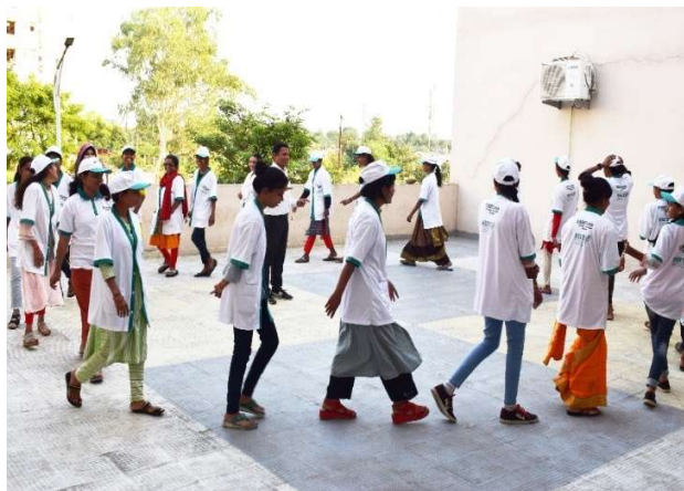
Trainees participating in Micro Lab - Ice Breaking Exercise.