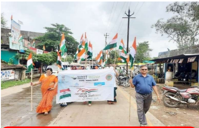
Organized Rally by our trainees on the occasion of "HAR GHAR TIRANGA ABHIYAN".