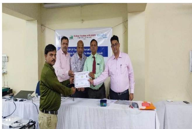
Certificate distribution programme to CRP-EP participants.