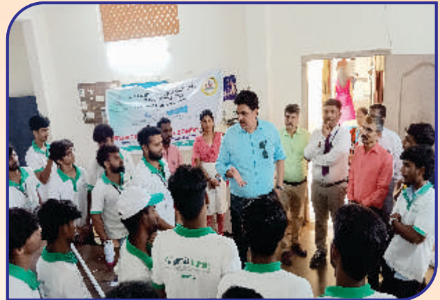
Shri. Shoyab Ahmed Kalal, IAS Deputy Secretary of NITI Ayog Government of India interacted with ongoing trainees.