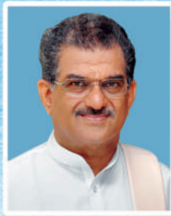
Dr D Veerendra Heggade President RUDSETIs, Dharmasthala