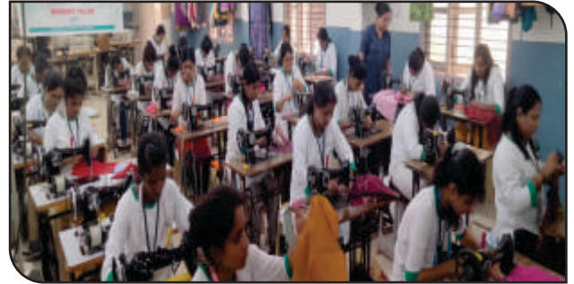
A view of womens tailoring practical session