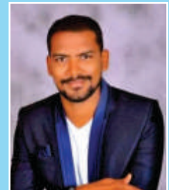
Pruthveeraj Watchmen / Gardener

Rural Development & Self Employment Training Institute (RUDSETI)