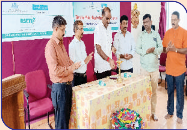
Sri Yashpal Suvarna , MLA, Udupi inaugurated & addressed Electrical Motor Rewinding & Repair training the participants