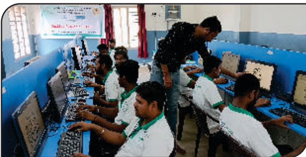
A view of Computer DTP practical session