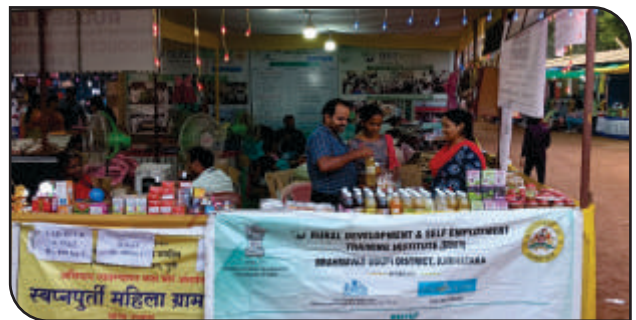
RUDSETI Bazaar at Dharmasthala on the occasion of Lakshadeepotsava