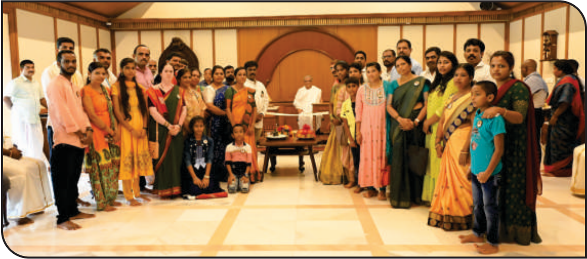
Visited to Dhramasthala with Asare team to meet Dharmadhikari Padmabhushana Dr. Veerendra Heggade and to have blesses from lord Manjunatha Swamy