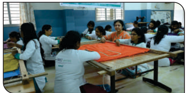
A view of Embroidary & Fabric Painting practical session