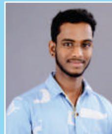
Vinayaka Sub Staff