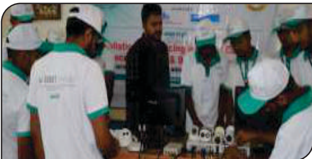
A view of CC Camer Repair & Service Practical Session