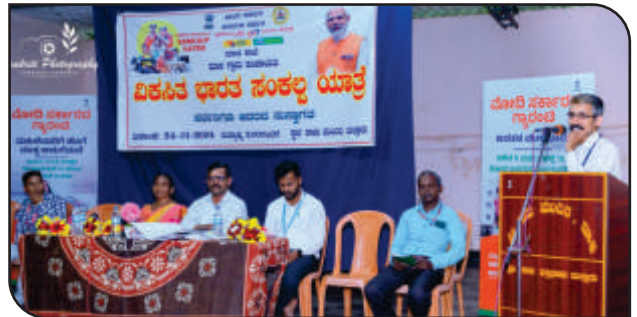
Participated in Vikasitha Bharatha Yathra