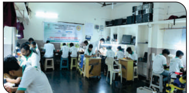
A view of Cell Phone Repair & Service Practical Session