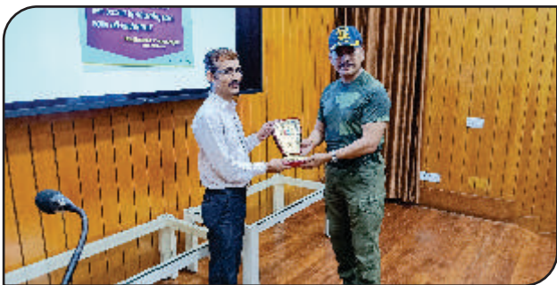
EAP for at MIT, Manipal, Scout students