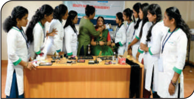
A view of Beauty parlor practical session