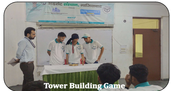
Tower Building Game