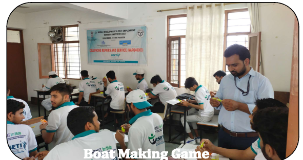
Boat Making Game