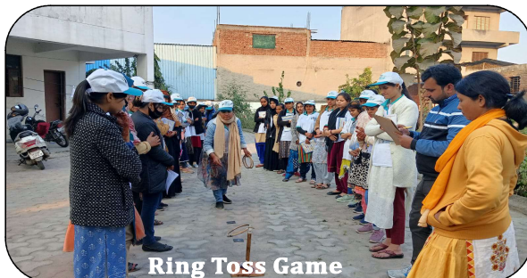
Ring Toss Game