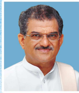
Dr D Veerendra Heggade President RUDSETIs, Dharmasthala