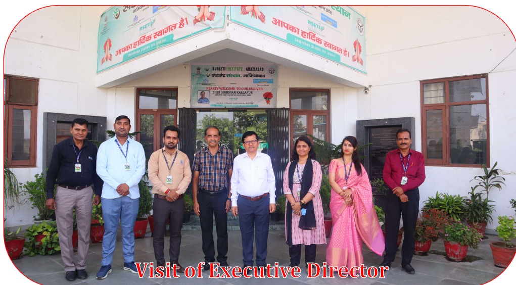
Visit of Executive Director