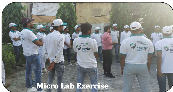
Micro Lab Exercise