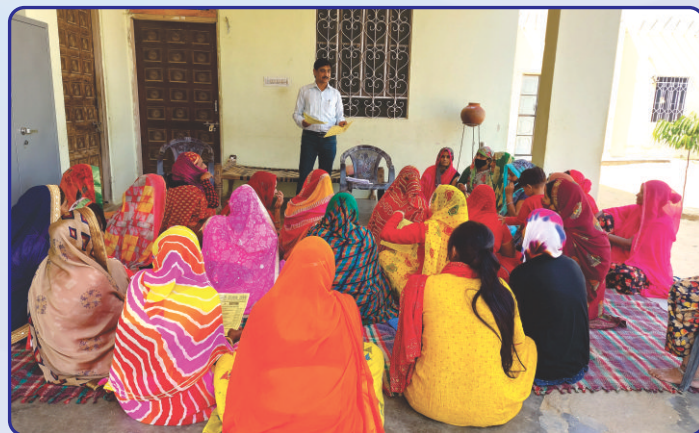
An awareness programme was organized at Village - Nimera.