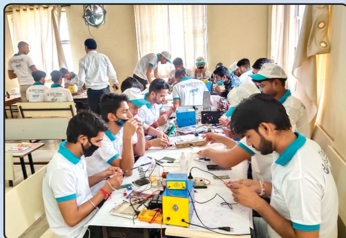
Cellphones servicing training programme.