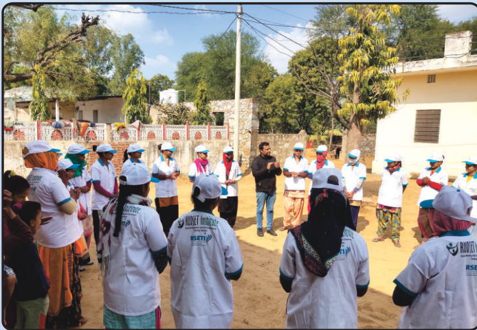
Ice-breaking Session Through Micro-lab.