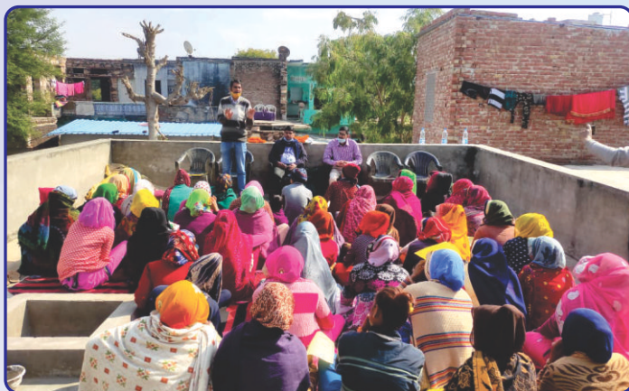
An awareness programme was organized at Village - Udaipuria.