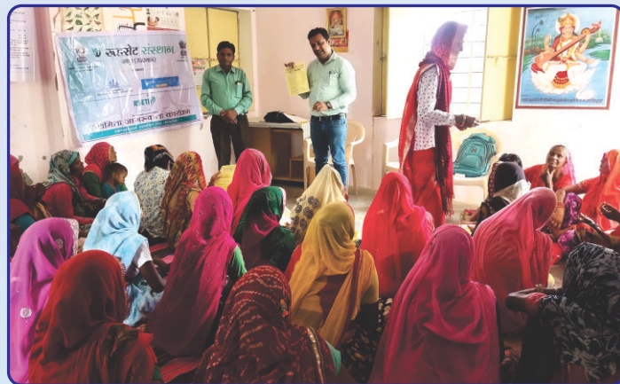
A awareness programme was organized at Village - Agarapura, Jobner, Jaipur.