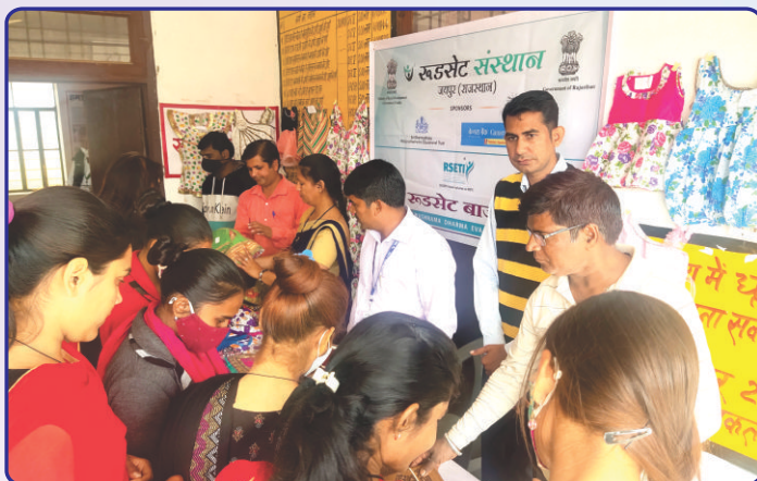
RUDSETI Bazar was organized at Bhurthal village.