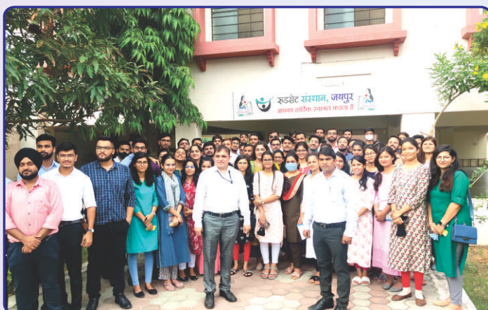
Newly recruited Probationary Officers of Canara Bank visited RUDSETI, Jaipur and interacted with the trainees of ongoing batch of Computerized Accounting.