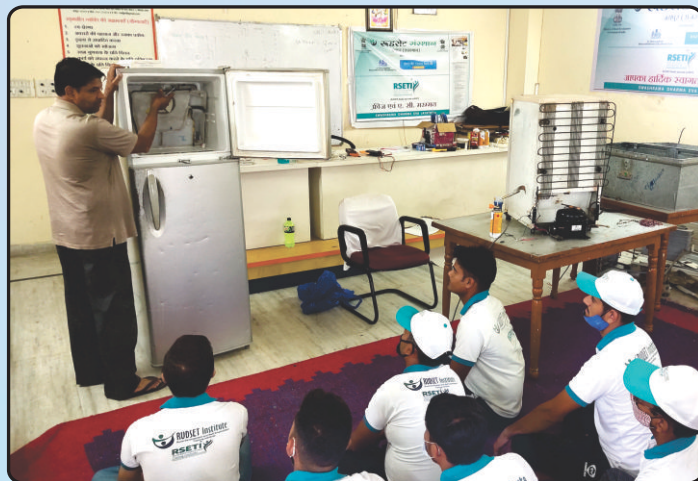
Practical Session of Refrigeration & Air-conditioning training programme.