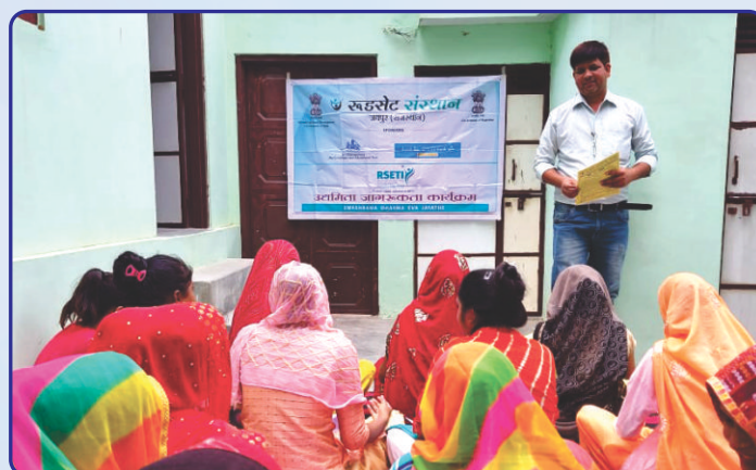
An awareness programme was organized at Villag - Kalwar.