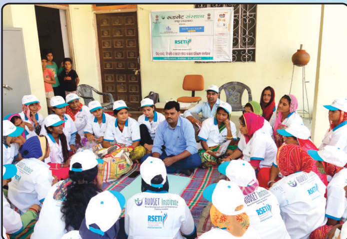
Paper Cover, Envelope and File Making training programme.