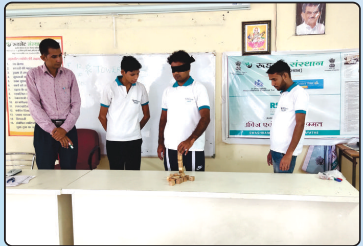
Tower Building Game.