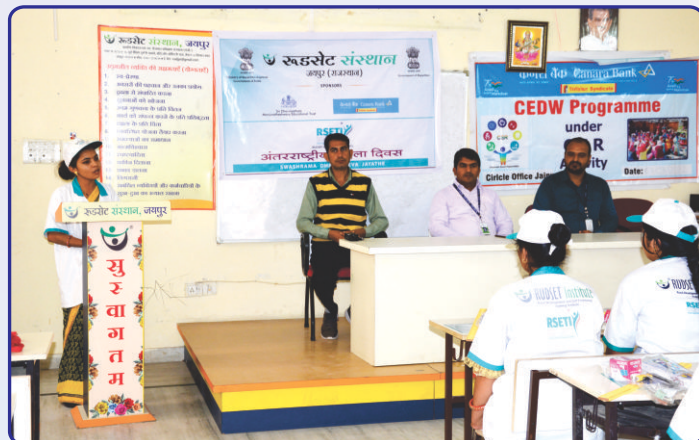
Women's day celebrated at RUDSETI, Jaipur.