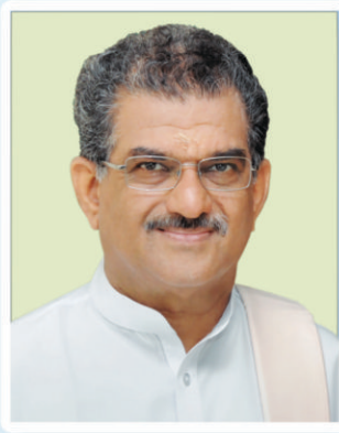
Dr D Veerendra Heggade President RUDSETIs, Dharmasthala