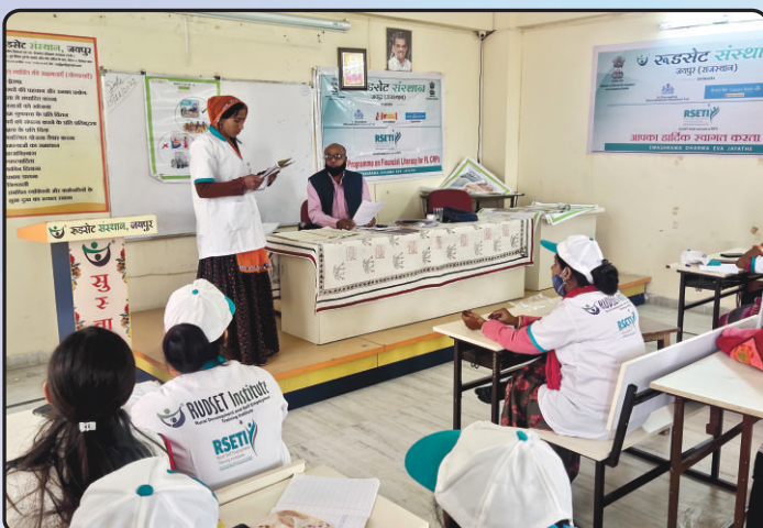
Financial Literacy for FLCRPs training programme.