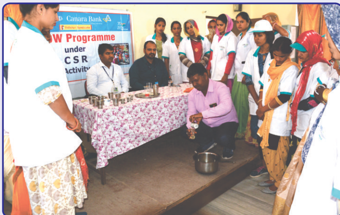
Canara Bank Circle office, Jaipur organized one day CEDW programme at RUDSETI, Jaipur. Trainees of RUDSETI participated in the programme and upgrade their skills in Candle Making and Agarbatti Making.