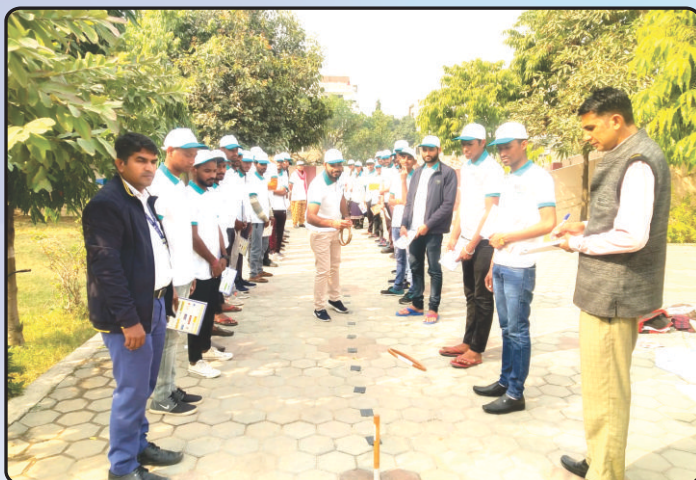
Ring Toss Game.