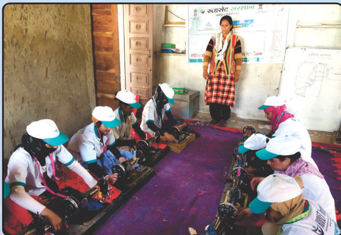
Women's tailor training programme.