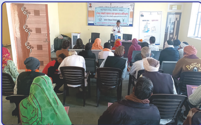
An awareness programme was organized at Bassi Nagan.