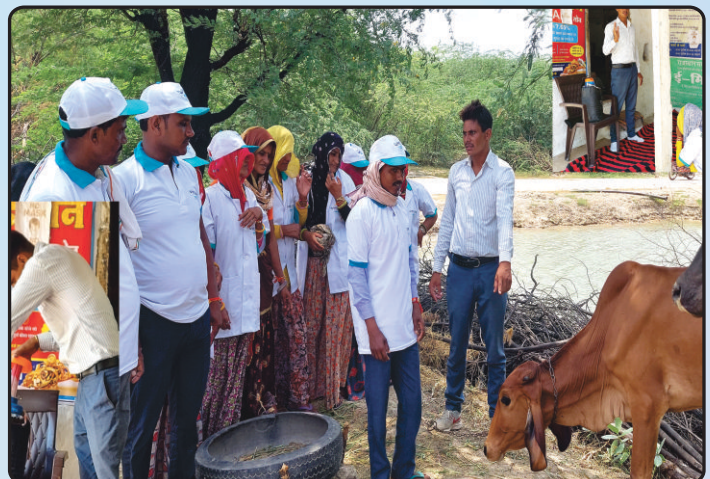
Field Visit in Dairy Farming & Vermi Compost Making training programme.