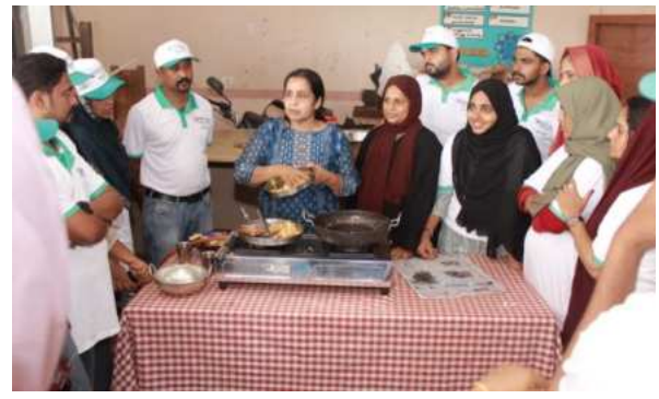
Fast Food Stall Udyami