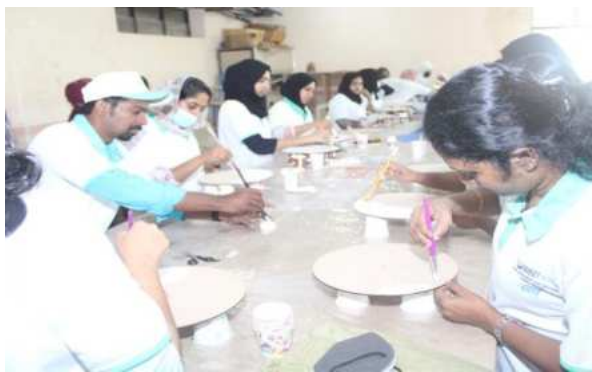
General EDP on Resin Art