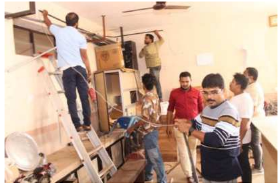
Installation & Servicing of CCTV