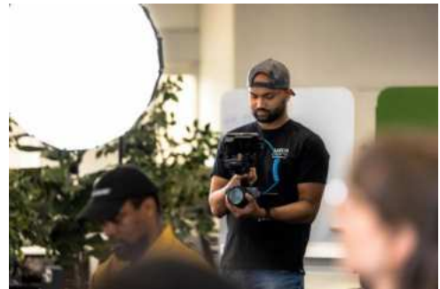
Sri Akshay Moncy, Photography in Canada