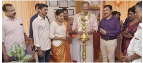
Smt Sajina K, Blush Beauty Parlour inaugurated by Sri Sumesh KV, MLA, Azhikode Constituency