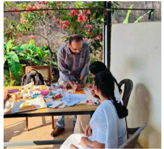
Trainees in Action at Women's Prison Kannur