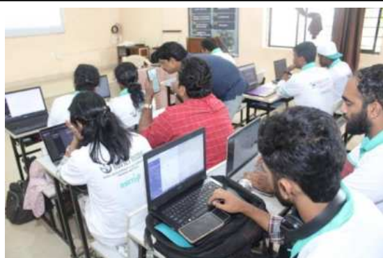
General EDP on Digital Branding