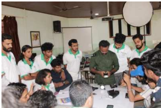
Photography & Videography