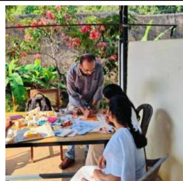
General EDP on Fabric Painting at Women Prison