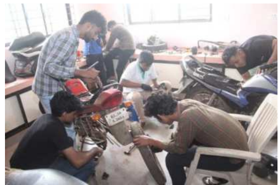
Two Wheeler Mechanic