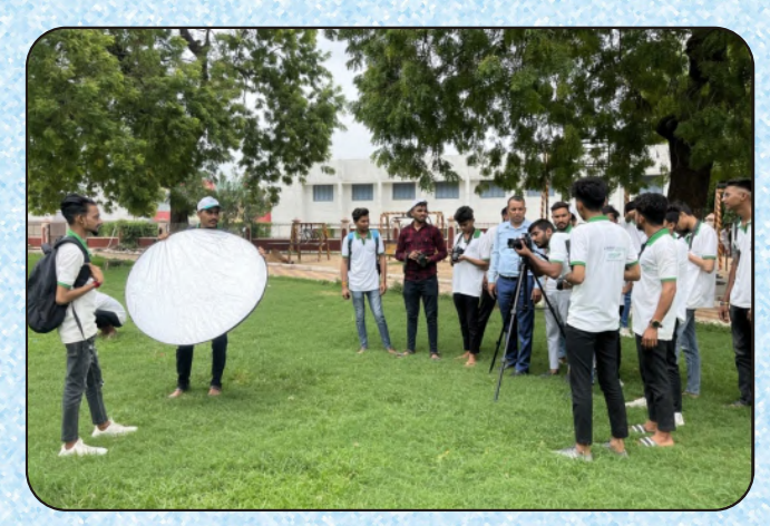
Action Photo of Photography & Videography