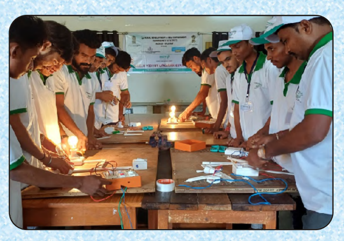
Action Photo of Garelu Vidhyut Upkaran Seva Udyami