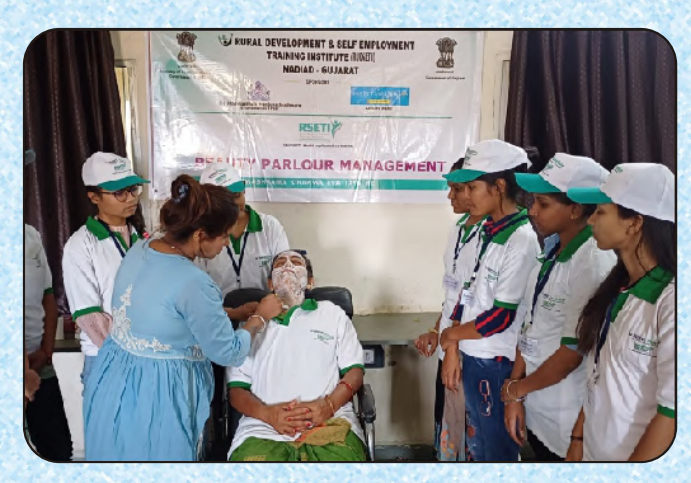
Action Photo of Beauty Parlour Management