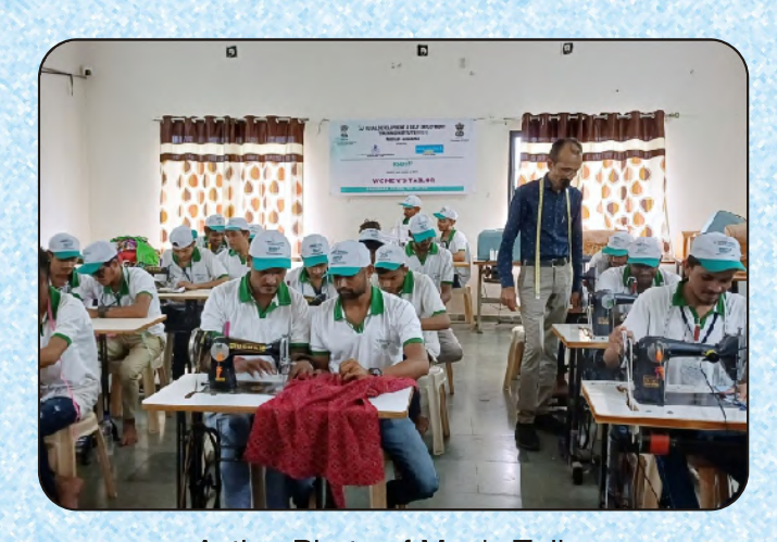
Action Photo of Men's Tailor