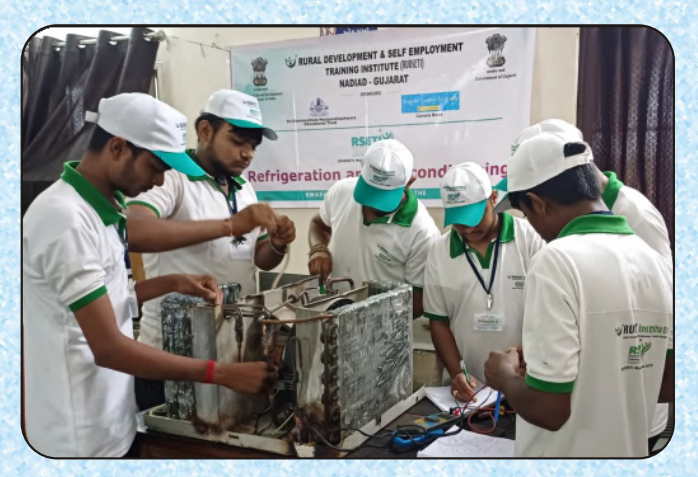
Action Photo of Refrigeration and Air Conditioning