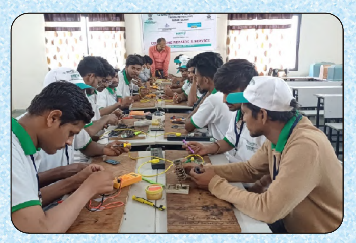
Action Photo of Cell Phone Repair