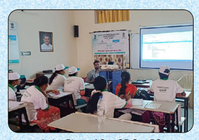
Action Photo of One GP One BC