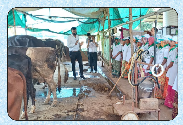
Action Photo of Dairy Farming & Vermi Compost Making