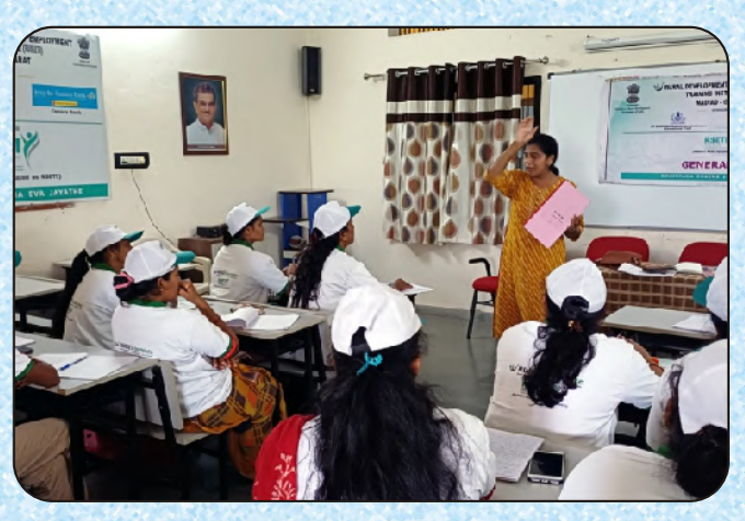
Action Photo of Bank Sakhi