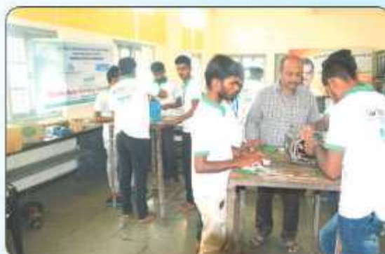
Electric Motor Rewinding & Pump-set