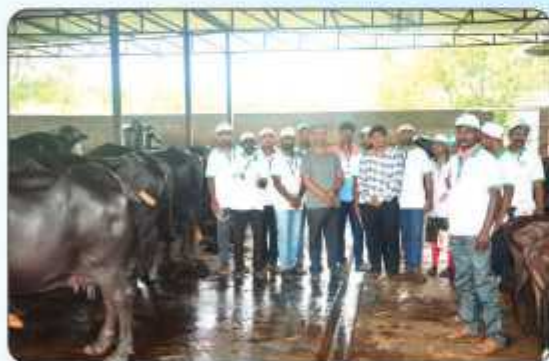
Exposer visit of Dairy Farming