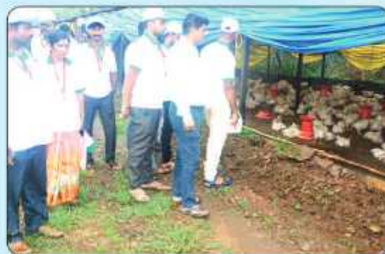
Exposer visit of Poultry Farming