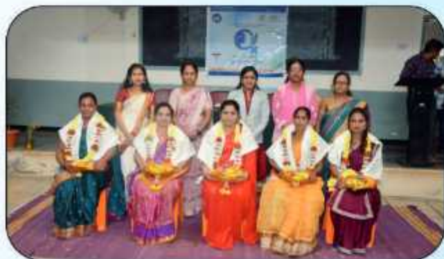
Five RUDSETI Trained Women Entrepreneurs felicitated during Women's Day Celebrated at our Institute