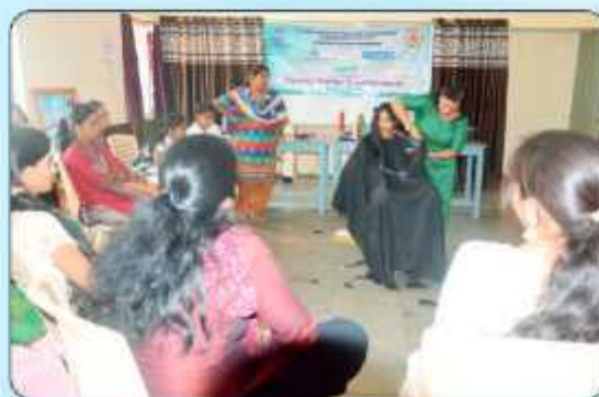
Skill Upgradation of Beauty Parlor Management