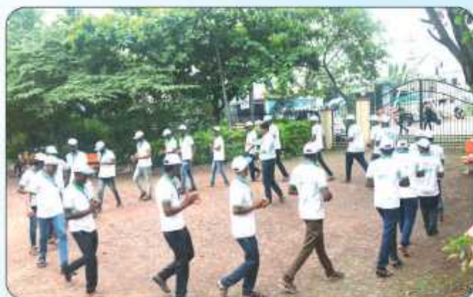
Micro Lab Session