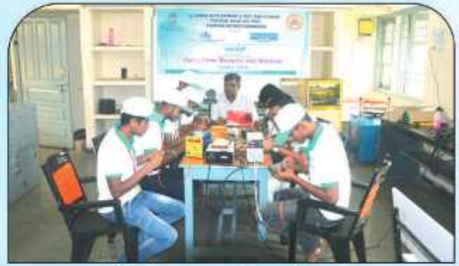
Cell Phone Repair and Service