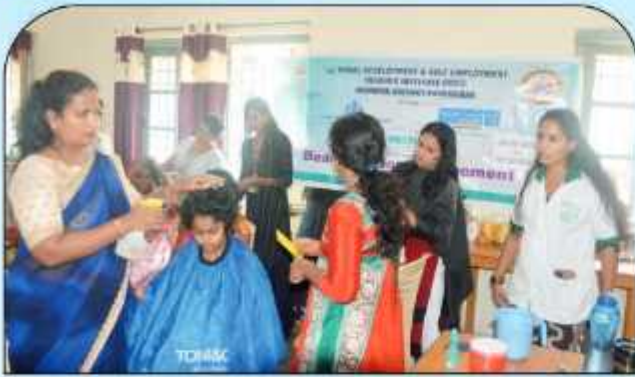
Beauty Parlour Management