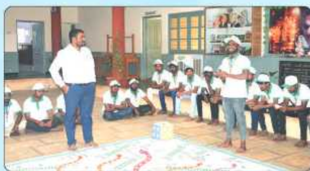
Director explaining Financial Literacy through Snake Ladder game