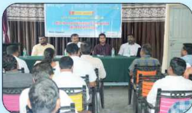
BLBC Meeting organized at our Institute by Lead Bank office Vijayapura for Vijayapura Block