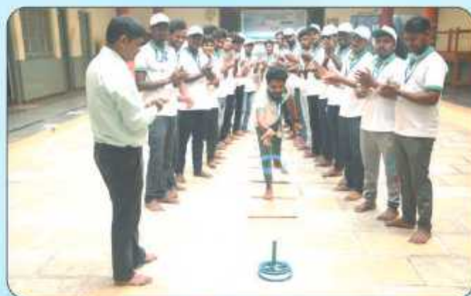
Ring Toss Game