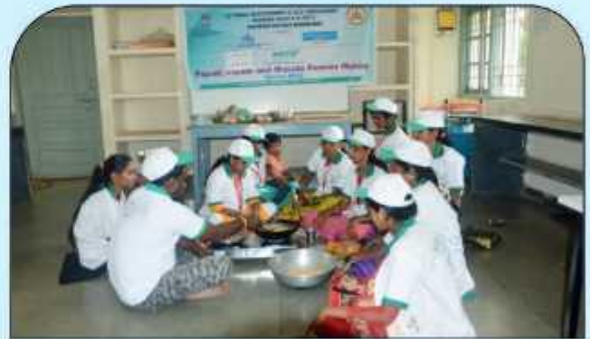
Papad, Pickle & Masala Powder Making