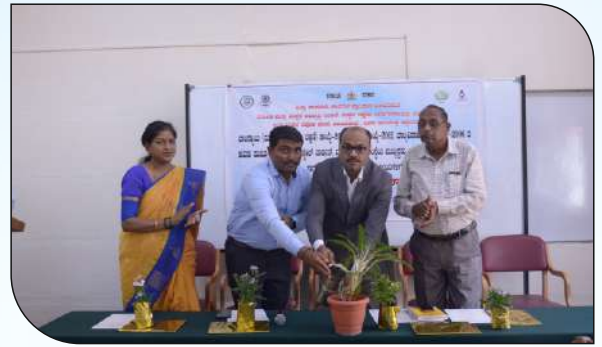
Creating awareness of the POCSE Act and advocating for the abolition of child marriage programme was conducted in association with Dept. of Women & Child Devt., Vijayapura