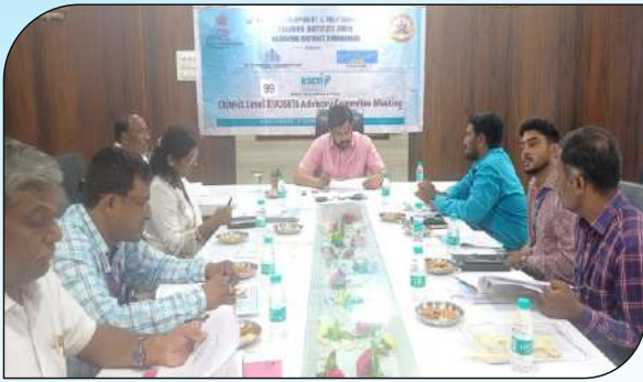
DLRAC Meeting for March quarter at ZP meeting hall Vijayapura