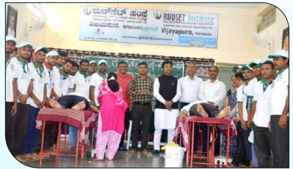
Institute organized Blood Donation Camp in association with Lions Club, Vijayapura