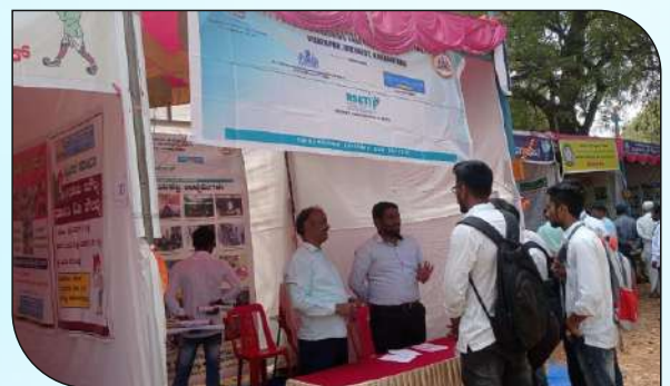
Creating awareness about Institute's various programmes during Krishi Mela at AC Vijayapura