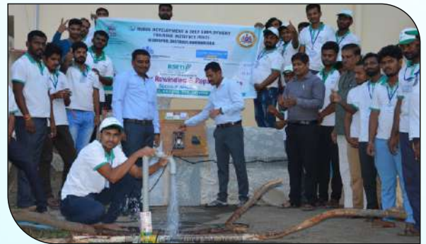
Electric Motor Rewinding & Pumpset Maintenance Training