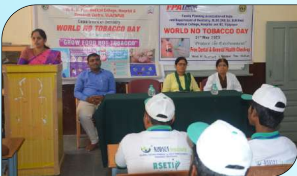
World No Tobacco Day celebrated in association with FPA Vijayapura