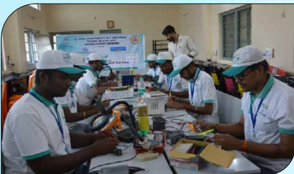
Cell Phone Repair and Service Training