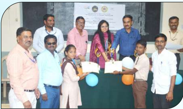
District Level on stage Quiz competition - All India RBI Financial Literacy Quiz 2023 organized at our institute for Vijayapura and bagalkot Middle School students in association with RBI-FIDD, Bengaluru