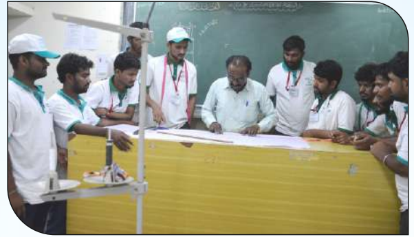
Men's Tailor Training