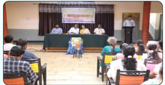
Yoga Workshop for Physical Teachers organized at our institute in association with Dist. Ayush Hospital Vijayapura