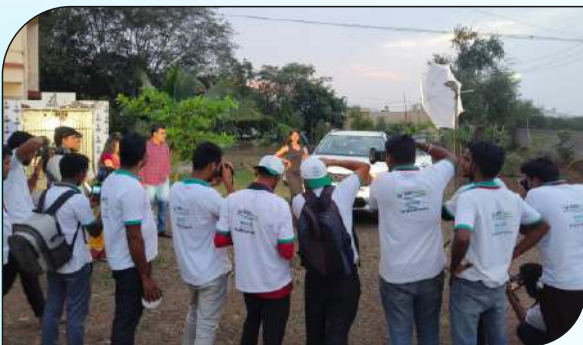
Photography & Videography Training