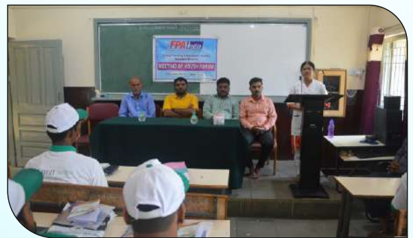
Organized Health Awareness programme to trainees in association with FPA- India Vijayapura