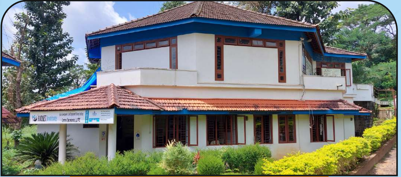
CENTRAL SECRETARIAT, UJIRE D.K. DIST