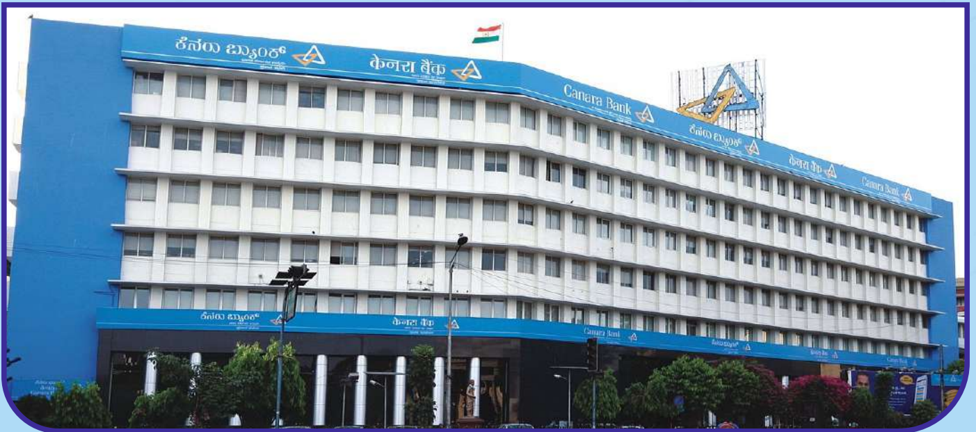
CANARA BANK H.O. BENGALURU

The Director Rural Development & Self Employment Training Institute (RUDSETI) Raghavendra Colony, Bagalkot-Jamakhandi Bypass Road, Vijayapura - 586109, Karnataka Mob: +91 7483987824, email id: rudsetivjp@gmail.com website : www.rudsetitraining.org