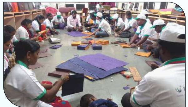
Paper cover, Envelop & File making Training