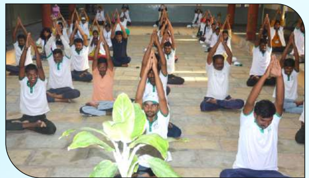
International Yoga day celebrated at our institute by trainees