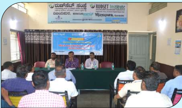
BLBC Meeting for Vijayapura block was organized at our institute by Lead Bank Office Vijayapura