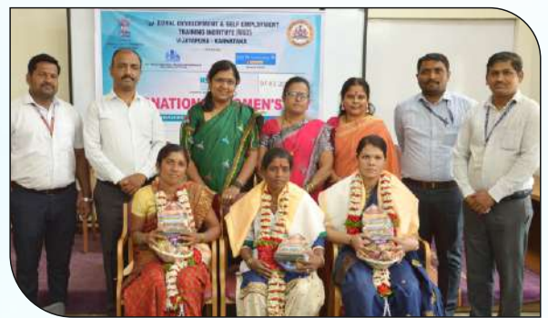
International Women's day celebrated in association with Regional office Canara Bank R.O. Vijayapura