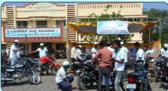
Free Two Wheeler service checkup camp organized at our campus with active participation of trainees