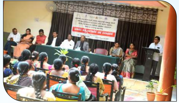
Dept. of Women & Child development Vijayapura celebrated Human Trafficking prevention day at our institute