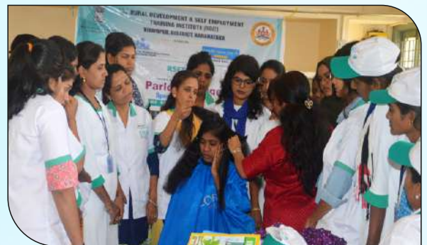
Beauty Parlour Management Training