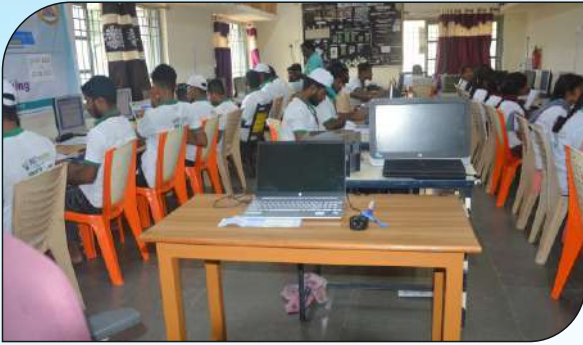
Computer Desktop Publishing Training