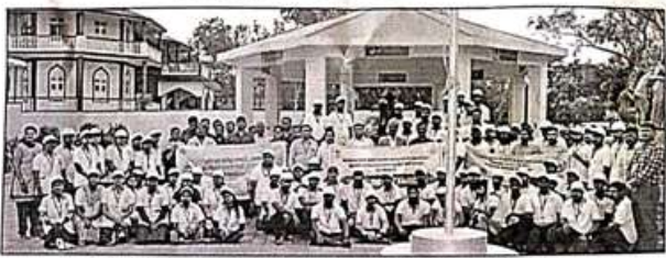
ವಿಜಯಪುರದಲ್ಲಿ ಭ್ರಷ್ಟಾಚಾರ ನಿಗ್ರಹ ಜಾಗೃತಿ ಜಾಘಾ ನಡೆಯಿತು.