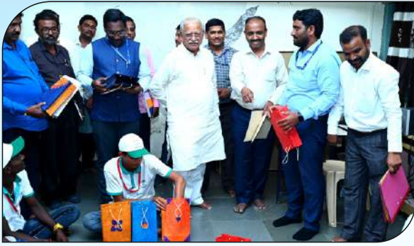
Sri Ramesh Jigajinagi, MP Vijayapura, interacting with physically challenged trainees of Paper cover, Envelop & File making.