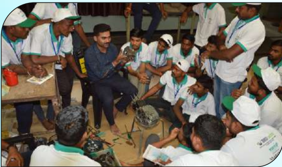
Two Wheeler Mechanic Training