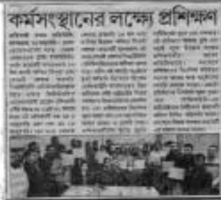
News :- Pratibadi Kolom