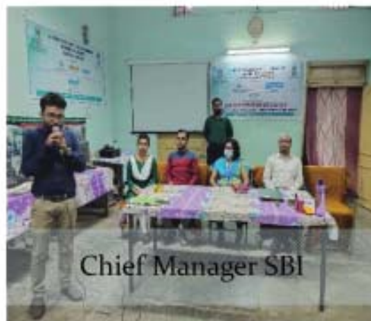
Chief Manager SBI