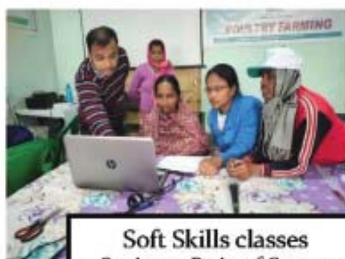
Soft Skills classes • Session on Basics of Computer