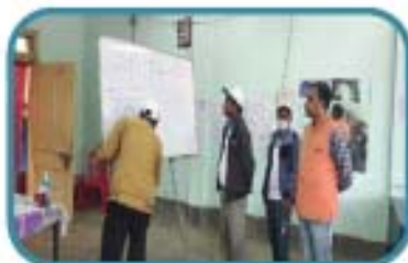
Presentation by Trainees