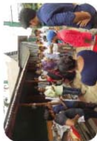
Successful Entrepreneur unit visit