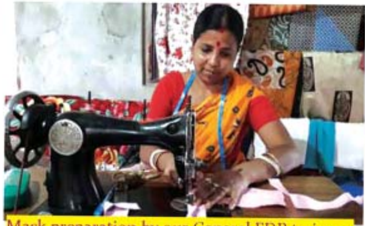
Mask preparation by our General EDP trainees