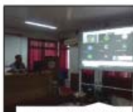
Online SENSITIZATION AT SIRD for Block officials