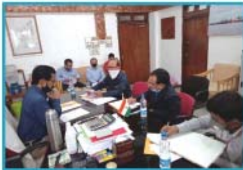
26th DLRAC Meeting