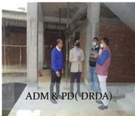
ADM & PD( DRDA)