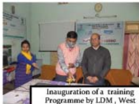
Inauguration of a training Programme by LDM , West Tripura