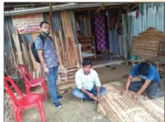
Furniture Making by the Trainee