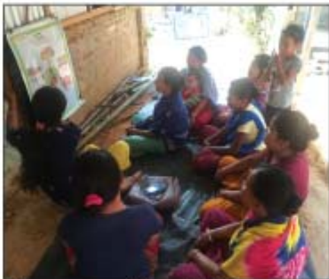
Awareness on Financial Literacy by FLCRP Trainee in the Village