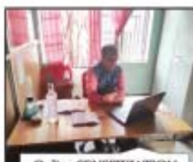
Online SENSITIZATION FOR CLUSTER COORDINATORS