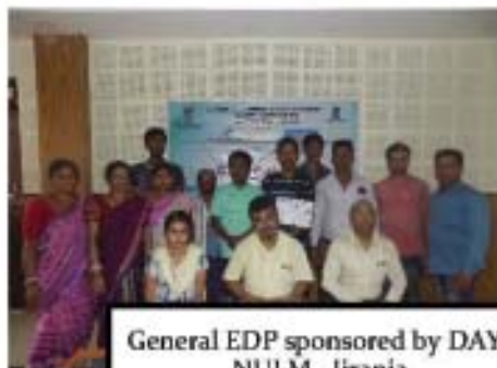
General EDP sponsored by DAY- NULM , Jirania