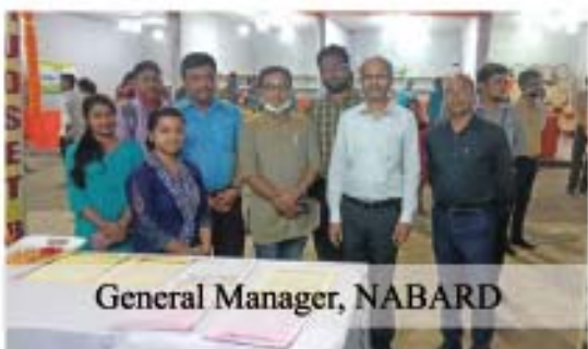
General Manager, NABARD