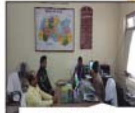
SENSITIZATION by Director