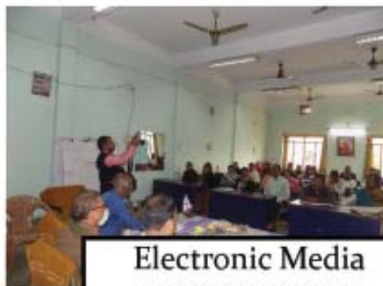
Electronic Media coverage 2020-21