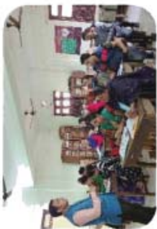
Session by In-house Faculty