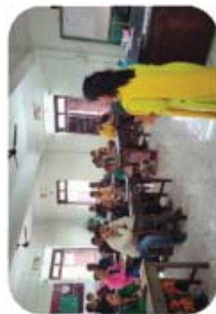
Session by In-House Faculty