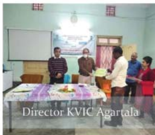
Director KVIC Agartala