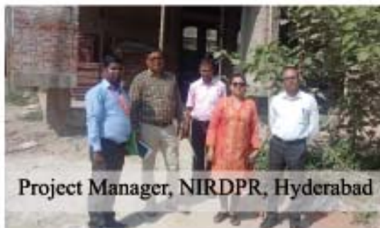
Project Manager, NIRDPR, Hyderabad