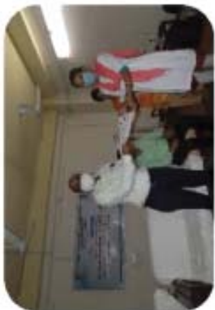
Certificate Delivery by Director