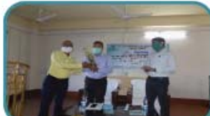
presence of Dy. CEO , TRLM in a Programme