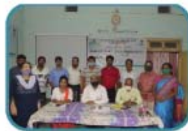
Group Photo with PMEGB beneficiaries