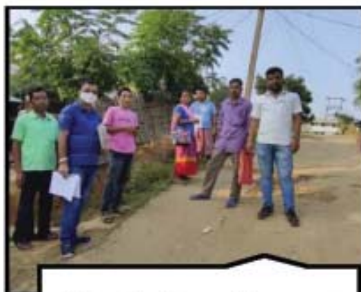
Block Level meet