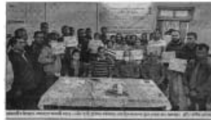
News : Syandan Patrika