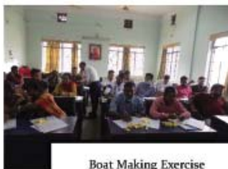
Boat Making Exercise