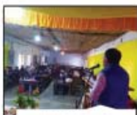
NSS VOLUNTEERS SENSITIZATION