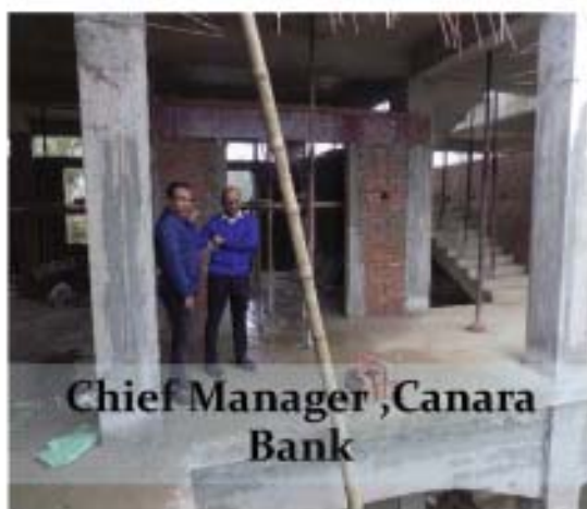
Chief Manager ,Canara Bank