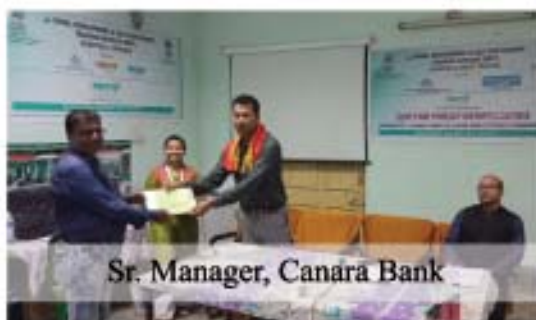
Sr. Manager, Canara Bank