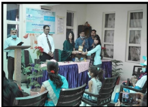
Celebration of International Women's Day