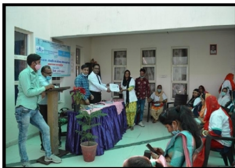
Valedictory Function of Goat Rearing Batch