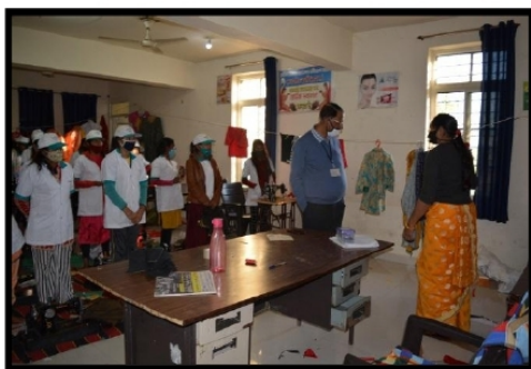
Interaction of SDR with Women's Tailoring Batch