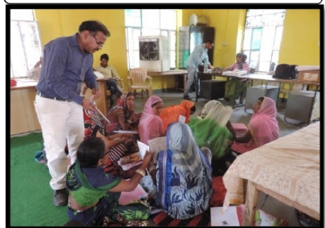
ENTERPRENEURSHIP AWARENESS CAMP