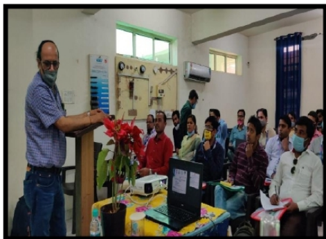
Workshop for Bankers on ACABC By NABARD