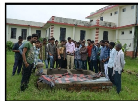
Dairy Vermi Compost Training Programme