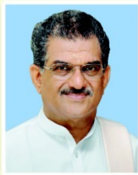
Dr D Veerendra Heggade President RUDSETIs, Dharmasthala