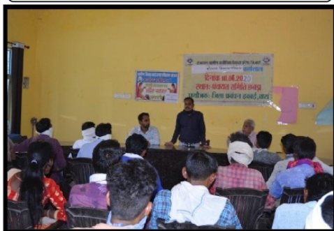
ENTERPRENEURSHIP AWARENESS CAMP