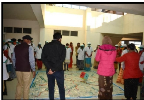
Snack & Ladder Session FL – CRPs