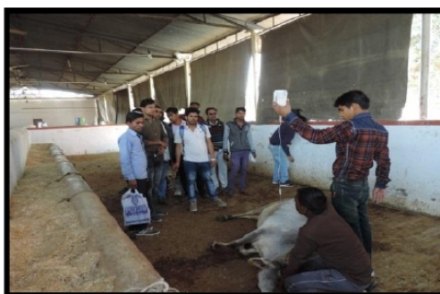
Field Visit Dairy Farming Trainees