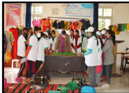
Practical Session Women's Tailor