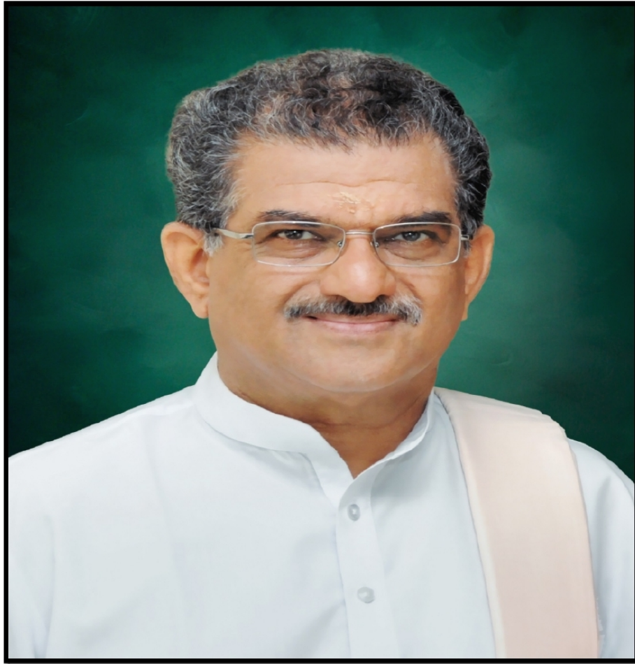
Poojya Dr. D. Veerendra Heggade

President, RUDSET Institute, Dharmasthala