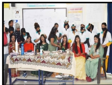
Practical Session Beauty Parlor Management