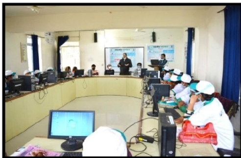
Bank Mitra Mission One GP One BC