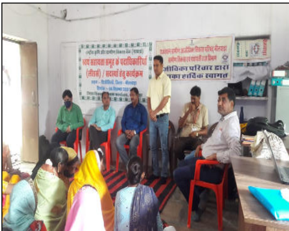
BLBC meeting attending by Director