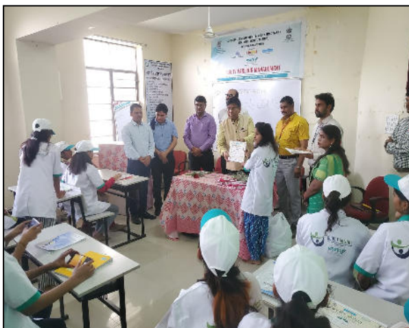
Validictory Function by VC, Sangam University and other special guests