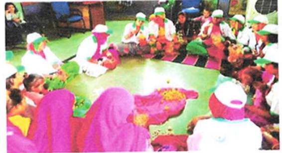
दास्ताने भीलवाड़ा @ काछेला

प्रशिक्षण में महिलाओं को लघु उद्योग व स्वरोजगार के लिये प्रेरित किया