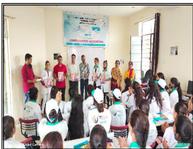
Annual Book release of NGO by RUDSETI