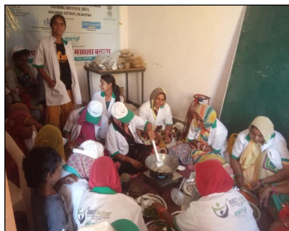
Off campus Practical Session