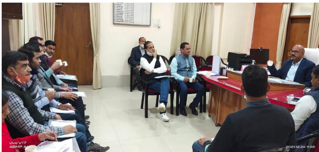
DLRAC Meeting with Members