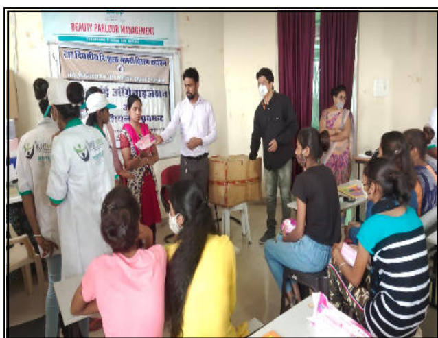
Sanitary Pad Distribution by NGO at RUDSETI