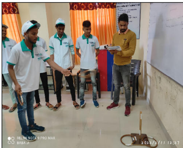
Ring Toss Exercise