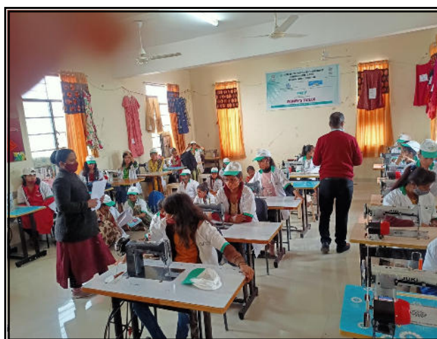
Assessment Work by Assessors