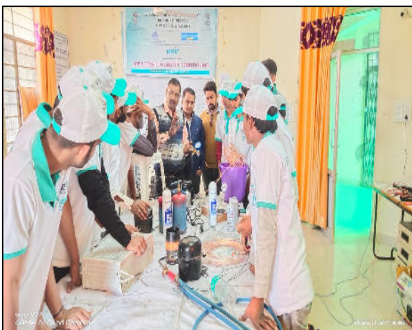
Refrigeration & Air-conditioning Practical