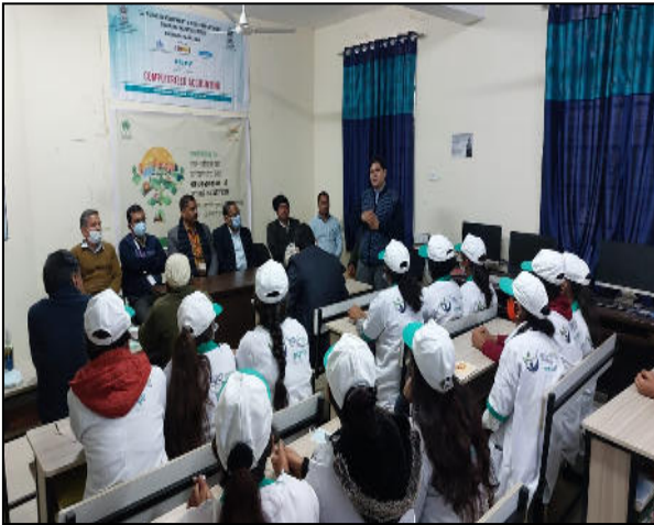
Sensitization Program for officials