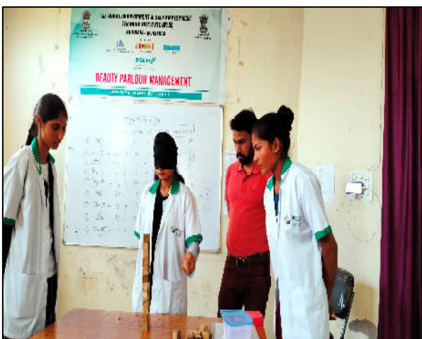
Tower Building Game