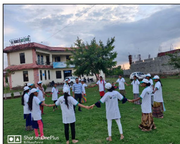
Micro Lab Exercise Session