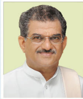
Dr D Veerendra Heggade President RUDSETIs, Dharmasthala