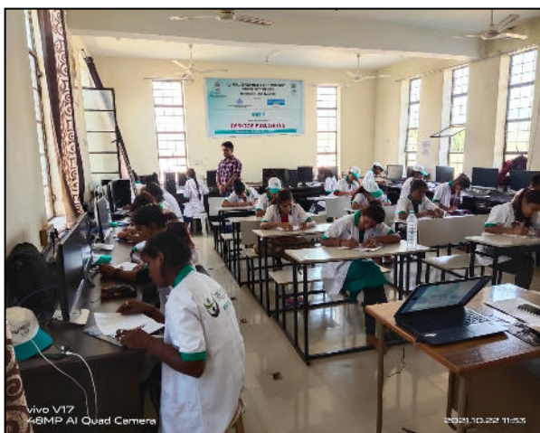
Desktop Publishing Practical Session