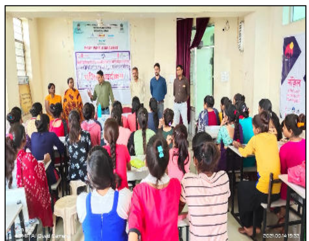
Manzil NGO's Officials Visit