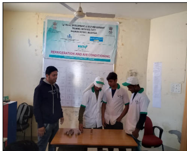
Tower Building Game