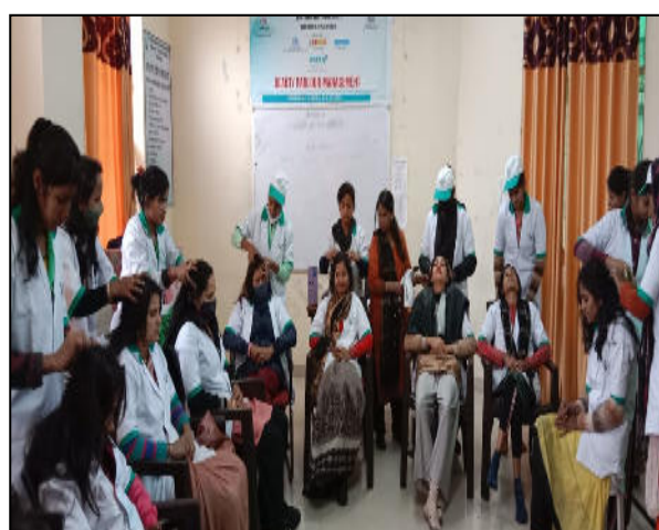
Hair Cut Practical Session