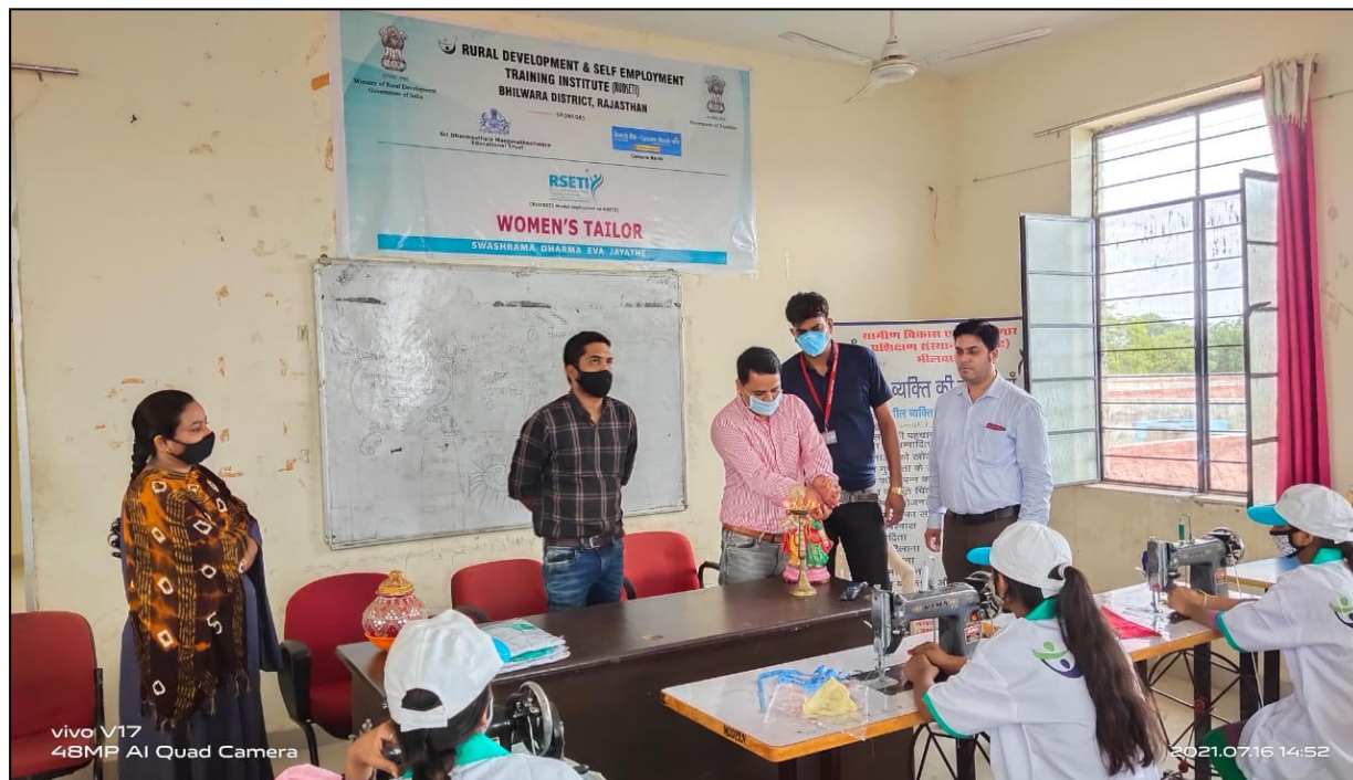
Inauguration function on Women's Tailor Batch