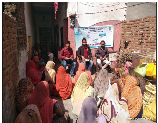
Awareness Program with NRLM