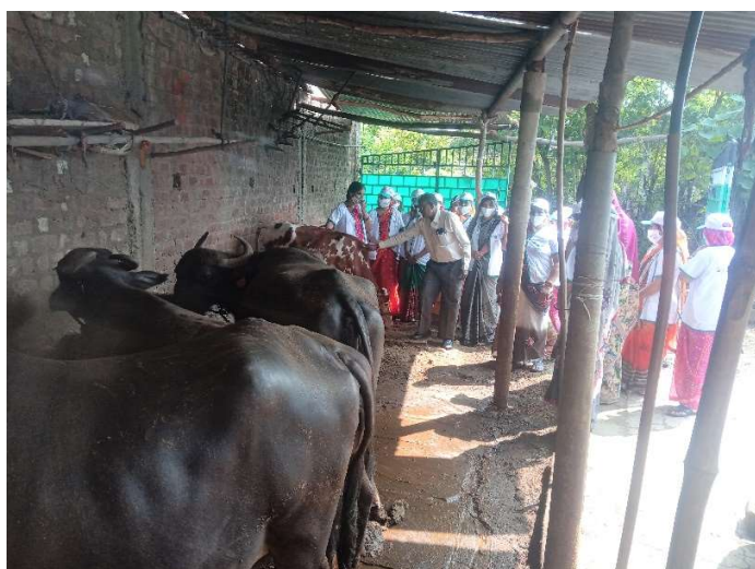
Trainees during the field visit of Dairy Farming and Vermi Compost Making Training.