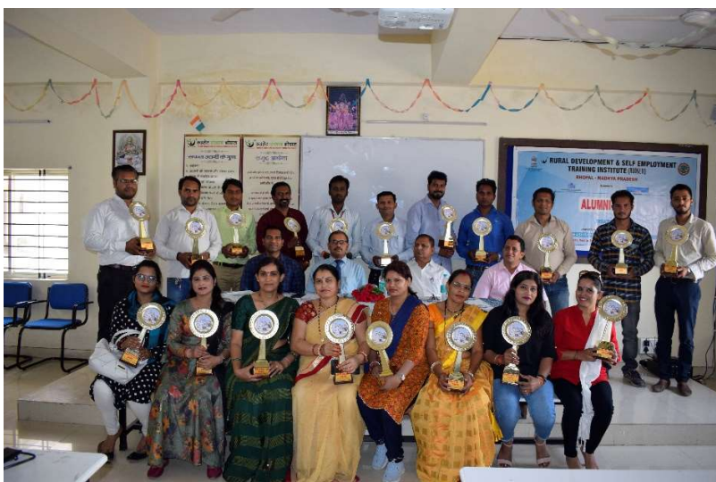
Organize Alumni Meet with the Ex. Trainees of our Institute and honored them.