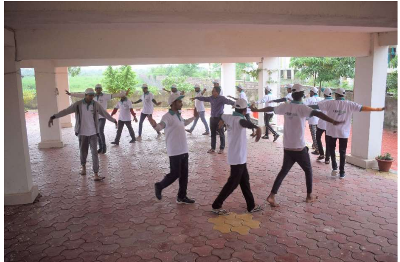
Trainees participating in Micro Lab - Ice Breaking Exercise.