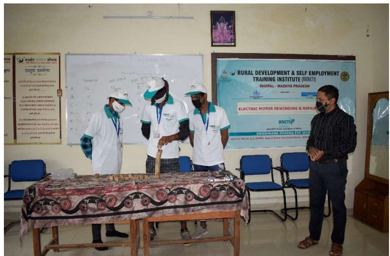
Trainees participating in Tower Building Exercise.