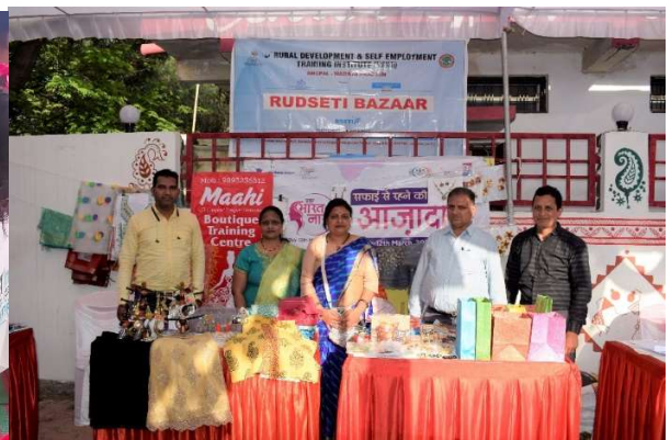
Organize RUDSETI Bazaar