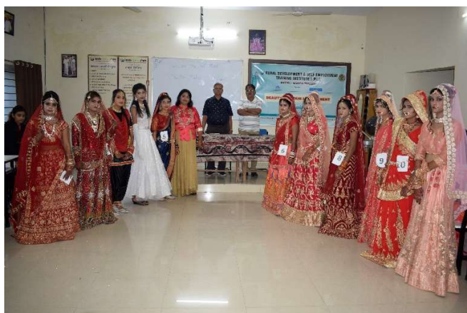
Trainees during the bridal makeup competition. Sri Vilas Kulkarni-SDR, MP also present in the function

112 follow up meets were conducted and 1093 trainees were contacted during the year.