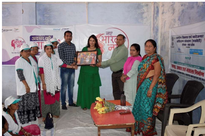
Celebration of Women's Day with Women Entrepreneurs on 08.03.2022.