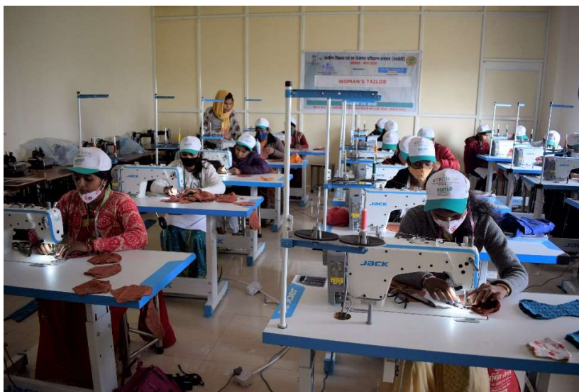
Trainees Participating in the Practical Session of Women's Tailor Training.