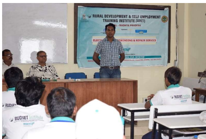
Successful Trainees meet during the ongoing Training Programme