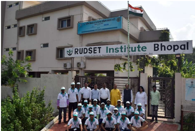
Celebration of Independence Day with the trainees of ongoing batch.