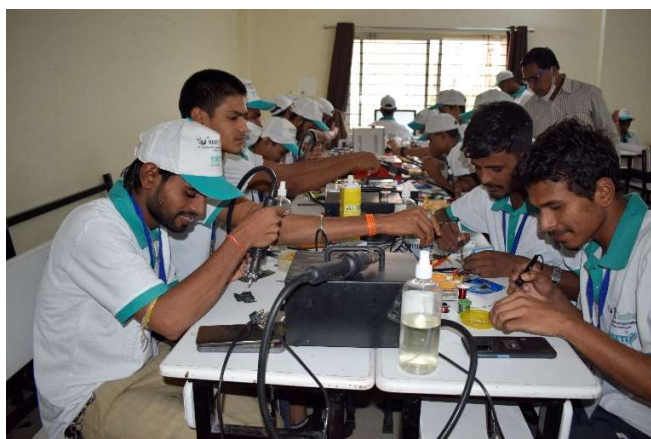
Trainees during the practical session of Cell Phone Repair & Servicing training programme.