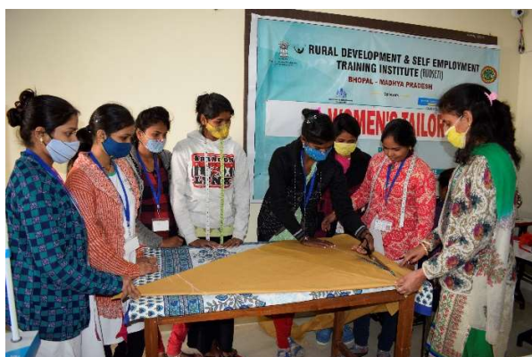
Trainees during the practical session of Women's Tailor Training Programme