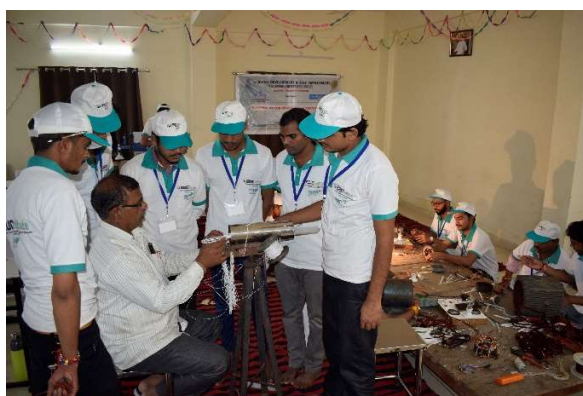
Trainees during the practical session of Electric Motor Rewinding Training Programme