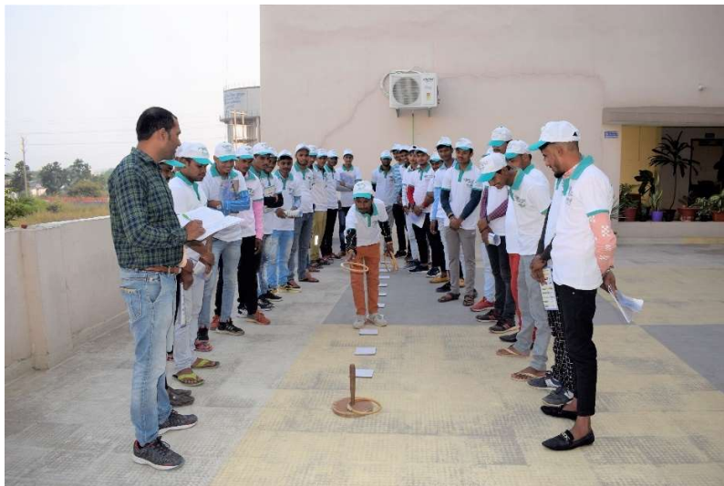
Trainees Participating in Ring Toss Game Exercise.