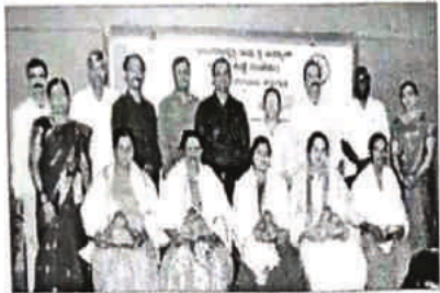
ರಿವಿಧ ಗೌಶಲ್ಯ ತಮಟು ಪಡೆದು ಮತ್ತುಮಾಗಿ ಪ್ರಕಾರಕ್ಕೂ ಈ ಮಾಡುತ್ತಿದ್ದಾರೆ ಮಹಿಳೆಯರನ್ನು क्रकार क्यूंडियान कारण कर्जार्थ कर्मीया क्रीस्त वह स्थापक.

SEEFLE DESKIN, Dath Co., of $0 ಕರ್ನಾಭದ ಮಾಯದಲ್ಲಿ ಬೆಡ್ಡ ಅಧ್ಯಕ್ಷ ಕ್ಷಿ ಸೇವಿ ಮಾತನಾಡಿ, ಬ್ಯಾಂಕೆಂಗ್ ರಚನೆ ಮುಗೆಯರು ಹಚ್ಚಿನ ಪ್ರಮಾದಲ್ಲಿ ಸೇರ್ಪಡೆಯಾಗುತ್ತಿದ್ದಾರೆ.