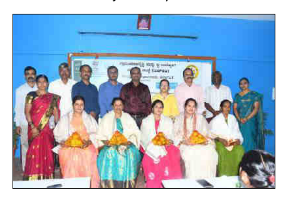
Celebration of International Women's Day on March 8-3-2022