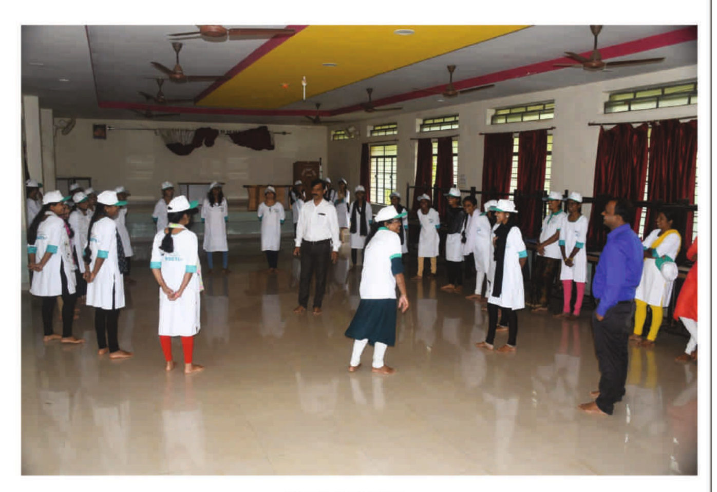
Micro Lab Session

During the year we have organized 102 EAPs for 5206 candidates.