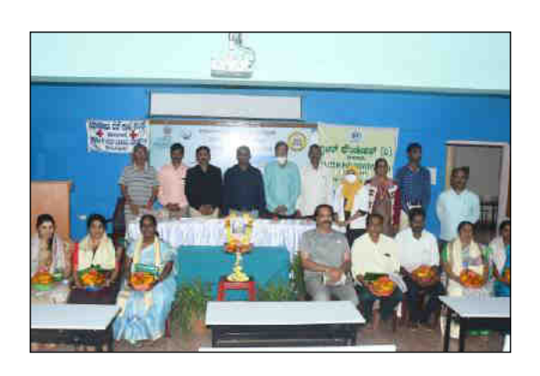
Celebration of Canara Bank Founders day by felicitating Dharwad district health care takers.