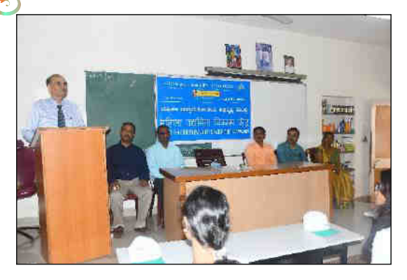
Canara Bank, CED Cell, CO, Hubli conducted awareness programme on Women Entrepreneurship & distributed the kits.