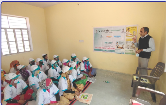
Financial Literacy Week- Awareness programmes conducted by Director & Faculty on Financial Literacy at Village-Bassi Naga, Hingoniya and Bhainsawa.