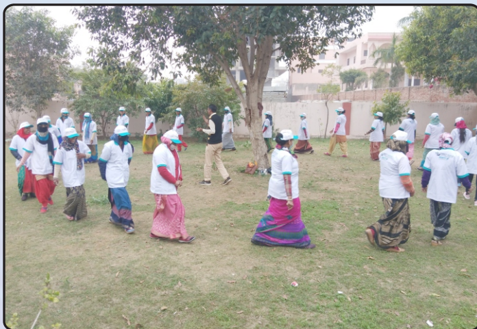
Ice-breaking session through Micro-lab.