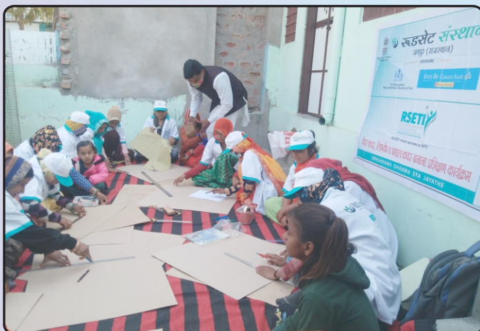
Paper Cover, Envelope and File Making training programme.