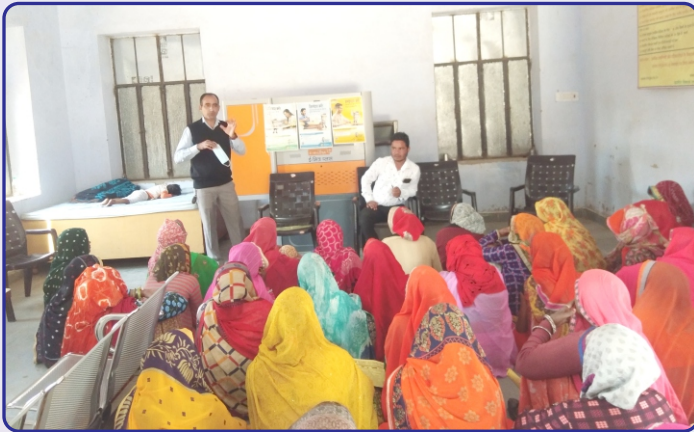
An awareness programme was organized at Gram Bheslana.