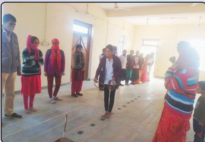
Ring Toss Game.