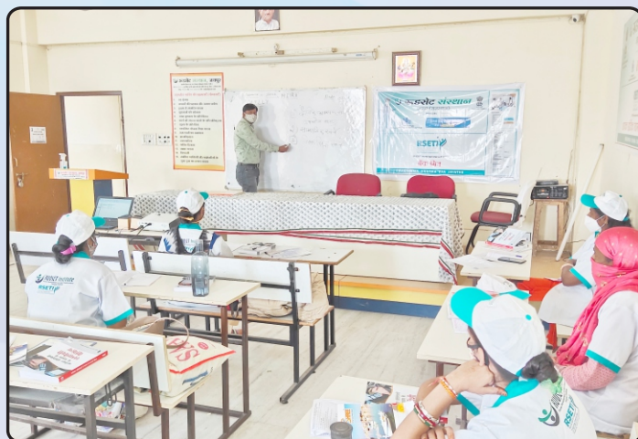
Bank Mitra training under -One GP One BC