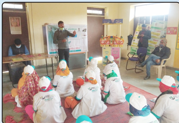
Dairy Farming & Vermi Compost Making training programme.