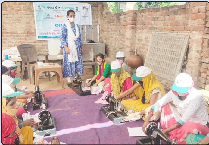
Women's tailor training programme.