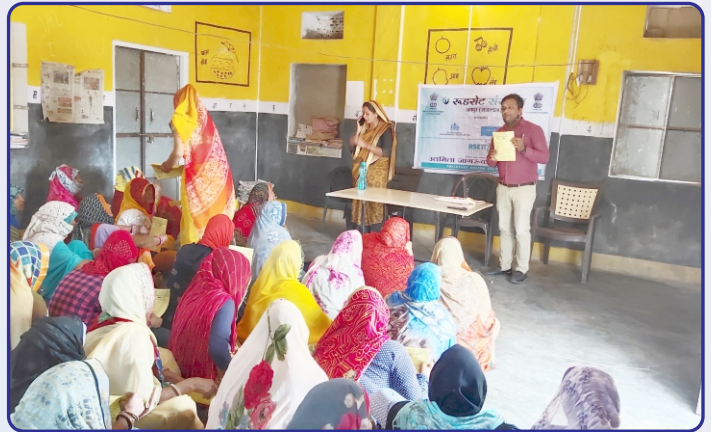
A awareness programme was organized at Village-Dewala.