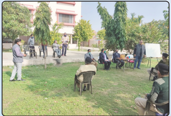
HRD programme for Canara Bank Armed Guards.