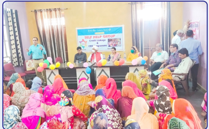
Women's day celebrated at Village- Daulatpura. SHG members participated in this programme.