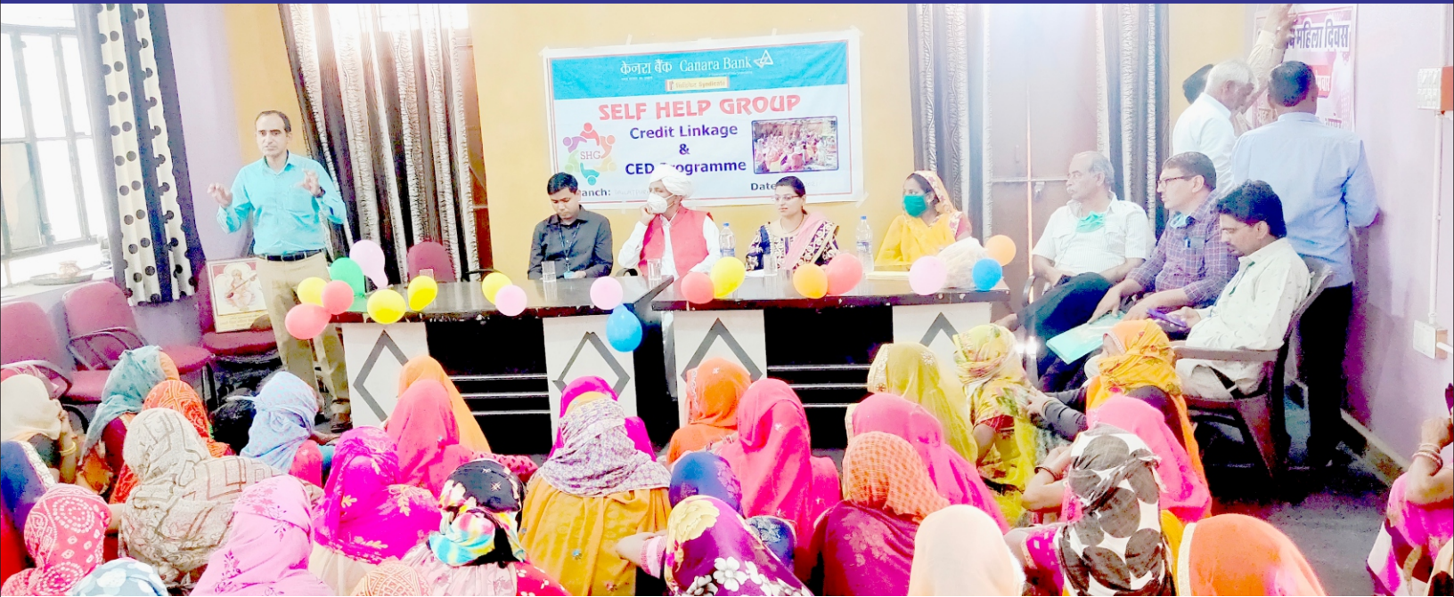
SHG credit camp organised at adopted village- Daulatpura Tehsil- Amer, District-Jaipur. Programme was conducted by Canara Bank, Regional Office, Jaipur.