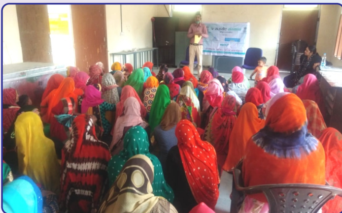
An awareness programme was organized at Village-Ramjipura.