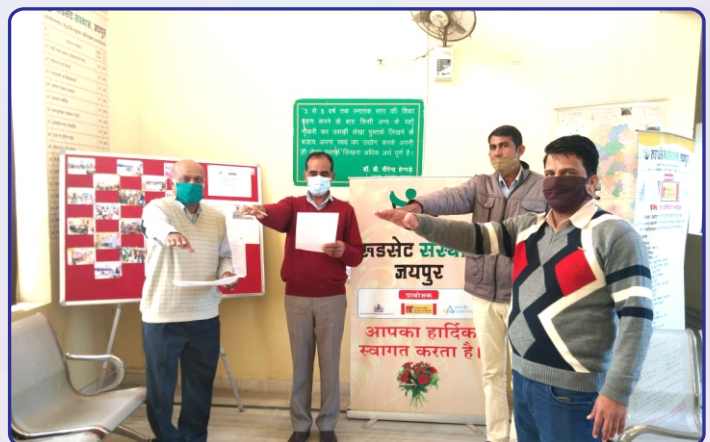
National Constitution Day celebrated at our institute on 26.11.2020