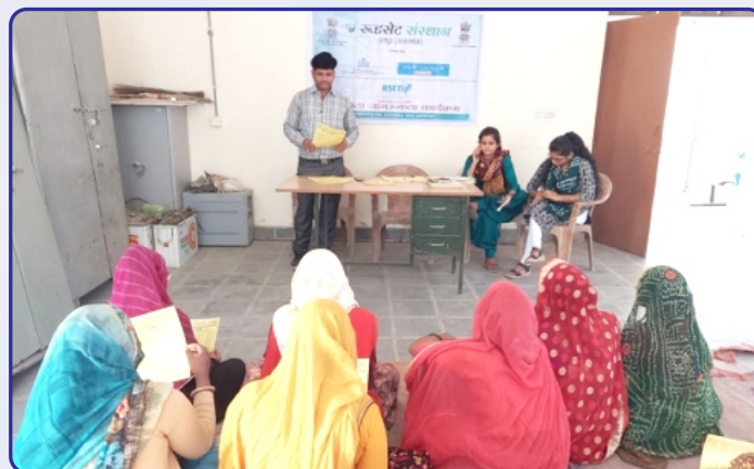
An awareness programme was organized at Village-Dhamana.