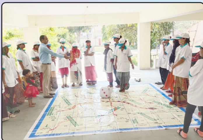
Financial Literacy for FLCRP training programme.