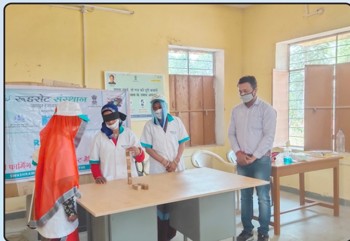
Tower Building Game.