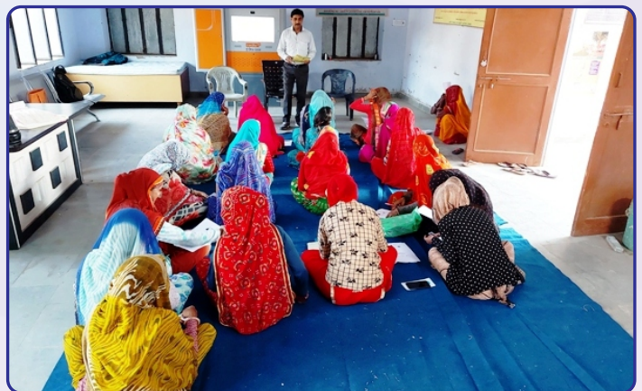
An awareness programme was organized at Village-Bhaisawa.