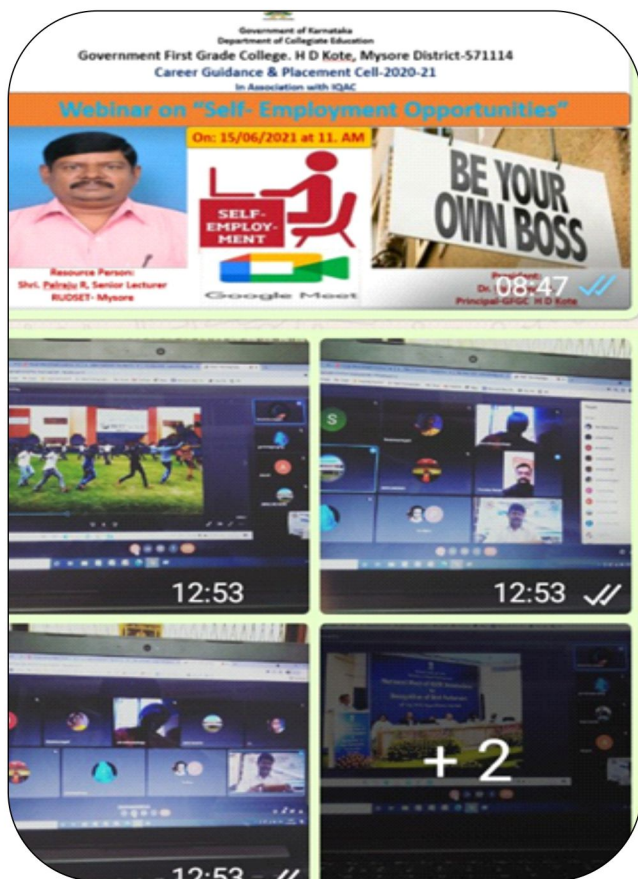
Sri Paulraju, Sr Faculty conducted online EAP during COVID Pandemic