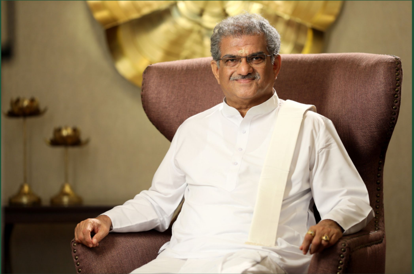
Padmavibhushana Dr. D. Veerendra Heggade President, RUDSET Institutes

“Instead of writing someone else’s account through wage employment after three to five years of collegiate education, it is more meaningful to write one’s own account by embarking upon some self-employment”