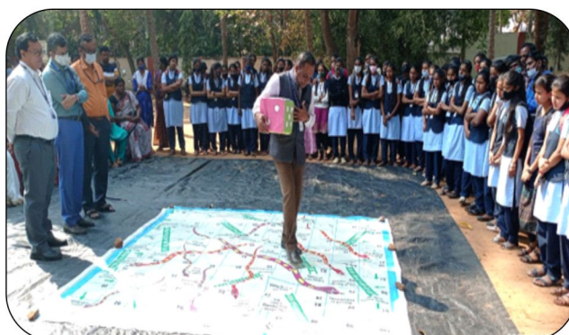
Snake and Ladder Game as part of RBI Financial Literacy programme