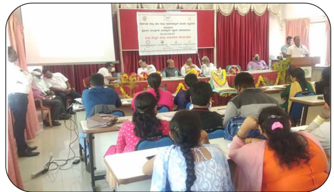
The Director addressing the participants in the "Awareness programme on PMEGP Scheme" conducted by K&VIB, State Office at Mysuru