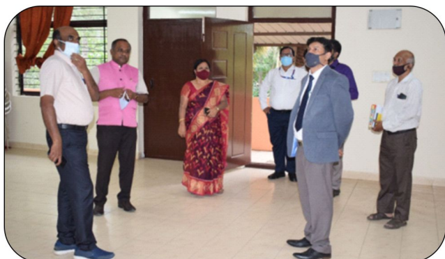
The Chairman & Members of DLRAC inspecting the infrastructure facilities of the Institute