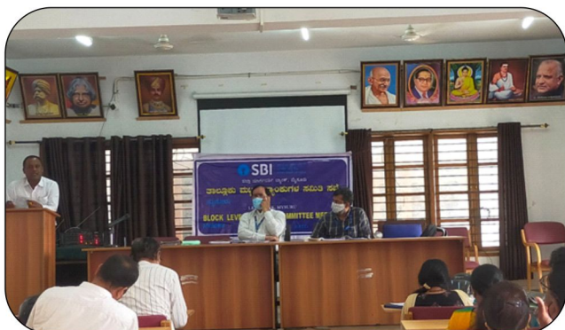
Director in one of the BLBC Meeting