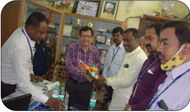
The Executive Director welcomed by the successful entrepreneur on his first visit to our Institute