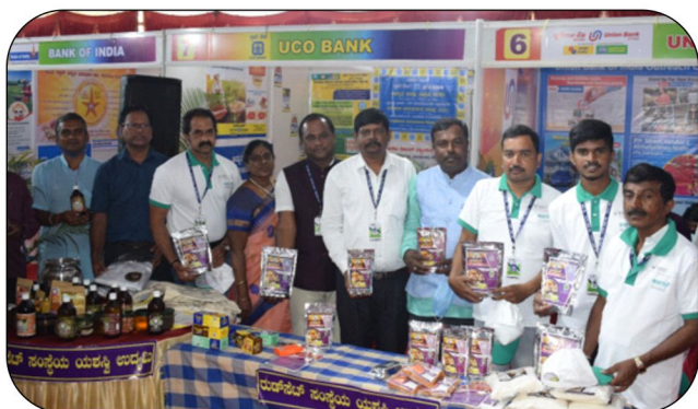
The Team-RUDSETI, Mysuru at RUDSET Bazaar in the Dist Level Bankers Outreach Programme