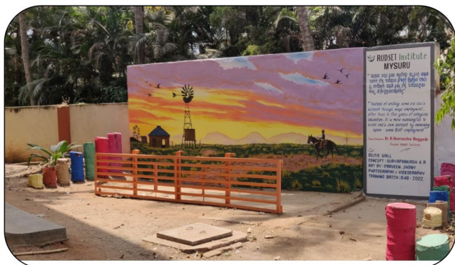
Selfie Wall created by Photography Videography batch