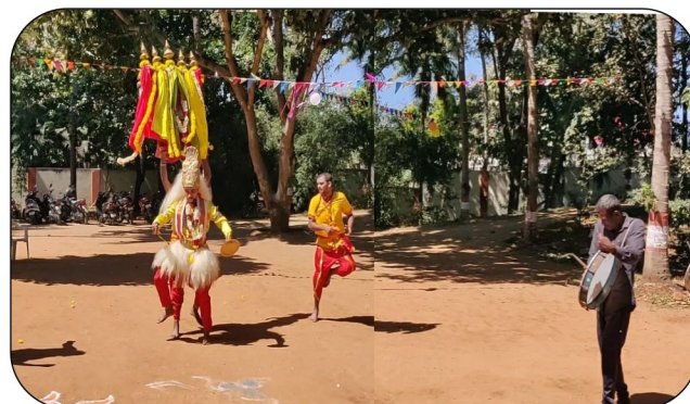
Cultural Event Activities on Project Work