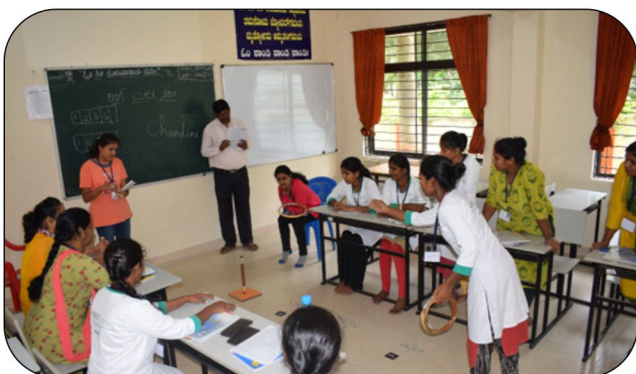
Trainees of Women Tailor playing Ring Toss Game