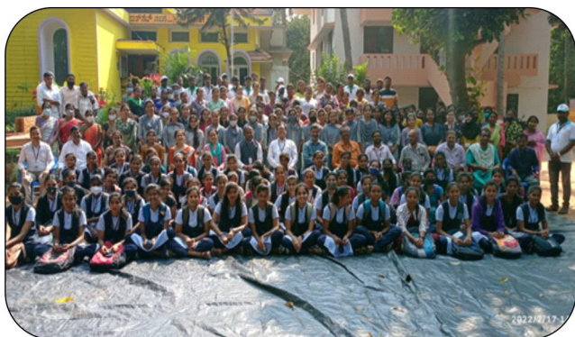
Participants from College, SHG Members & our Trainees in RBI Programme