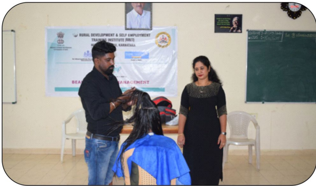
Trainees of Beauty Parlour Management practicing hair straightening during Practicals