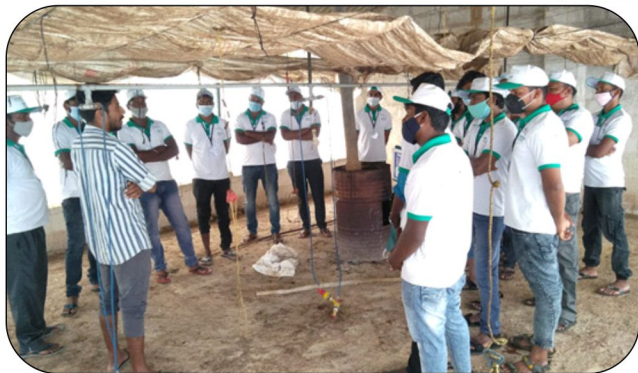
Trainees of Poultry training during their visit to a Poultry farm