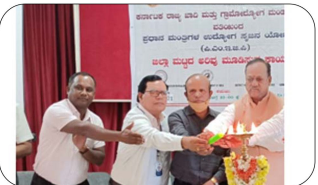
District Level "Awareness Programme on PMEGP" conducted by KVIB State Office at Mysuru