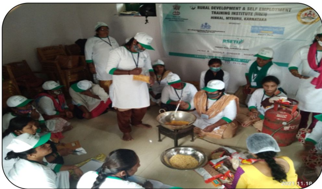
Trainees of Papad, Pickle and Masala Powder involved in Practicals