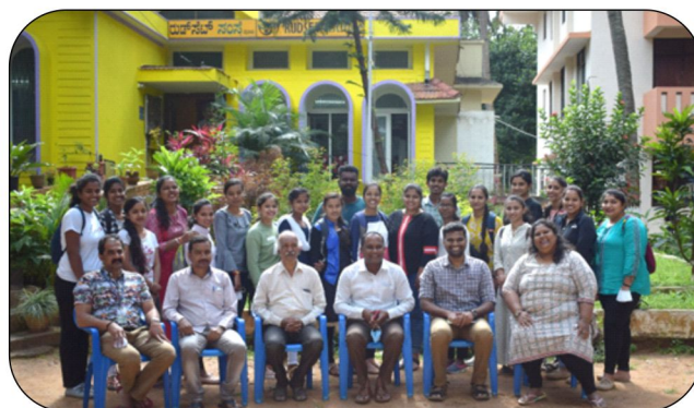
Group of MSW students from University of Mysuru visited as a part of their project work