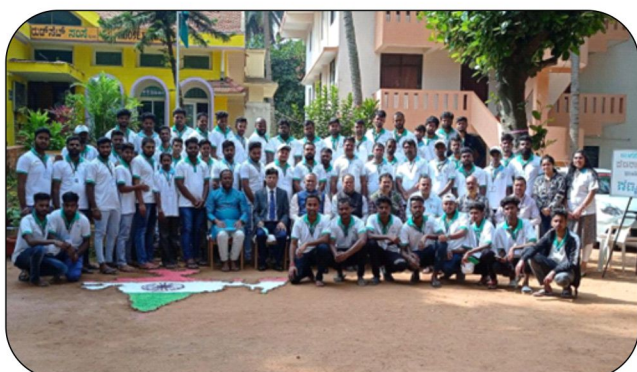
Republic Day celebration in the presence of Canara Bank Executives