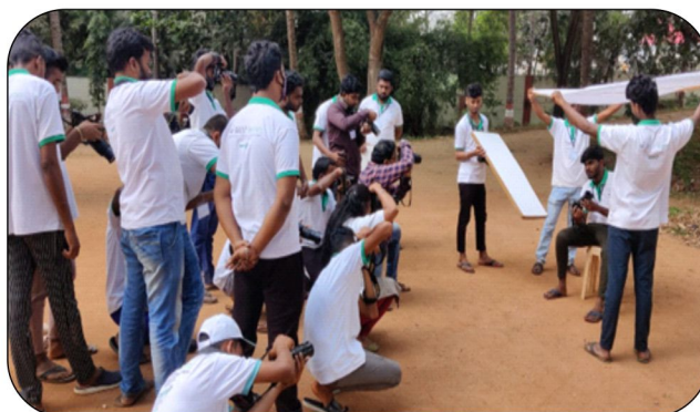
Trainees of Photography & Videography in Practical Session