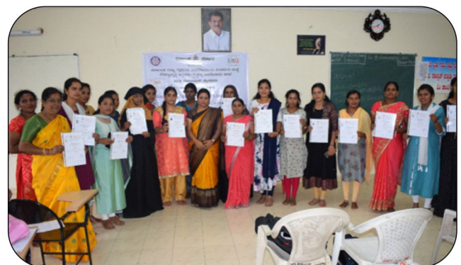
Trainees of BC Sakhi batch received certificates of IIBF Exam