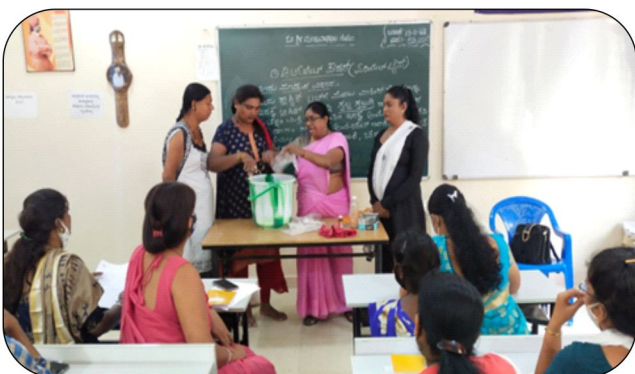
Practical session in EDP training to Transgenders & Dhanashree Batch