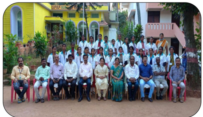
Trainees of FLCRP with Dignitaries