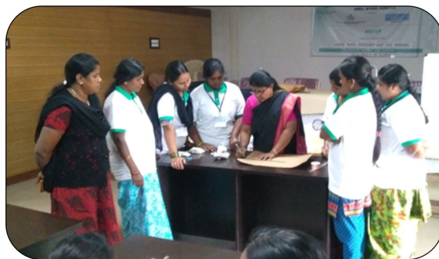
Ms Lingamma DST- Paper Cover, Envelope and File Making trainees demonstrating Paper Products mfg process