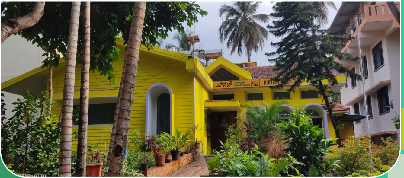
RUDSET Institute, Mysuru, Karnataka

The Director RUDSET Institute [Rural Development & Self Employment Training Institute] Main Road, Hinkal, Mysuru - 570 030, Karnataka State, Phone: 0821-2519663, 2516663, Mob: 9449860466 e-mail : rudseti1992@gmail.com | www.rudsetitraining.org