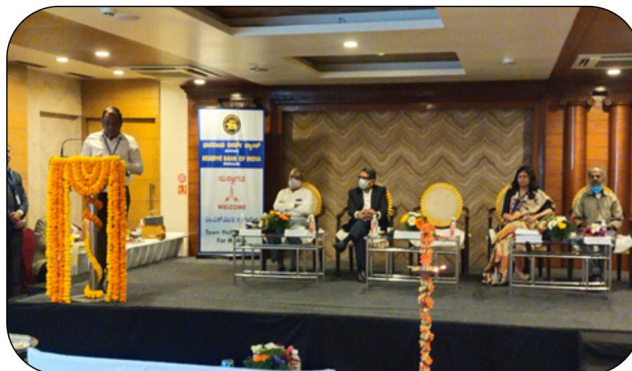
RBI Town Hall programme at Mysuru