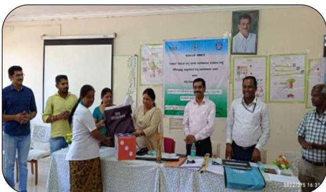
Valedictory programme of FLCRP training Training Kit distributed