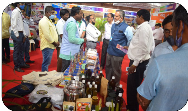
Past trainees interacting with the Executives of Canara Bank at RUDSET Bazaar