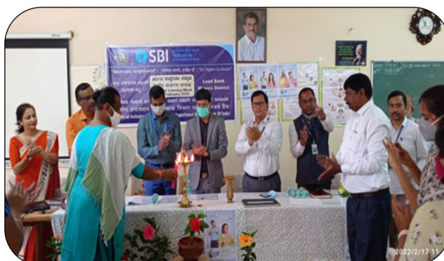
RBI Programme as part of Financial Literacy week 2022