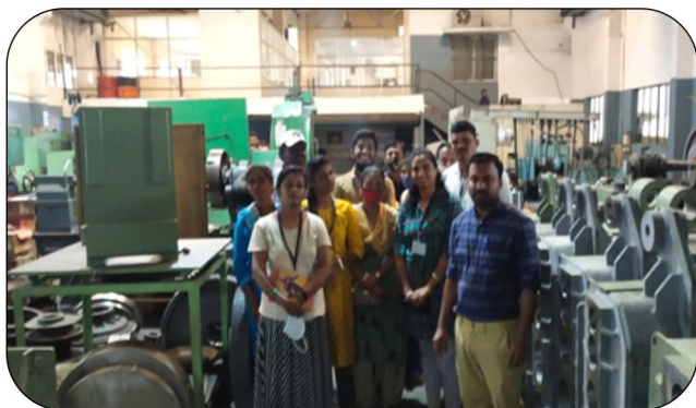
PMEGP-EDP Trainees during their Industrial Visit