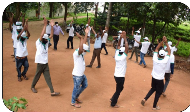
The Trainees of Dairy farming undergoing Ice Breaking Session (Simulation Game)