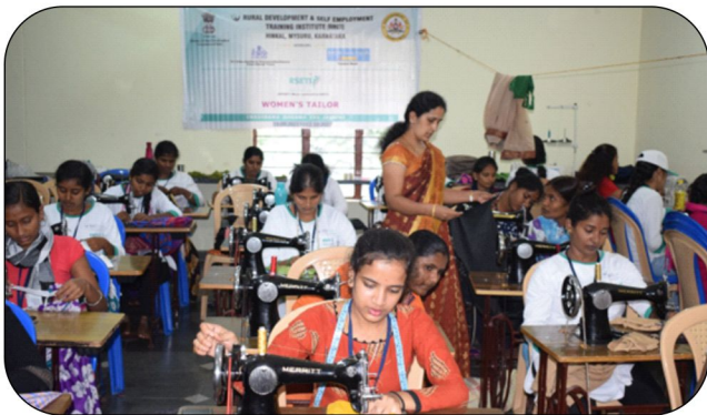
Womens Tailor trainees during Practicals