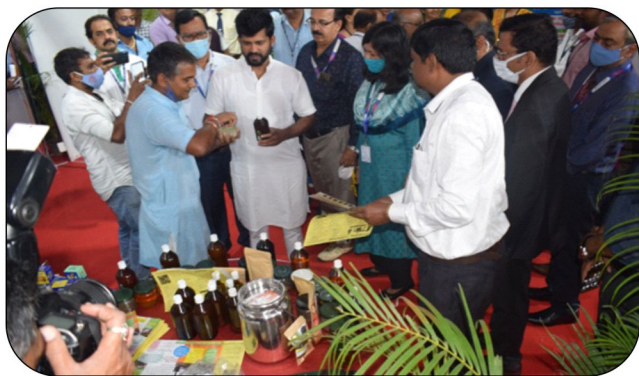
Sri Pratap Simha, Hon'ble MP, Mysuru visited our RUDSET Bazaar