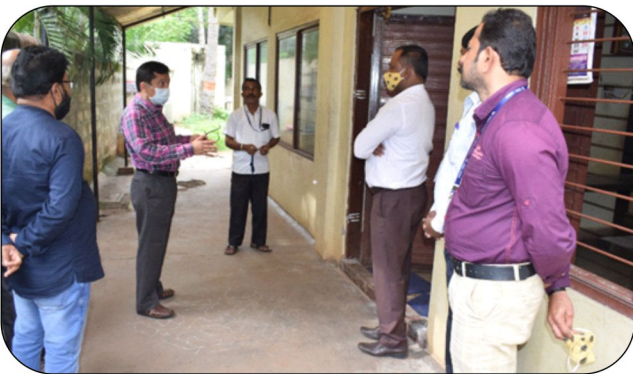
The Executive Director explaining to the Director & Staff about campus development