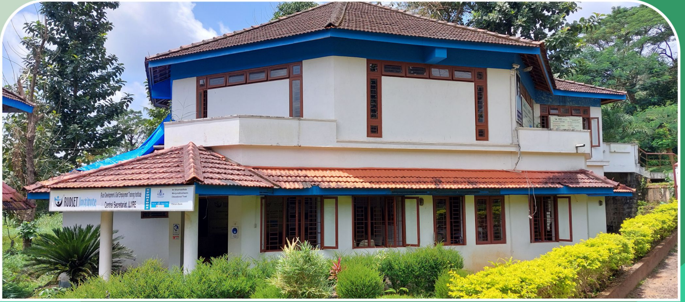
Central Secretariat, Ujire, Dakshina Kannada, Karnataka