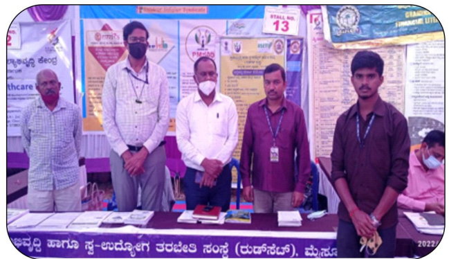
The Director & Staff along with Canara Bank Officer in the stall of 'Udyoga Mela' conducted at Mysuru city limits