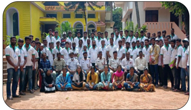
V V Mohalla Traffic Police visit as part of awareness programme on traffic rules