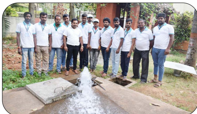
Trainees of Electrical Motor Rewinding & Repair Services operating Submersible Pumpset