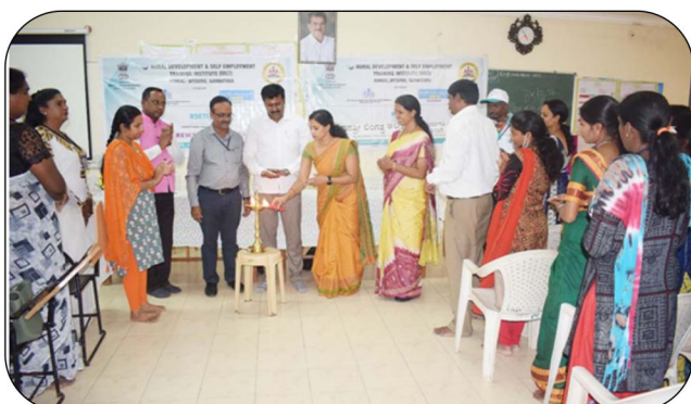
Inauguration of Transgenders Training Batch