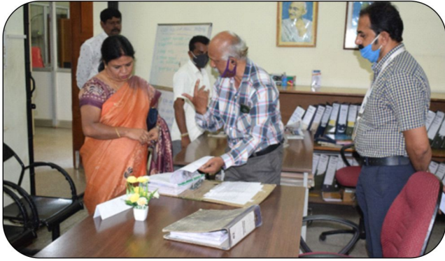
PD, ZP during verification of NLRM BPL claims