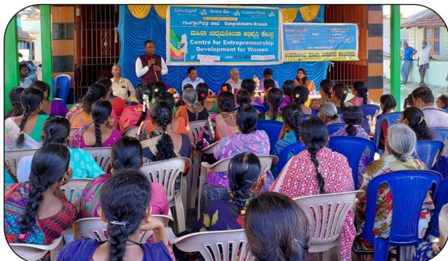
Rural Development programme on International Women's Day