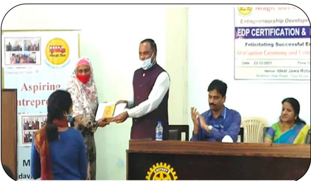
Valedictory programme of Training Programme by Magic Bus NGO