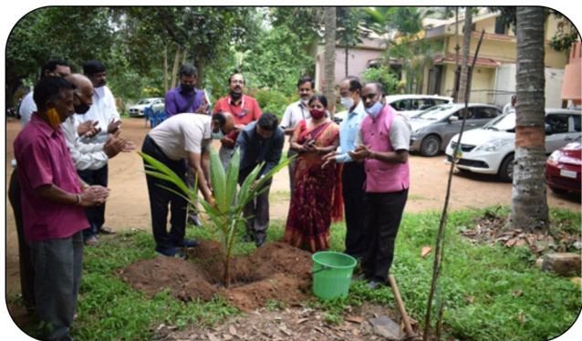
The Chairman & Members of DLRAC participated in "Vanamahotsava" programme