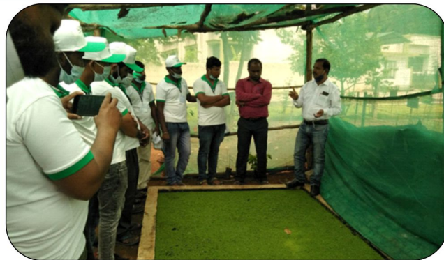
Trainees of Dairy farming & Vermicompost Making understanding the Azolla Cultivation at KMF Training centre, Alanahalli, Mysuru