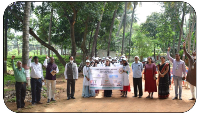
Jatha is being organised on the occasion of "National Youth Day" at our Institute campus