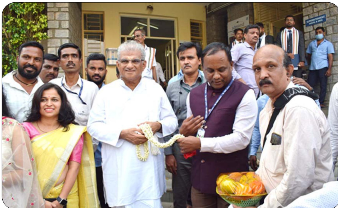
The Director and Staff received blessings of our beloved National President, RUDSET Institutes Dr. D. Veerendra Heggade during his visit to Mysuru