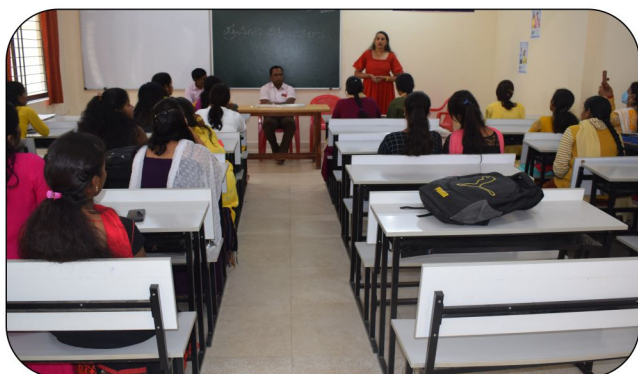
The trainees of Tailoring Batch sharing their experience during a follow-up meet