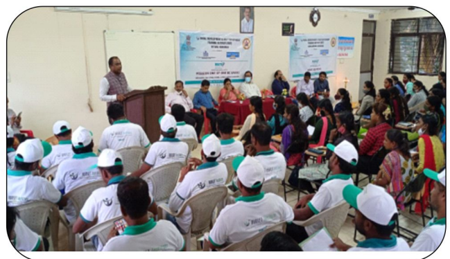
Valedictory Programme of BC Sakhi Batch