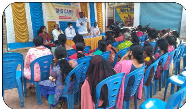
Village Level EAP organized by Canara Bank