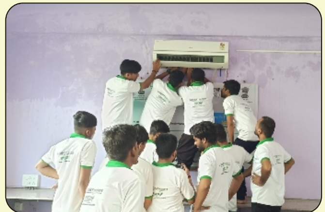
Action Photo of Refrigeration and Air Conditioning