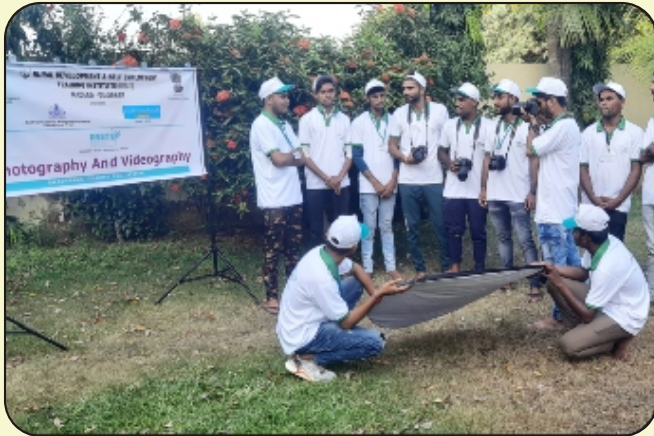
Action Photo of Photography & Videography