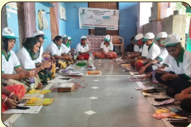
Action Photo of Aggarbati Making