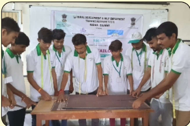
Action Photo of Men's Tailor