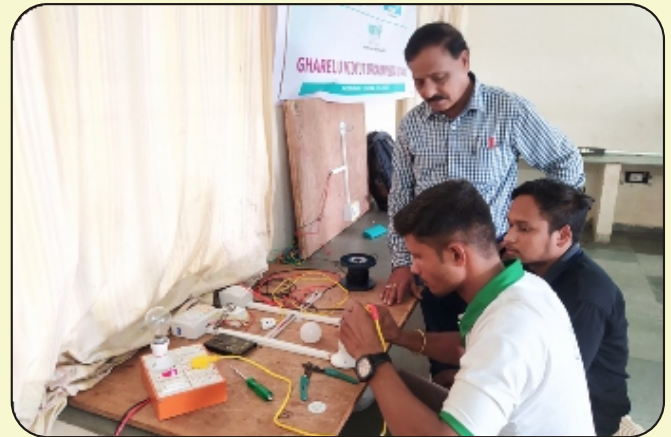
Action Photo of Garelu Vidhyut Upkaran Seva Udyami