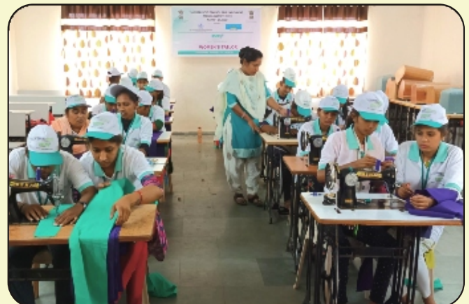
Action Photo of Women's Tailor