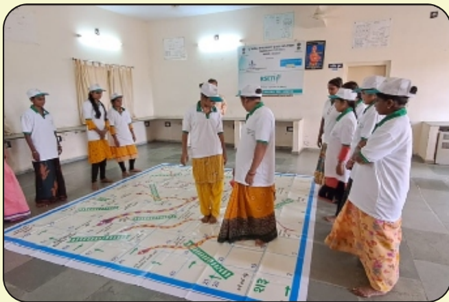
Action Photo of FLCRPs