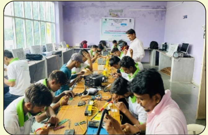
Action Photo of Cell Phone Repair & Service