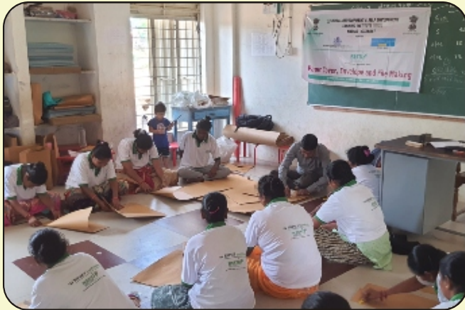
Action Photo of Paper Cover, Envelope and File Making