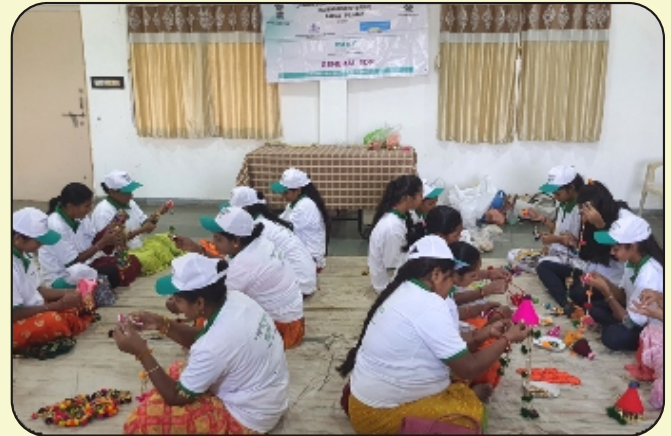
Action Photo of General EDP - Toran Making