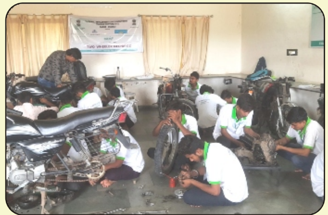
Action Photo of Two Wheeler Mechanic