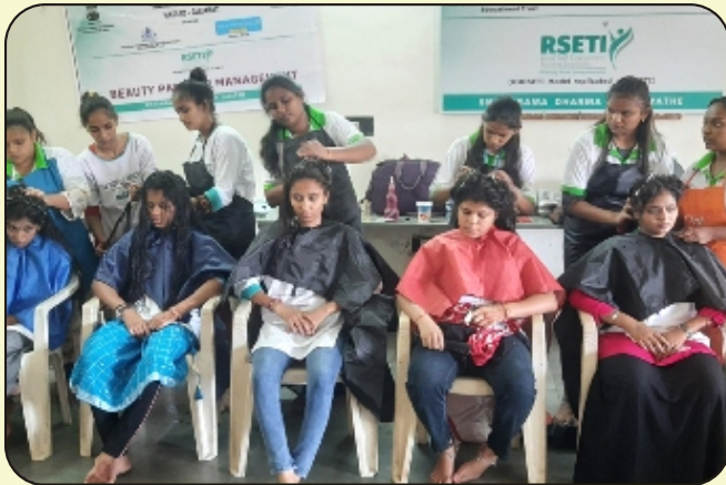
Action Photo of Beauty Parlour Management