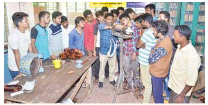
Trainees in Electric Motor Rewinding & Repair Services practical