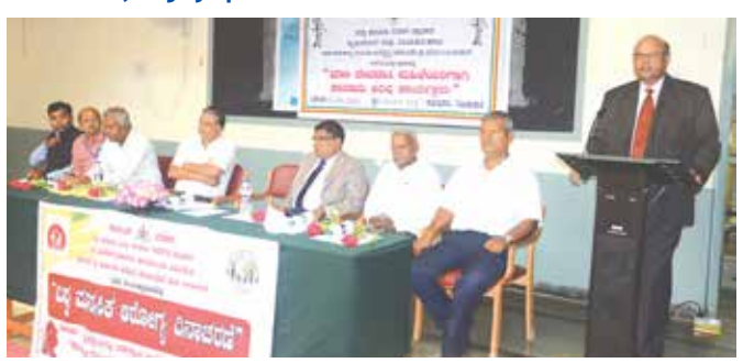
Workshop on "Beti Bachao Beti Padhao" RUDSETI, Vijayapura