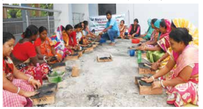
Trainees in Homemade Agarbatti Maker practical

The Institute organised Credit Linkage camps and participated in World Youth Skill Day campaign.