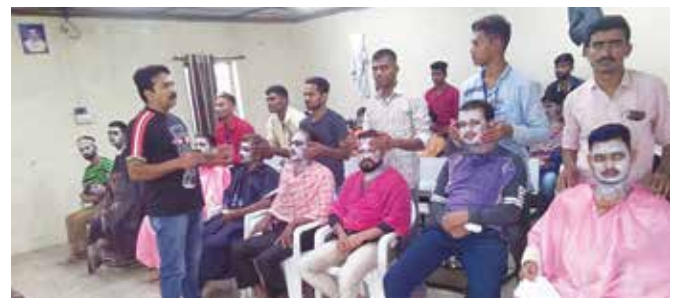
Trainees in Men's Parlour and Salon Udyami practical