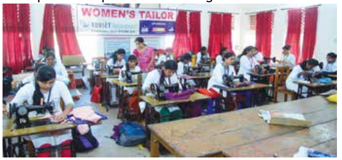
Trainees in Women's Tailor practical

The institute conducted two programmes of Agriculture Department, six programmes of PMEGP and one Entrepreneurship Orientation Programme.