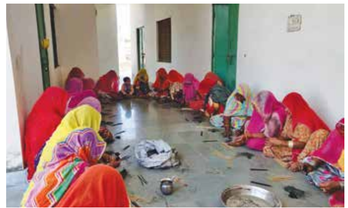
Trainees in Homemade Agarbatti Maker practical

The institute organised two RUDSETI Bazaars, first on