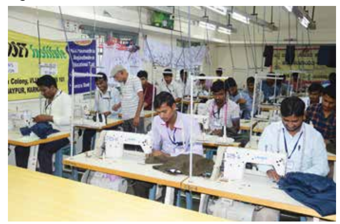
Trainees in Men's Tailor practical

The institute organised Workshops on "National Entrepreneurship Award 2019", "Ayushaman Bharat, Poshan Abhiyan, Jalashakti Abhiyan & Swasth SHG Pariwar", "Legal Awareness", "Beti Bachao Beti Padhao" & "Juvenile Justice Care & Protection of Children", Blood donation, Credit & free Two Wheeler Servicing camps and participated in World Youth Skill Day campaign & Vigilance Week.