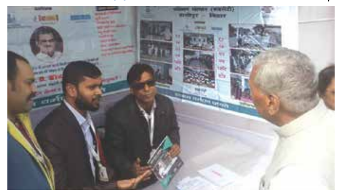
Visit of Sri Vijay Kumar Sinha, Hon'ble Minister for Labour Resources, Govt of Bihar RUDSETI Stall, Hajipur