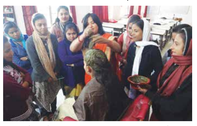
Trainees in Beauty Parlour Management practical