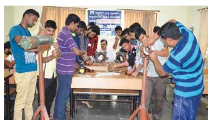
Trainees in Electric Motor Rewinding & Repair Services practical