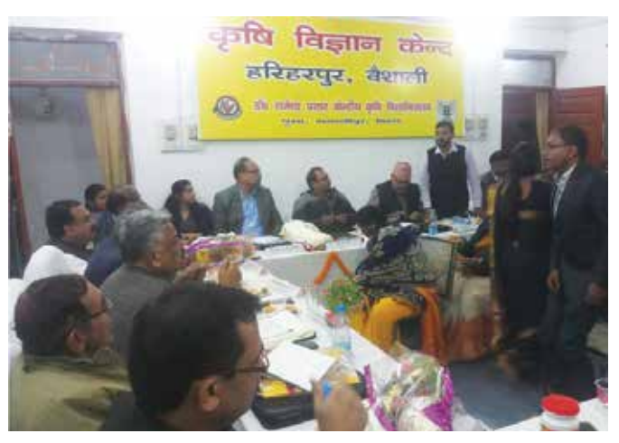
Sensitisation to Bank Managers & Govt Officials -RUDSETI, Hajipur