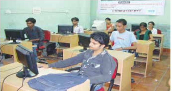
Trainees in Entrepreneurship in Desktop Publishing practical