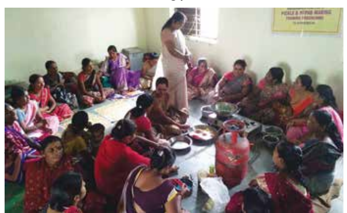
Trainees in Papad, Pickle & Masala Powder Entrepreneur practical