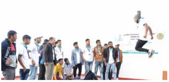
Trainees in Photography & Videography practical

The Institute participated in Vigilance Week.