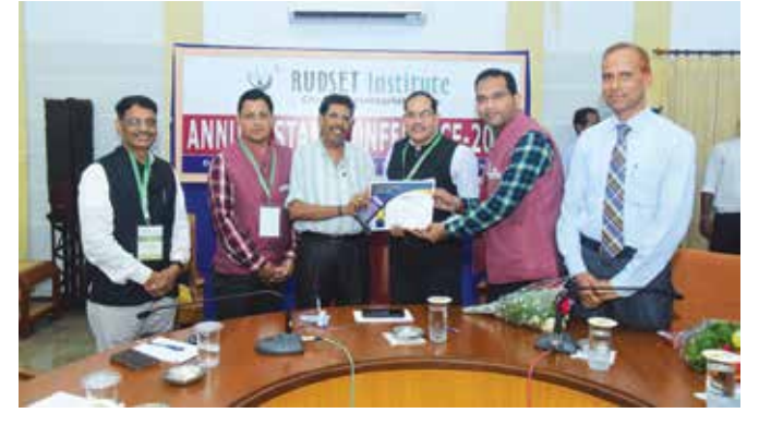
Mobilisation of Funds - RUDSETI, Vijayapura