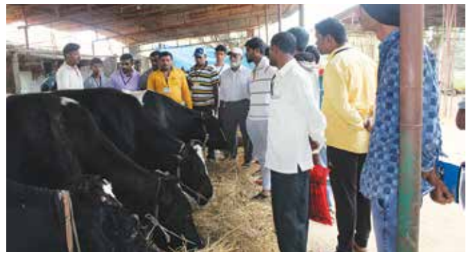
Visit to Dairy Farm of a progressive farmer