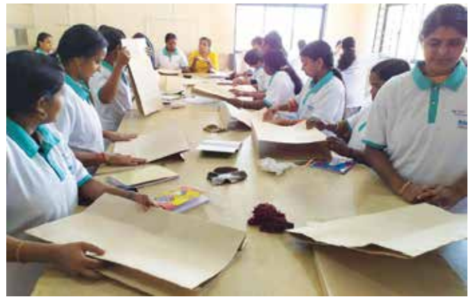
Trainees in Entrepreneurship in Paper Cover, Envelope & File Making practical

The institute organised Workshop on "Goods & Services Tax", Credit & free Two Wheeler Servicing camps and participated in Vigilance Week.