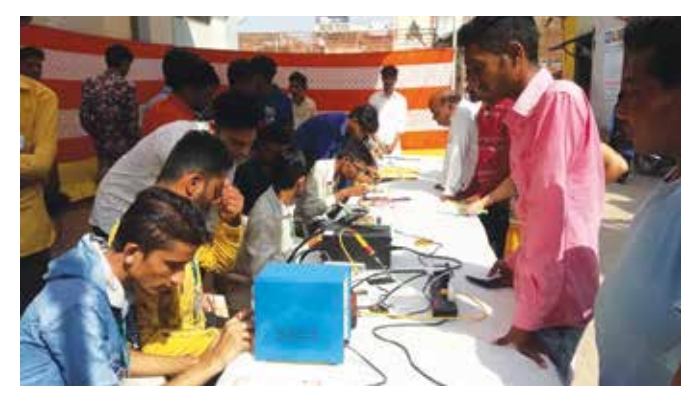
Free Health Checkup CampsRUDSETI, OngoleRUDSETI, Hajipur