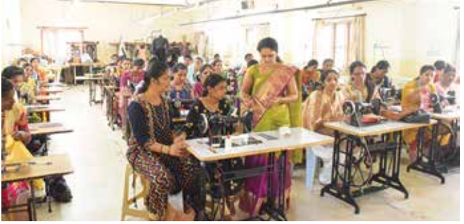
Trainees in Women's Tailor practical

The institute organised Blood donation camp and participated in World Youth Skill Day campaign.