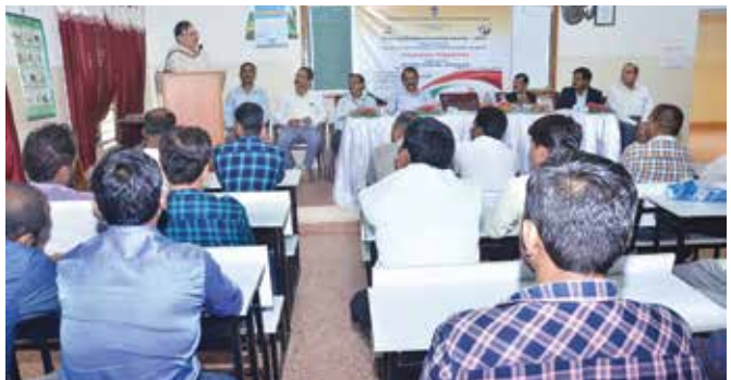
RUDSETI , Kannur