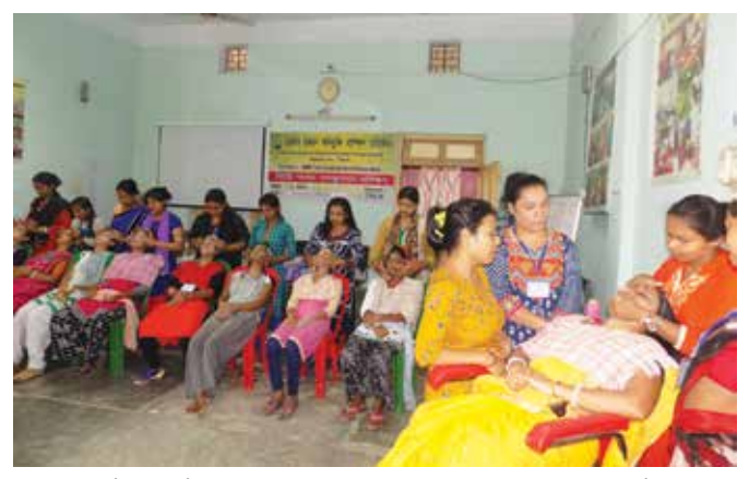
Trainees in Beauty Parlour Management practical