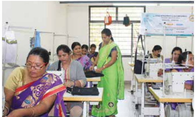
Trainees in Jute Products Udyami practical

The institute organised RUDSETI Bazaar from 24th to 27th October 2019 on the occasion of Krishi Mela at Bengaluru, wherein past trainees of RUDSETI participated and made handsome sales.