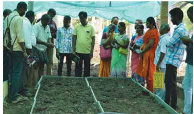
Visit to Vermi Composting unit of a progressive farmer

The institute organised free Two Wheeler Servicing camp and participated in World Youth Skill Day campaign & Vigilance Week.