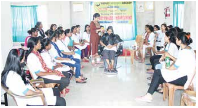
Trainees in Beauty Parlour Management practical