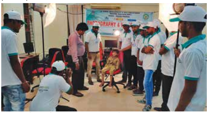
Trainees in Photography & Videography practical

The institute organised one RUDSETI Bazaar on 15.07.2019 on the occasion of World Youth Skill Day at Ongole, wherein a good number of entrepreneurs participated and benefited.