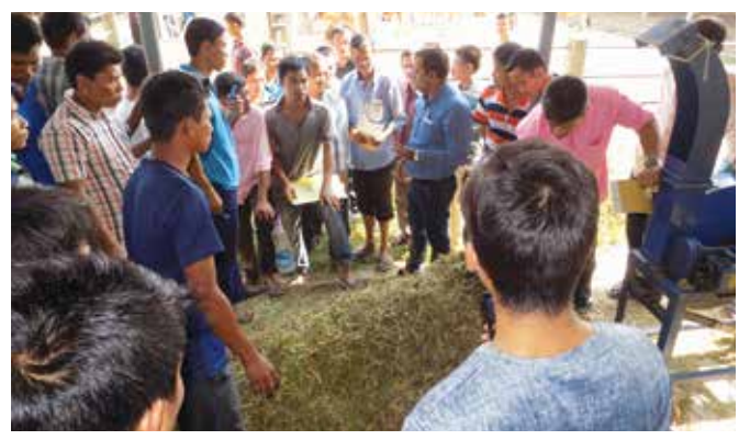
Visit to Vermi Compost unit of a progressive farmer

The institute organised RUDSETI Bazaar from 2<sup>nd</sup> to 13<sup>th</sup> January 2020 on the occasion of Regional SARAS Mela at Agartala, wherein past trainees of RUDSETI participated and made handsome sales.