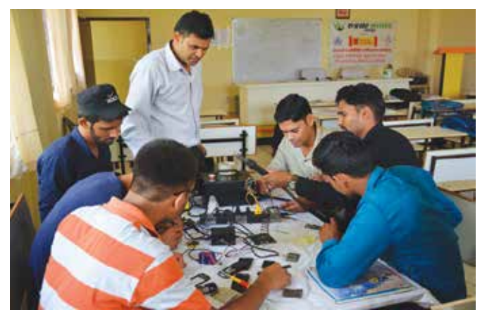
Trainees in Cell Phone Repairs & Service practical

The Institute participated in World Youth Skill Day campaign.