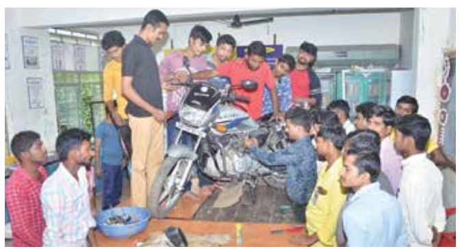
Trainees in Two Wheeler Mechanic practical