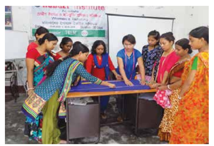
Trainees in Women's Tailor practical