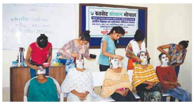
Trainees in Beauty Parlour Management practical