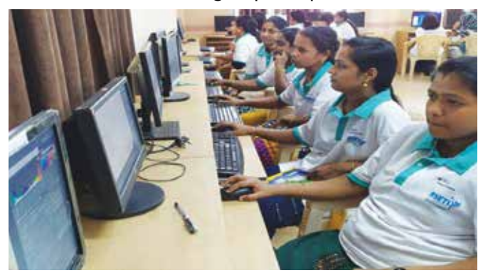
Trainees in Entrepreneurship in Desktop Publishing practical

The institute conducted one batch of PMEGP benefiting 11 upcoming entrepreneurs and four batches under Kudumbashree benefiting 89 participants.