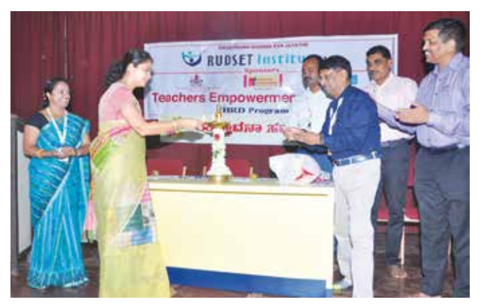
Leadership and Personality Development - RUDSETI, Ujire