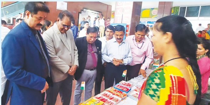
RUDSETI Bazaar, Ananthapuramu

Visit of Shri Purshottam Chand , GM, Canara Bank, CO, Jaipur - RUDSETI Bazaar, Jaipur