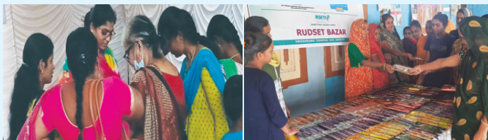
RUDSETI Bazaar, Nadiad

RUDSETI has been setting up stalls to provide information on training programmes of RUDSETI and to collect the applications for training programmes, on special occasions such as Krishi Mela, trade fairs, inaugural functions of bank