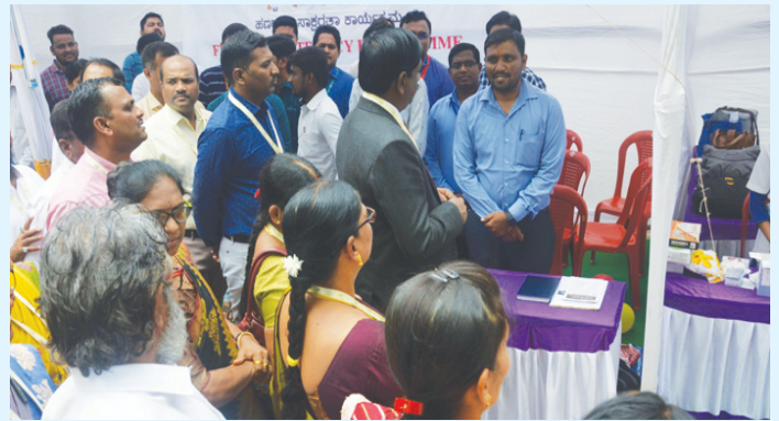
RUDSETI Stall, Brahmapura

Visit of Shri Vijaymahantesh Danammanavar , IAS, Deputy Commissioner, Vijayapura - RUDSETI Stall, Vijayapura