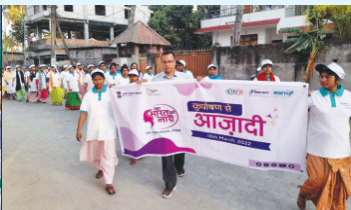
RUDSETI, Nagaon ↓