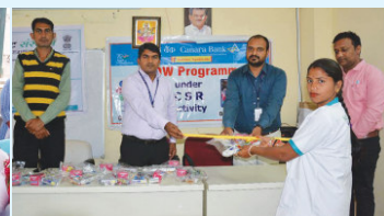
RUDSETI, Jaipur ↓