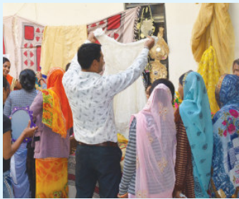
RUDSETI Bazaar, Baran