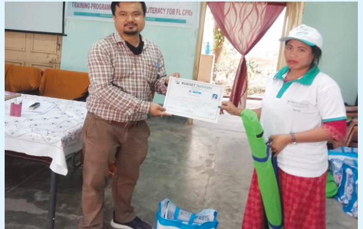
Distribution of Scholarship