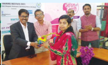
RUDSETI, Berhampore ↓