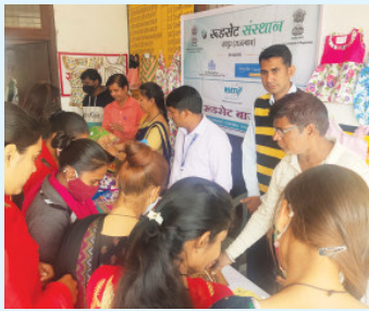
RUDSETI Bazaar, Jaipur