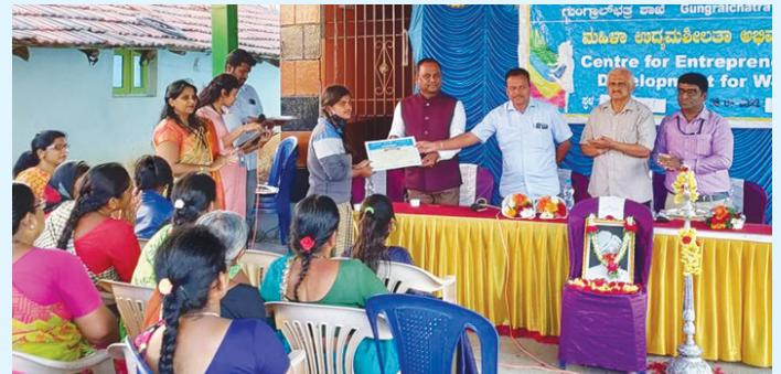
Awarding Course Completion Certificates