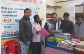
RUDSETI Bazaar, Bhopal ↓