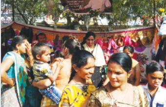
RUDSETI Bazaar, Nadiad ↓