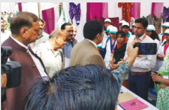
RUDSETI Bazaar, Bhilwara ↓