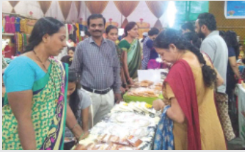
RUDSETI Bazaar, Pune ↓