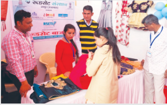
RUDSETI Bazaar, Jaipur ↓