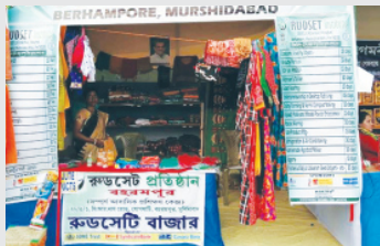
RUDSETI Bazaar, Berhampore ↓