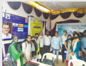
RUDSETI Stall, Vijayapura