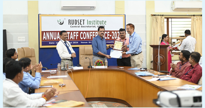
Second Prize RUDSETI, Ananthapuramu