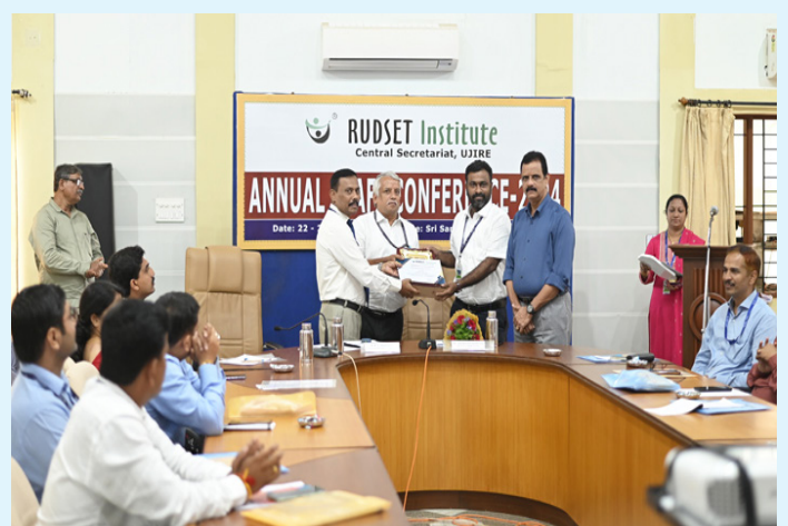
First Prize RUDSETI, Madurai ↓