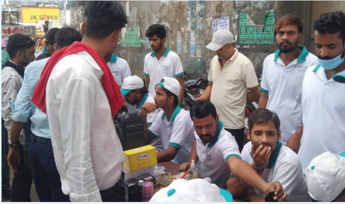
Free Dental Checkup Camp RUDSETI, Nadiad