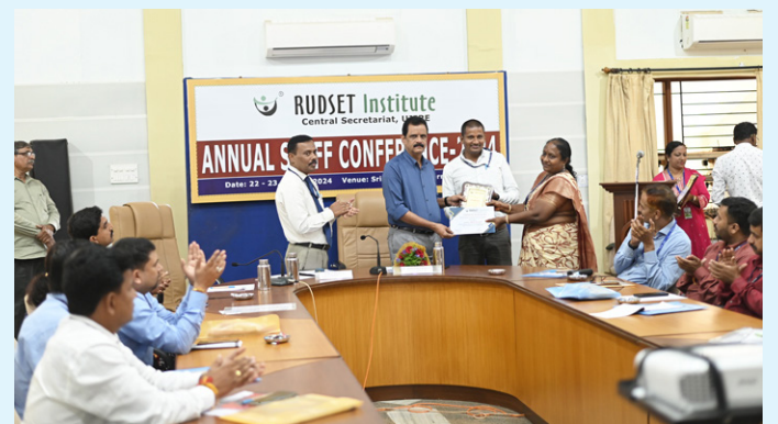
Third Prize RUDSETI, Chitradurga ↓