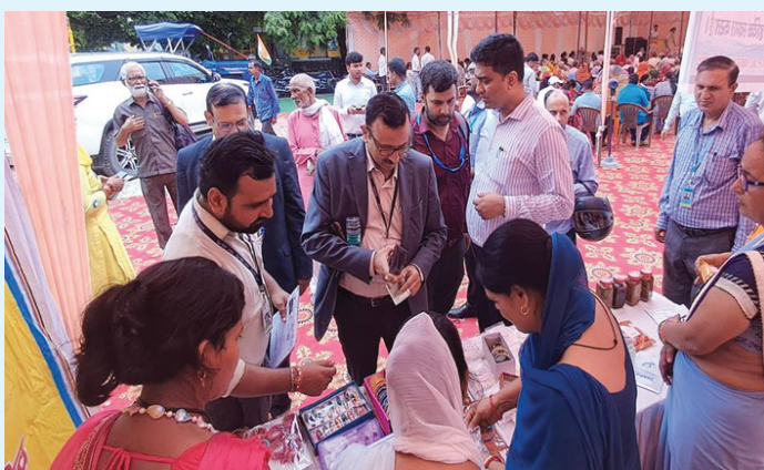
RUDSETI Bazaar, Ghaziabad