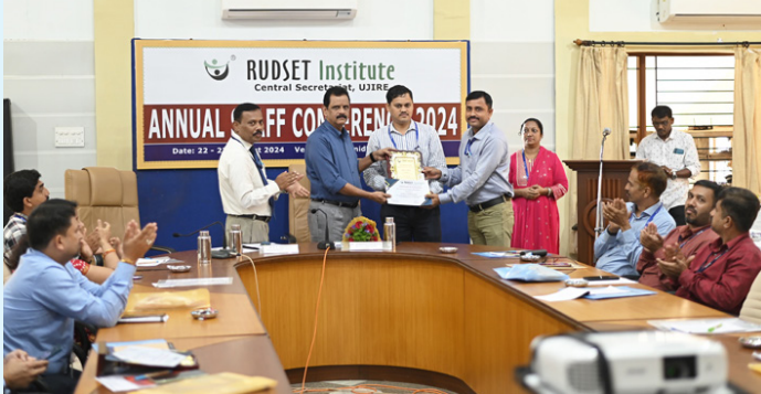
Second Prize RUDSETI, Hajipur ↓