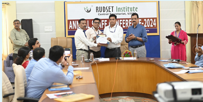
Third Prize RUDSETI, Kannur ↓